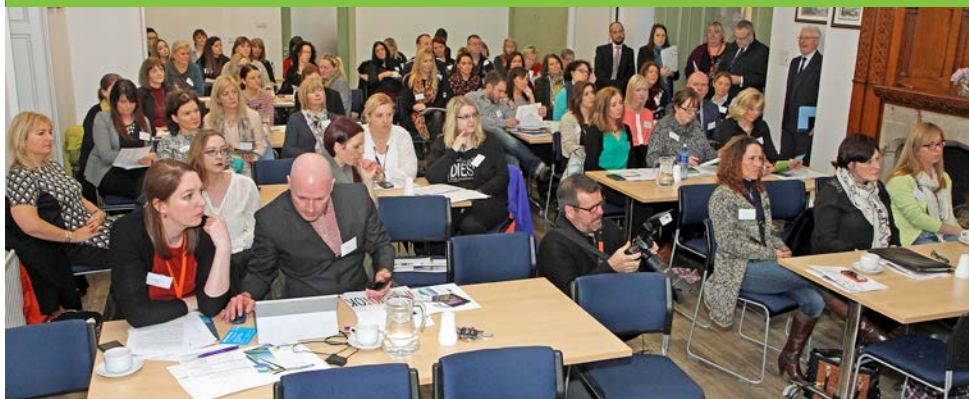
FRONT COVER IMAGE:

Representatives from local organisations at the Rowan Stakeholders Forum regional conference in February.