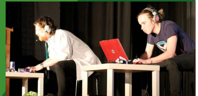
Two of the actors depicting the potential dangers of the internet in Control Alt Delete.

Lisburn and Castlereagh PCSP hosted a separate play with local police and Lisburn YMCA which portrayed the dangers of making friends