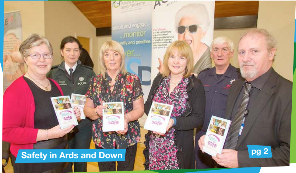
Safety in Ards and Down