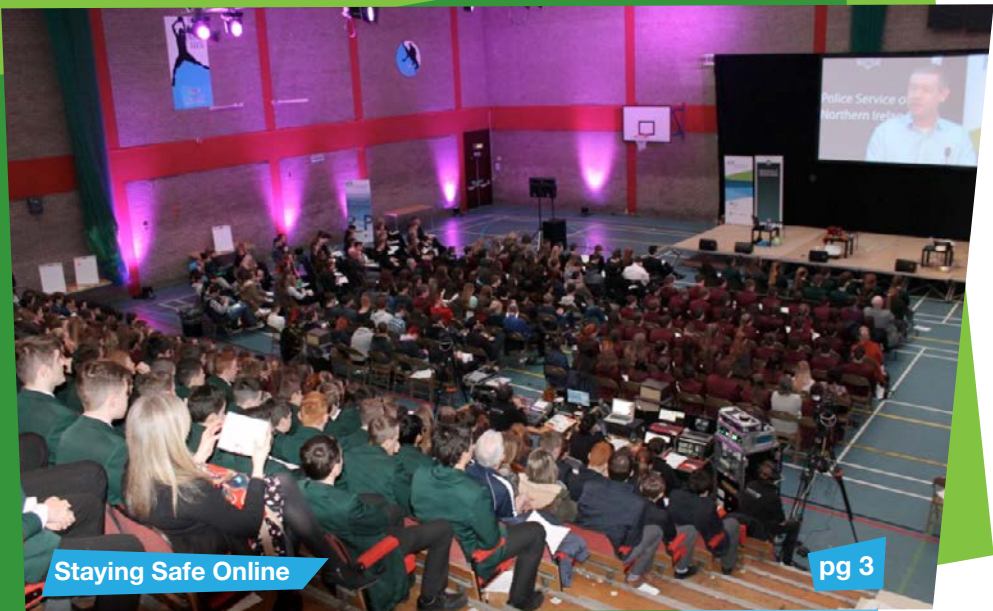
Staying Safe Online