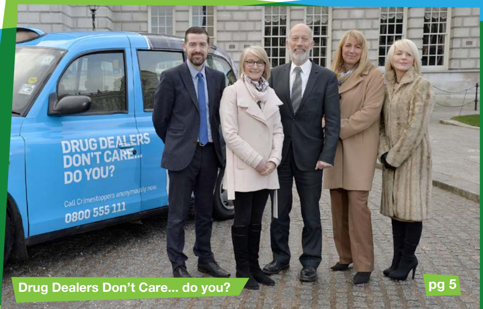
Drug Dealers Don't Care... do you?