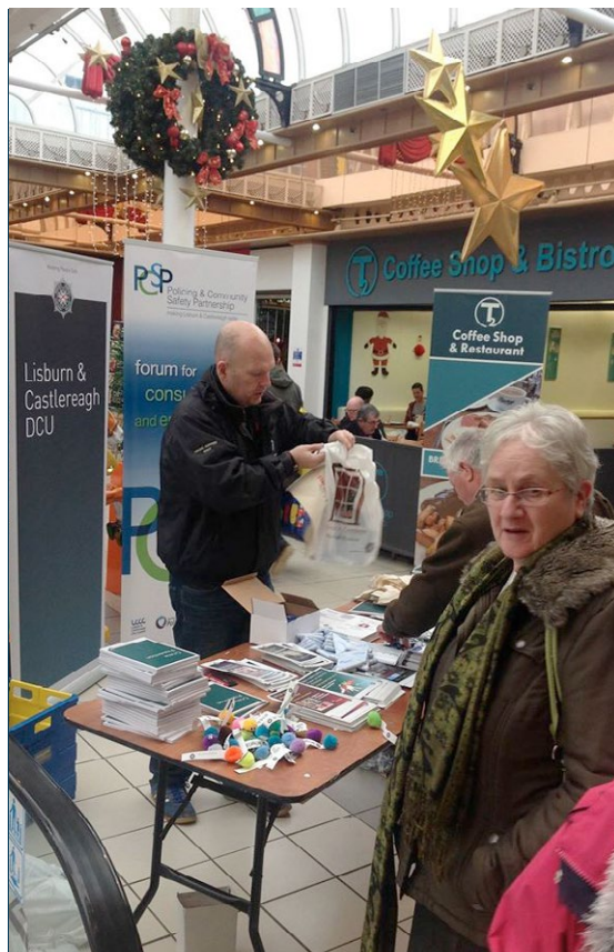
The PCSP and PSNI Crime Prevention Officer at Bow Street Mall before Christmas getting the safety message out to shoppers.

Lisburn and Castlereagh PCSP were zipping round various shopping centres in the run up to Christmas to bring the safety message to people where you could be guaranteed to get them - out shopping. The PSNI Crime Prevention Officer was with them at Bow Street Mall and members of the Police Liaison Committee were there to give advice and recruit new members. You don't get something for nothing!