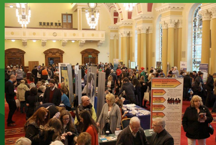
Signposting information in Belfast.

Statutory, community and voluntary groups including the PSNI, Victim Support, Samaritans, Fire and Rescue Service and Belfast City Council were available to talk through a variety of issues ranging from home safety schemes to fire prevention.