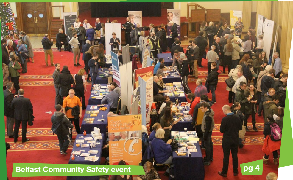
Belfast Community Safety event