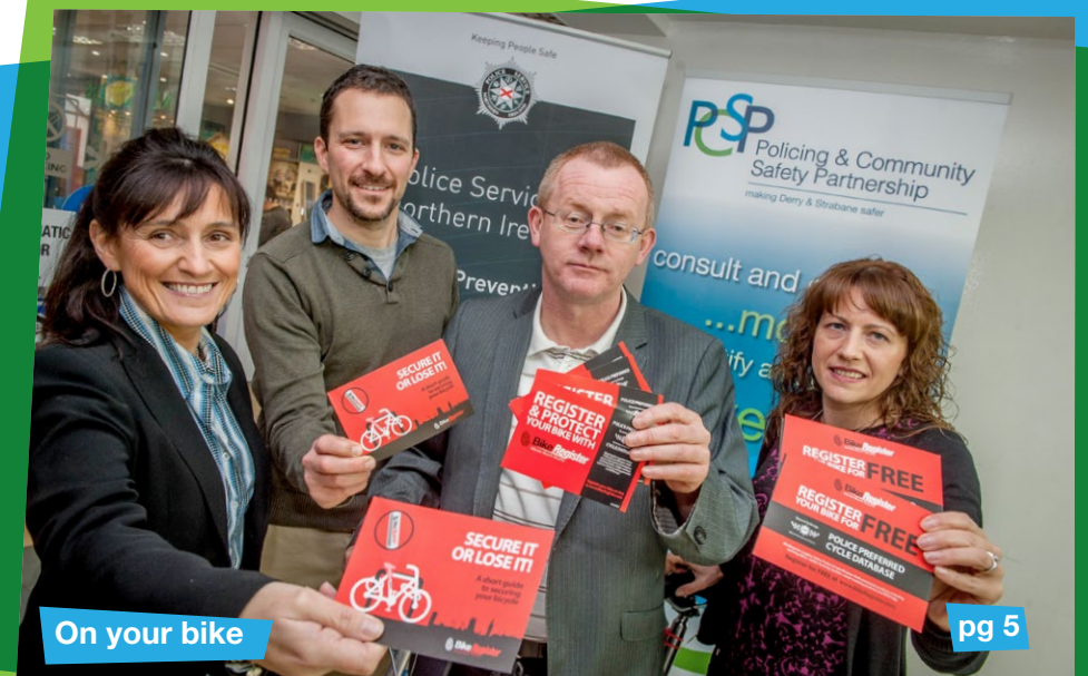
On your bike