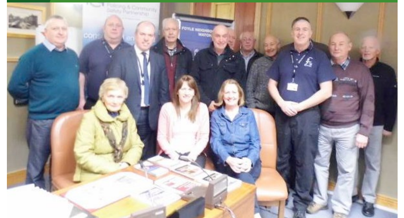
Neighbourhood Watch coordinators in Derry get an update at the PSNI Crime Prevention Officer for Foyle and the Community Safety Wardens.

Still in Derry, the PCSP have been giving their support to Neighbourhood Watch Schemes around the area. At their quarterly meeting, Neighbourhood Watch coordinators got updates from the PSNI Crime Prevention Officer for Foyle and the Community Safety Wardens and had some very productive discussions on personal and home safety. They also focused on how to look out for and deal with bogus callers and scammers.