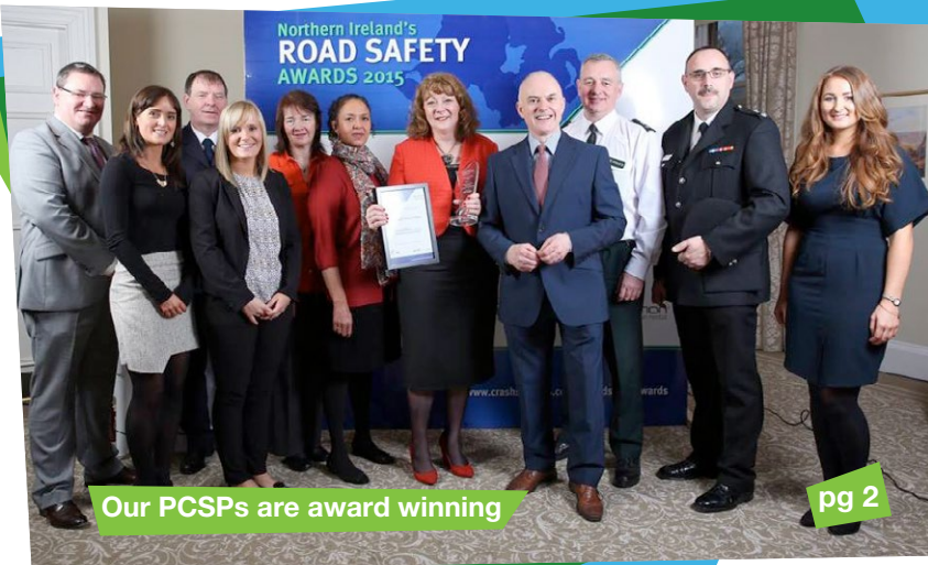
Our PCSPs are award winning