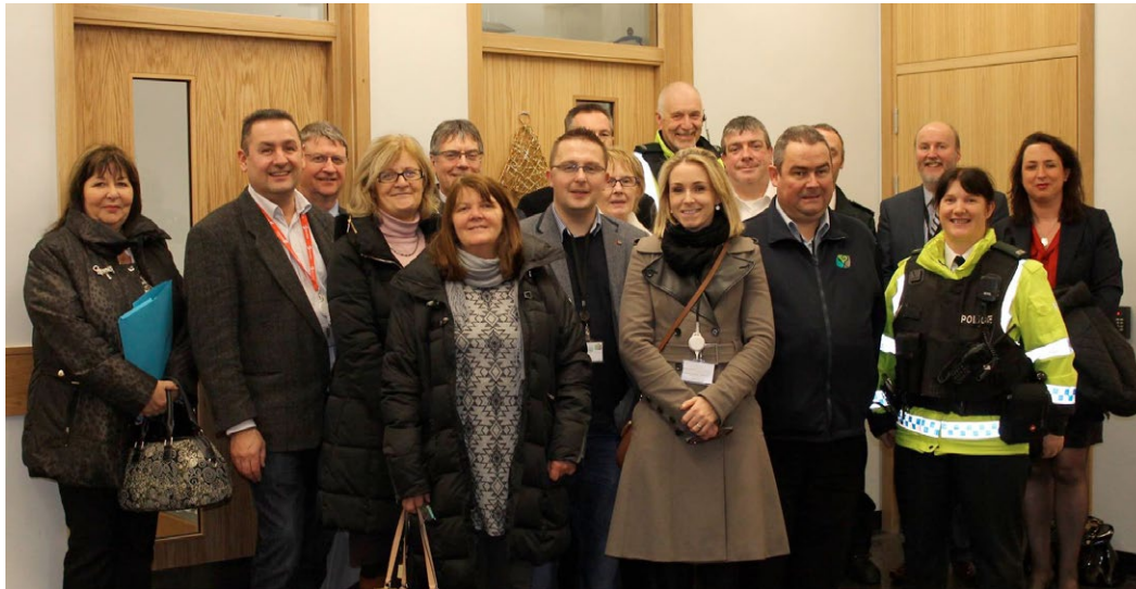
Members of the Newry, Mourne and Down PCSP took time out to check out the new PSNI station in Downpatrick before their quarterly meeting in December.