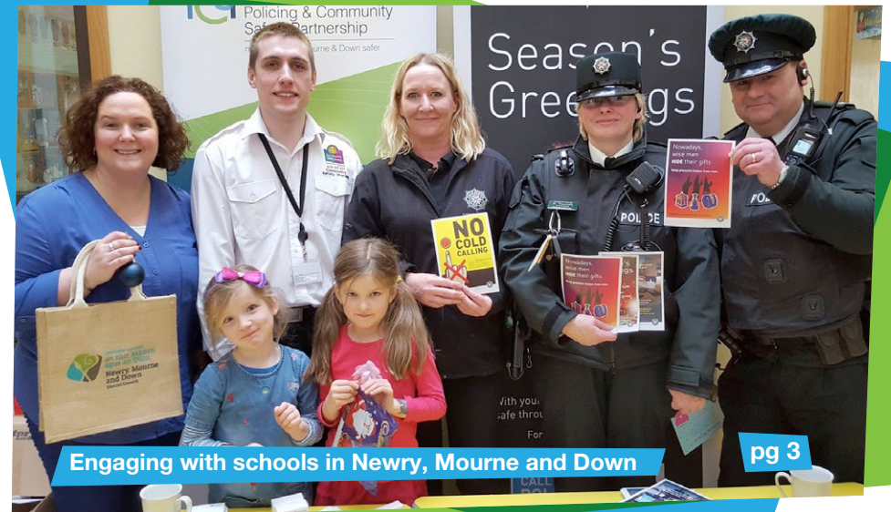
Engaging with schools in Newry, Mourne and Down