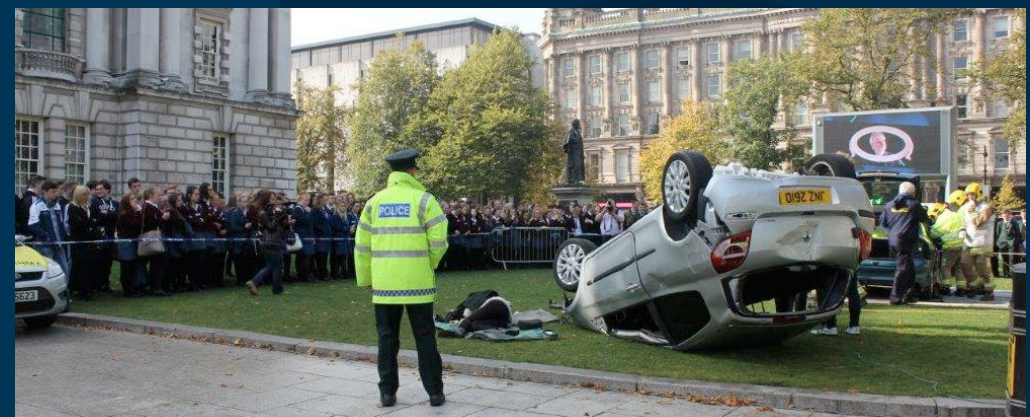
The recent Roadsafe Roadshow at Belfast's City Hall.