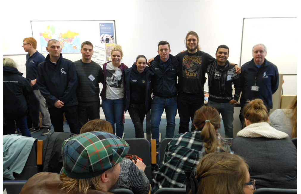
Northland Community Safety Wardens pictured with some of the International Students.

FRONT COVER IMAGE: Students from North Coast Integrated College learning about Disability Awareness at the RADAR centre.