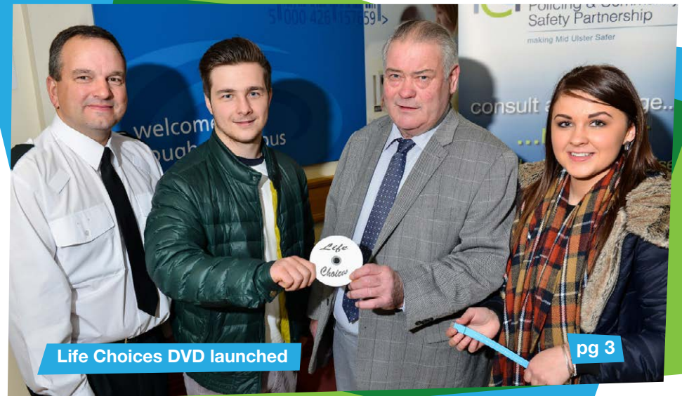
Life Choices DVD launched