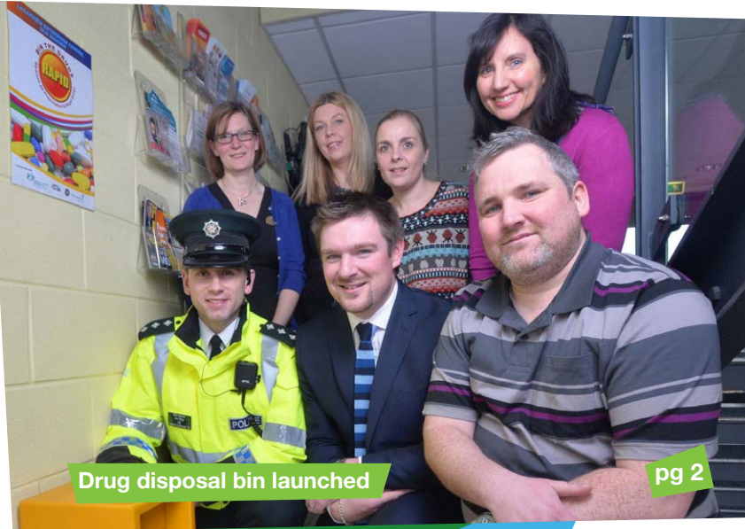
Drug disposal bin launched