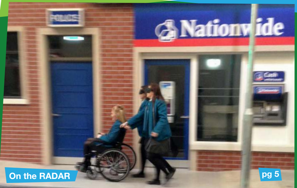
On the RADAR