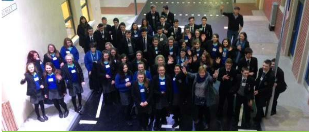
Pictured at one of the RADAR visits organised by the PCSP are pupils from Ballycastle High School.