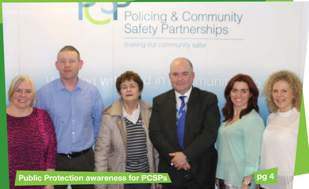
Public Protection awareness for PCSPs