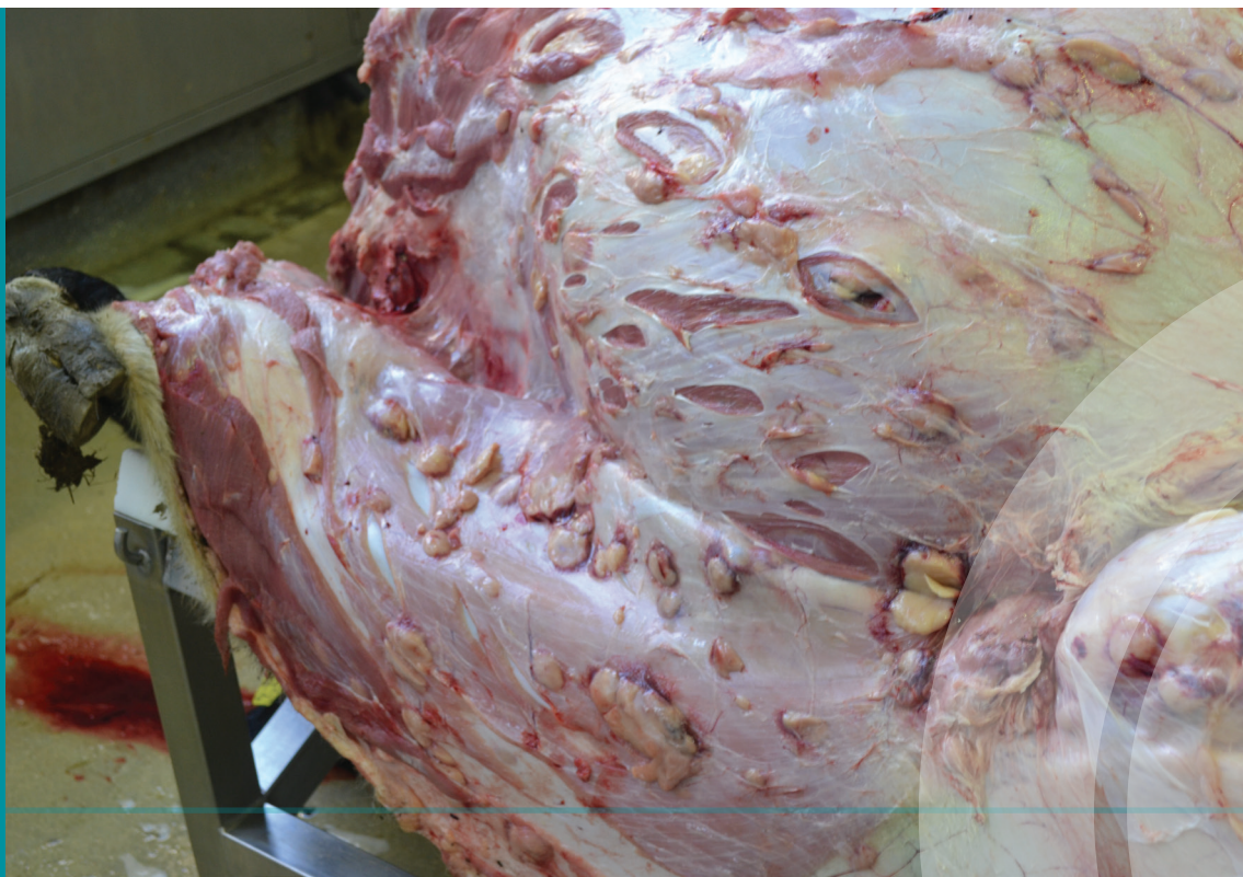
Figure 2 Cutaneous lymphoma in a calf

Two cases of sporadic bovine lymphoma were diagnosed in individual animals in separate herds during the reporting period. It was noted that the so-called sporadic types of bovine lymphoma are not associated with retrovirus (bovine leukaemia virus / BLV) infection and are classically described as being of the calf or juvenile form, the thymic form, the adult form or the cutaneous form of the disease (FIGURE 2).