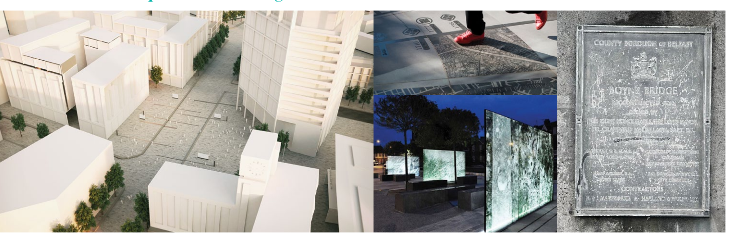
Adaption and Re-use - Reinterpreting the bridge

Historic Interpretation – Paving , timeline and screens