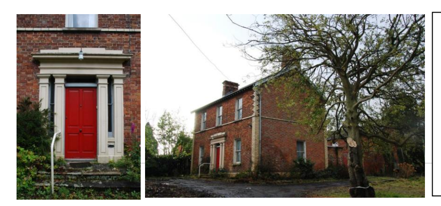
Left: Navigation House, 134 Hillsborough Road, Lisburn

The Lagan Canal Trust has now relocated their offices to Navigation House, with the future ambition of acquiring the property and reusing the existing building and outbuildings as a visitor centre and teaching centre as part of the 'Discover Waterways Lisburn' project, subject to planning permission, listed building consent and scheduled monument consent.