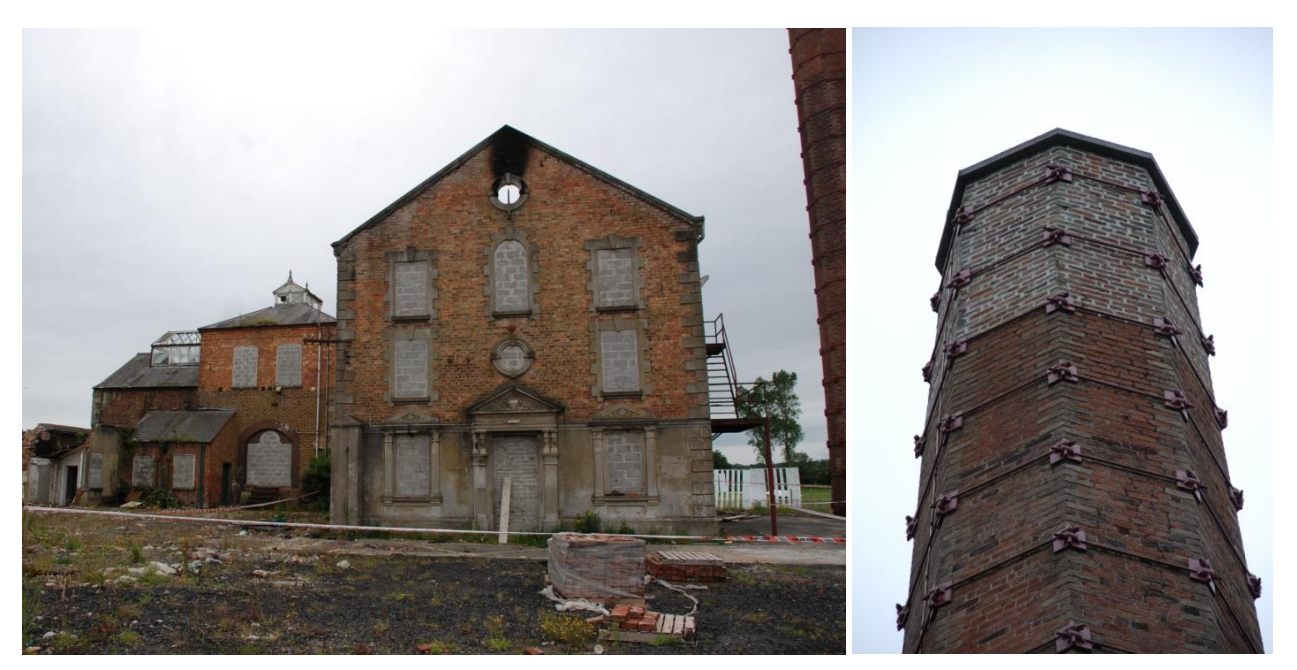
Front cover image & above: Lidells Mill, Donaghcloney, Grade B2 listed building, initially protected by a BPN© DfC

Historic Environment Division (HED) transferred to DfC and Strategic Planning Division (SPD) functions transferred to Dfl. Respective departmental powers under the Planning Act (Northern Ireland) 2011, have been set out in the The Departments (Transfer of Functions) Order (Northern Ireland) 2016.