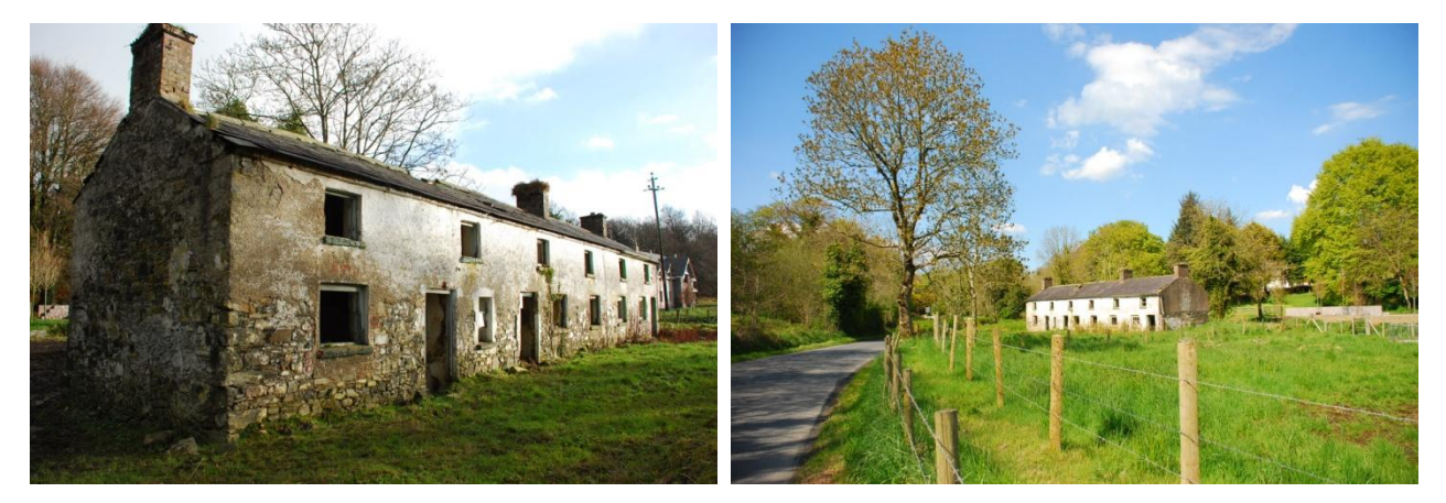
Above: Dundrum Road, Tassagh, B1 Listed Terrace, protected initially by BPN

Notices. Engagement with councils who want to set up appropriate procedures in regard to this facet of heritage protection is welcomed by HED.