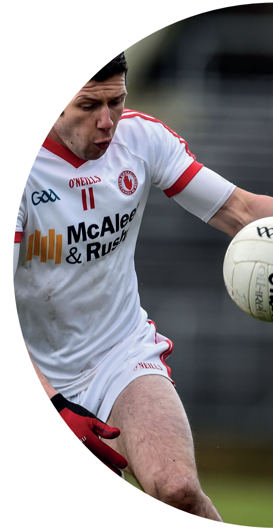
Table 3.2 indicates that Northern Ireland is the first economy among the ten considered in terms of the share of sport-related GVA in the economy. This corresponds to 2.6% of its total output. The same order is reproduced in the case of employment in Table 3.3. In terms of sport-related employment out of total employment, at 3.1% Northern Ireland is the best performing economy out of the ten considered. This however does not take into account the progress that has been recorded in England as a whole following the peak of the economic crisis.

was not followed in the case of Northern Ireland. For example, the 2008 data from Family Spending indicates that the average spend per household per week was £490 in the case of Northern Ireland, compared to £465 for England, £417 for Wales, and £433 for Scotland 3 , making Northern Ireland one of the highest spending regions in the UK. What sets Northern Ireland apart as an economy is that on average a household spends 94% of the disposal income compared with 83% in England, generating much better prospects for growth of the sport economy.