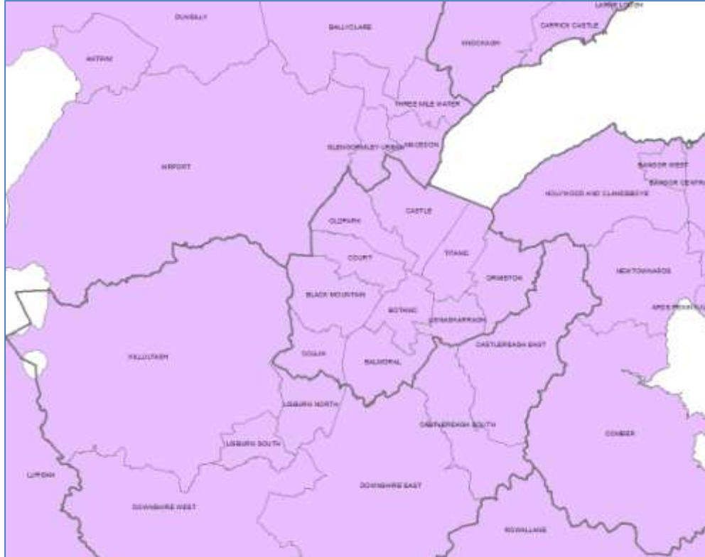
Inset: Greater Belfast