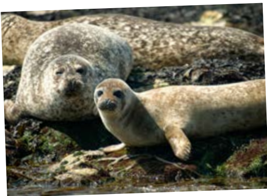
A young Rathlin Grey Seal with its mother

Rathlin's range of environmental designations and its relative remoteness are also unique selling points. Environmental preservation must be balanced against the needs of a living, working community. Ongoing support and collaboration will be essential elements in building on the islanders' commitment to their role as environmental custodians.