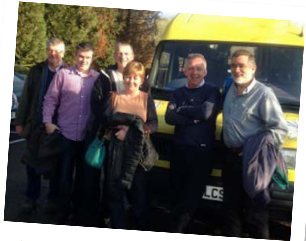
2014 Joint Rathlin – Departmental visit to the Scottish Islands