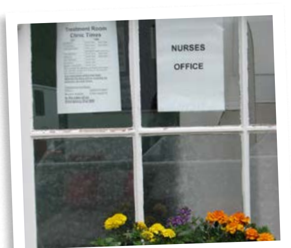
Finding appropriate ways to deliver essential services

Providers need to seek innovative ways of delivering services to meet the needs of the island community. A one size fits all approach is not appropriate. Advances in technology present a unique opportunity to reconsider how services can be delivered innovatively, particularly in respect of health and veterinary care.