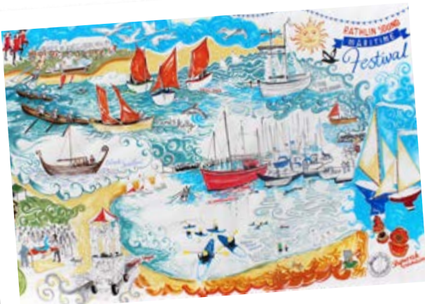
Rathlin Sound Maritime Festival Visual Minutes

The community-organised Rathlin Sound Maritime Festival has also grown and developed since publication of the previous Action Plan and is recognised as a signature event for Causeway Coast and Glens Borough Council. The festival attracts a large number of visitors and its successful design and delivery is a direct result of the community's initiative and their growing involvement in and support for the festival. The festival not only provides a best practice model but also demonstrates the RDCA's ability to organise and promote an extended programme of events in partnership with other local stakeholders.