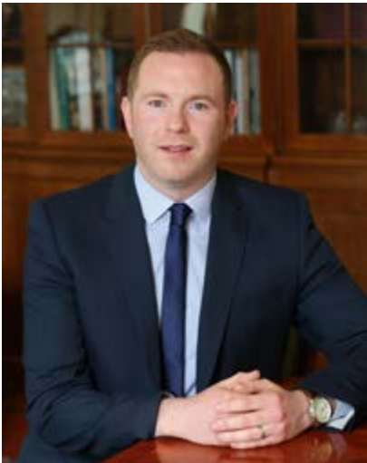
Chris Hazzard, Minister of the Department for Infrastructure

I am delighted to publish the Revised Rathlin Island Action Plan. Rathlin is a very unique and beautiful place. As the only off-shore inhabited island in the North of Ireland, Rathlin needs special consideration to ensure that it continues to grow and prosper.