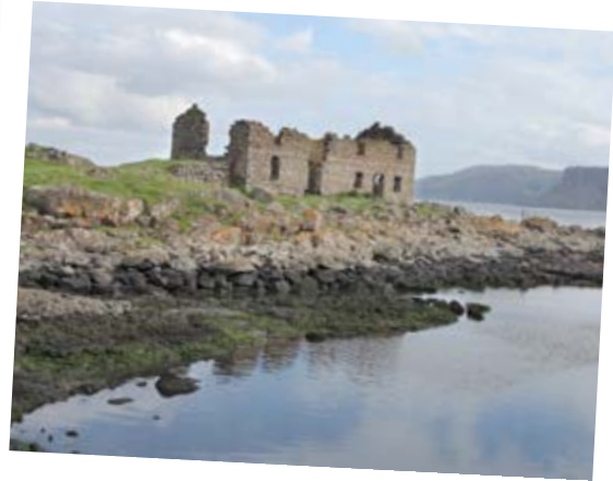
An example of Rathlin's built heritage