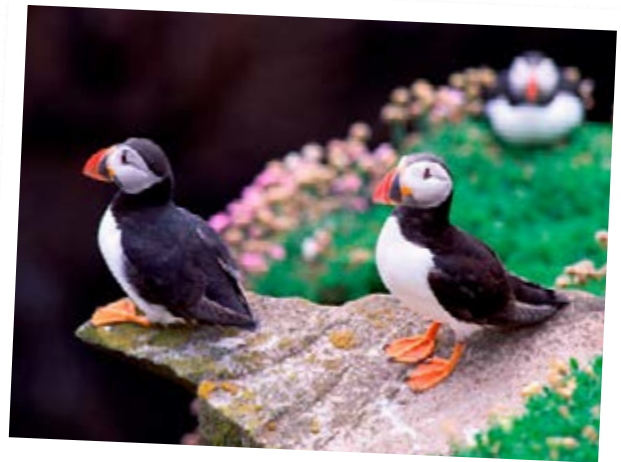
Rathlin has Northern Ireland's largest seabird colony