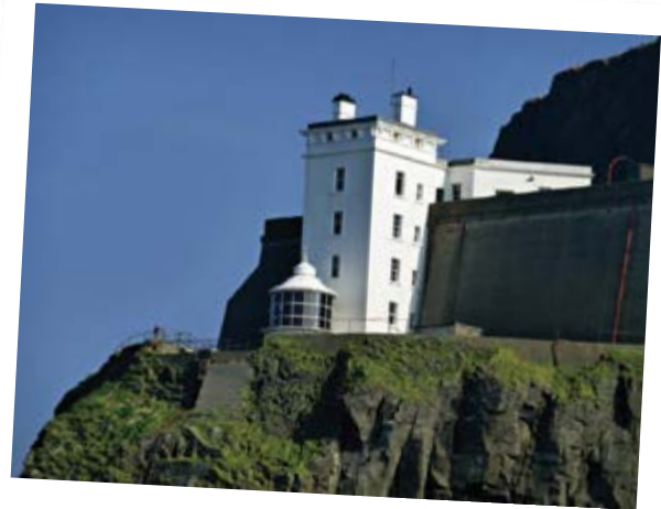
West Light visitor centre, one of the Great Lighthouses of Ireland