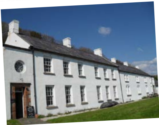
The Manor House Guesthouse & Restaurant

The development and promotion of Rathlin tourism and environmental products has been and will continue to be the key to the growth of the island economy. The island's creative industries and its natural capital are prime tourist draws. Increased involvement in and development of social enterprise will also impact positively on the island economy.