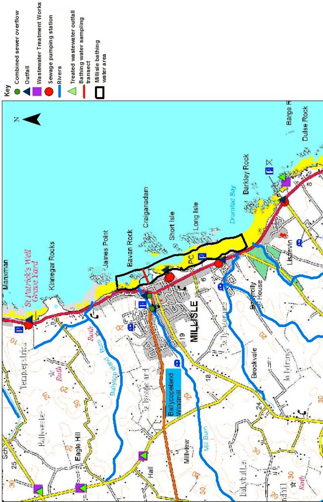
Map 1 Millisle Bathing Water - Potential Pollution Sources