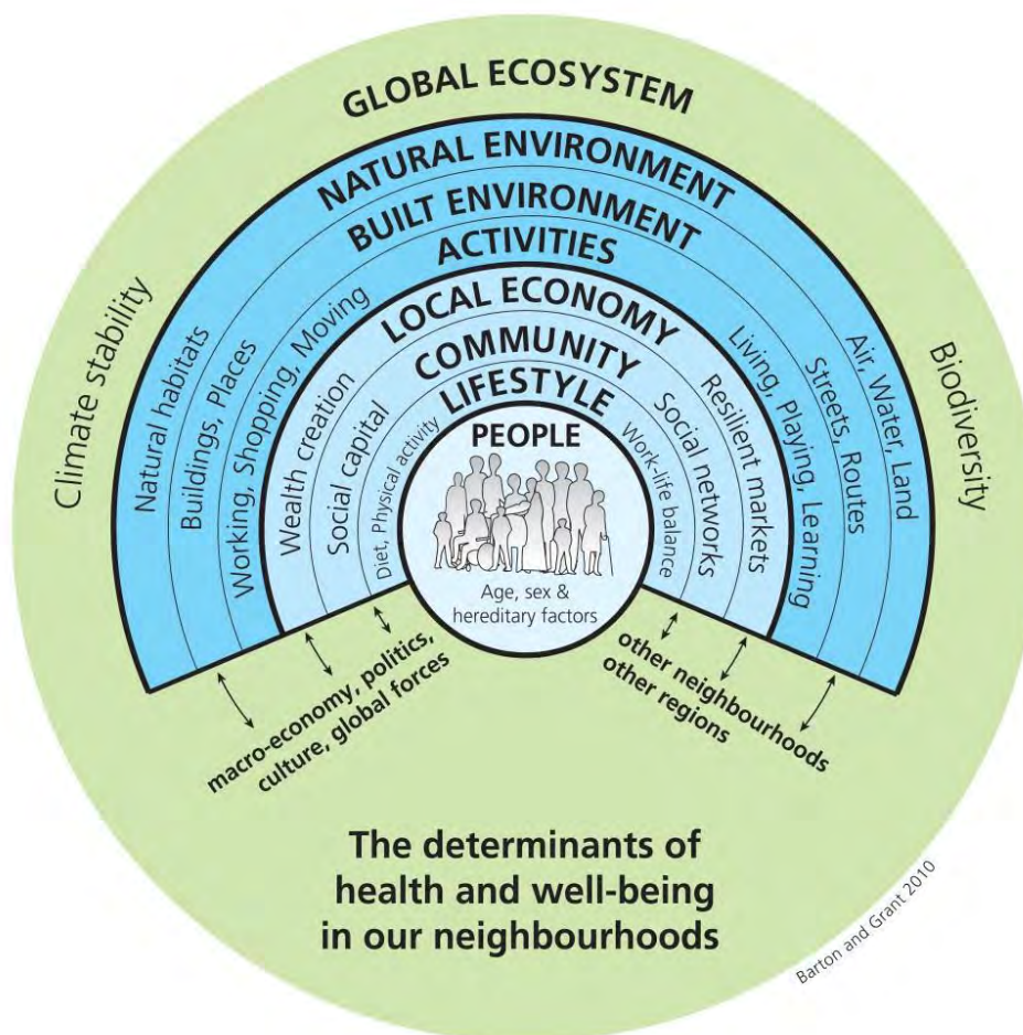
Diagram 1: The determinants of health and well-being in our neighbourhoods