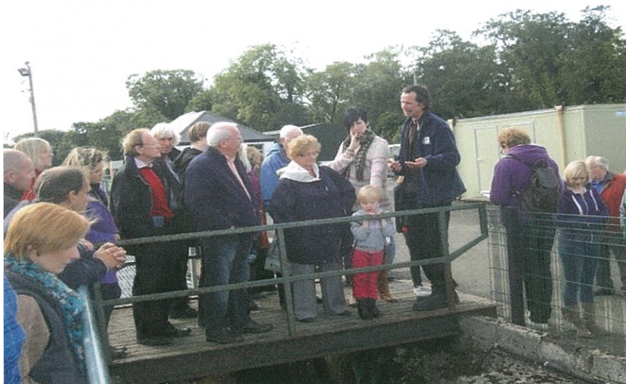
Visitors at the Salmon Research Station

The Department were invited by the Bushmills Traders Association to participate in the first ever annual festival of Bushmills - the 2012 Bushmills Salmon and Whiskey Festival. This gave the Department an opportunity to showcase the work being carried out at the Salmon Research Station and to offer visitors a chance to take a tour of the site and learn a little of the vital scientific work being carried out there. It was also an opportunity for the Department to play a part in the promotion of the village. The event was hugely successful with over 1000 visitors coming to the Salmon Research Station to see the work carried out there.