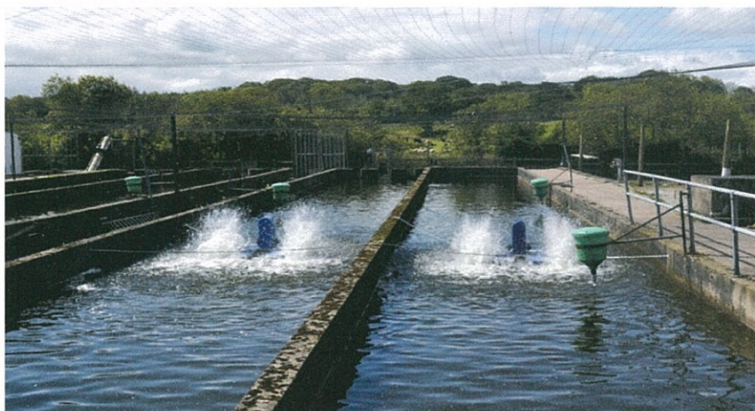
Ponds at Movanagher fish farm.

Staff at the fish farm are available to provide free technical advice on fish husbandry techniques, stocking and conservation issues to angling clubs organisations and interested members of the public.