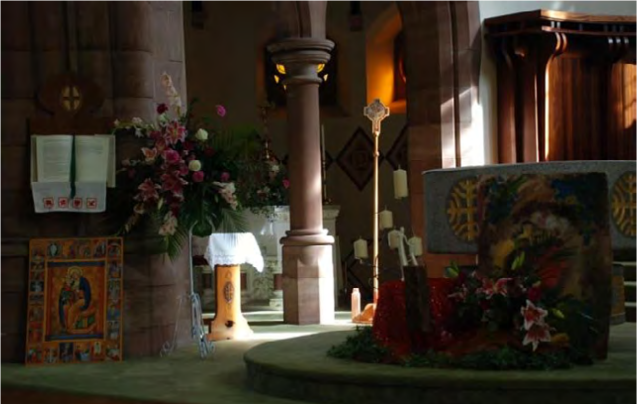
Places of worship are much more than just their architecture

However, there is also a need to manage these changes, ensuring that the special values of listed places of worship are sustained and enhanced for this and future generations. The review has concluded that, for listed places of worship, control and advice through the Listed Building Consent process, as required for all other listed buildings, is the most appropriate way to do this.