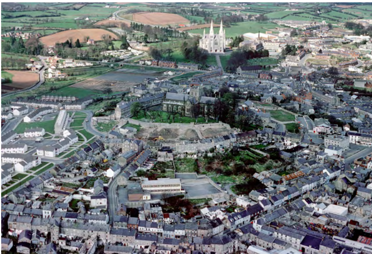
Armagh's cathedrals at the heart of the community

The consequence of removing the exemption is that Listed Building Consent would be required for any works involving the complete or partial demolition of a listed place of worship, or for its alteration or extension in a manner which would affect its character as a building of special architectural or historic interest - as is currently the case for all other types of listed building. HED would then participate in the process of assessing applications for Listed Building Consent as a statutory consultee to the new council planning authorities. It will also be able to offer pre-application advice to congregations to help them develop proposals, based on its experience and expertise in working with historic buildings.