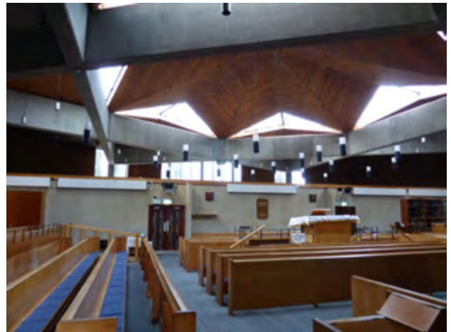
Most of Northern Ireland's places of worship are maintained and repaired to a high standard