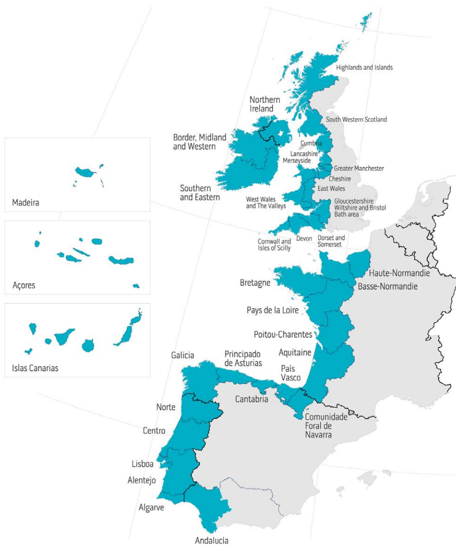
ATLANTIC AREA PROGRAMME 2014-2020