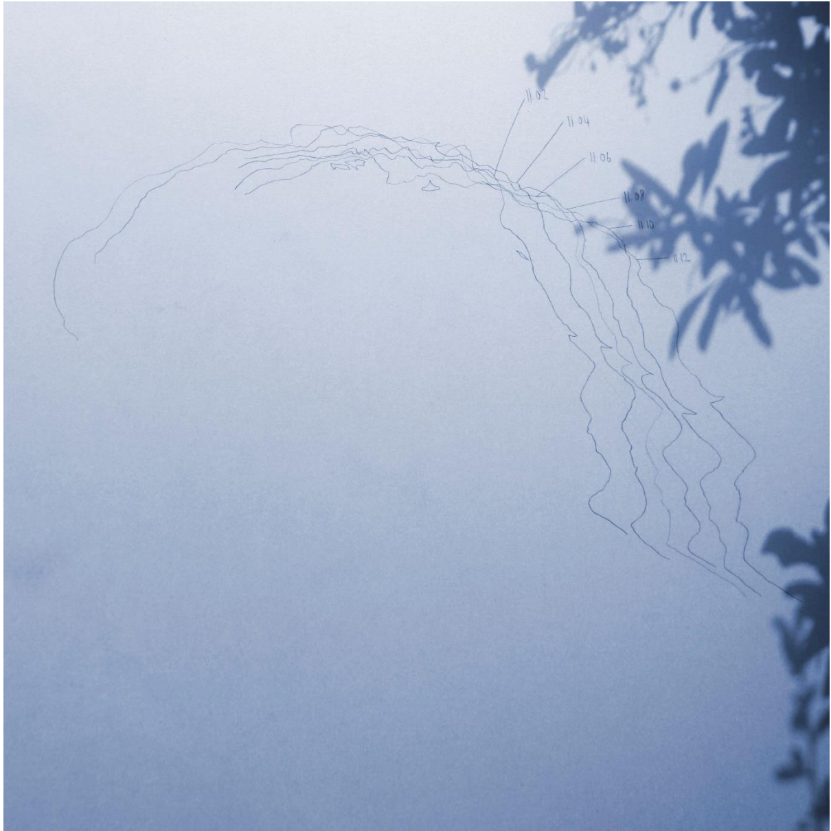
Figure 2: Shadow Map of Jessie Gilloway, aged 86 years, lives in a Nursing Home and participated in the Waterside Theatre's intergenerational arts programme