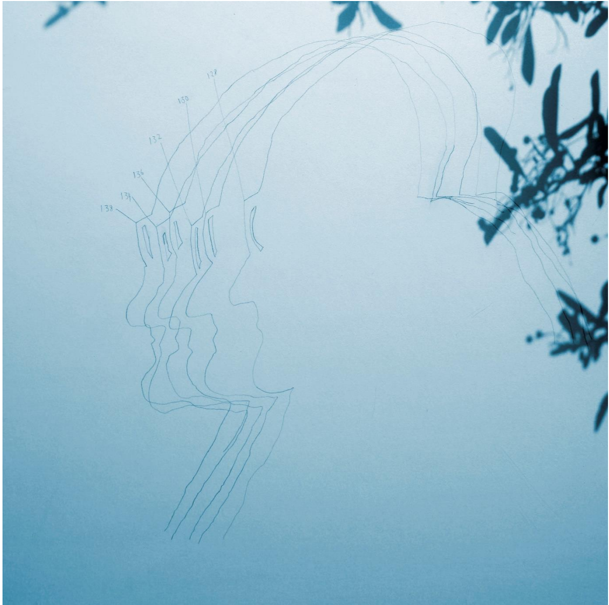
Figure 1: Shadow Map of Seamus Connell, aged 71 years, participated in Big Telly Theatre Company's Machinations programme with the Men's Shed