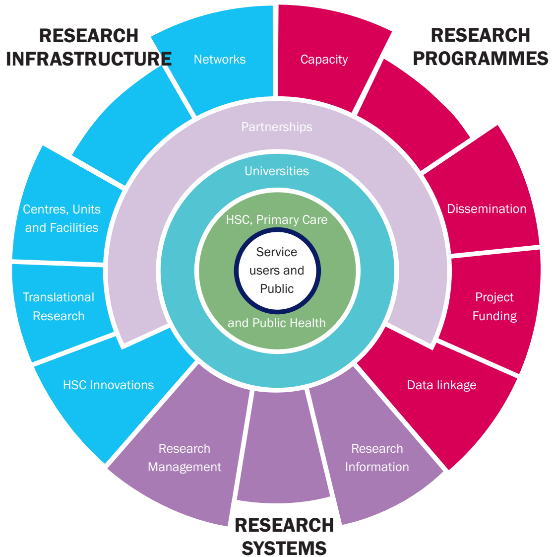
Figure 2 Current HSC research infrastructure, programmes and systems