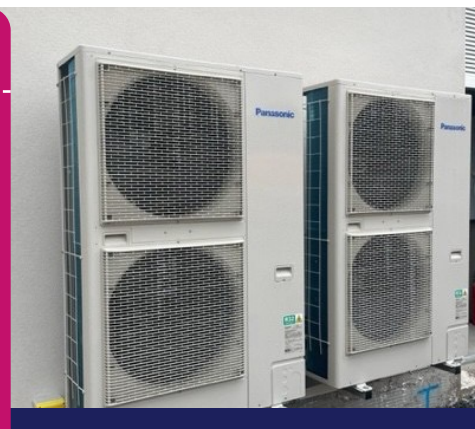
Double Stacked Air Source Heat Pumps

Established in Spring 2007, SE Trust is an integrated organisation, incorporating acute hospital services, community health and social services, serving a population of approximately 345,000 people with a budget of almost £500 million.