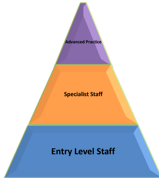
Figure 2: staffing structure of AHP services across trusts

Current structure in place has most staff working as expert generalists with only very few specialist clinics being delivered. The Clinical structure in the orthotist service should mirror other AHP services.