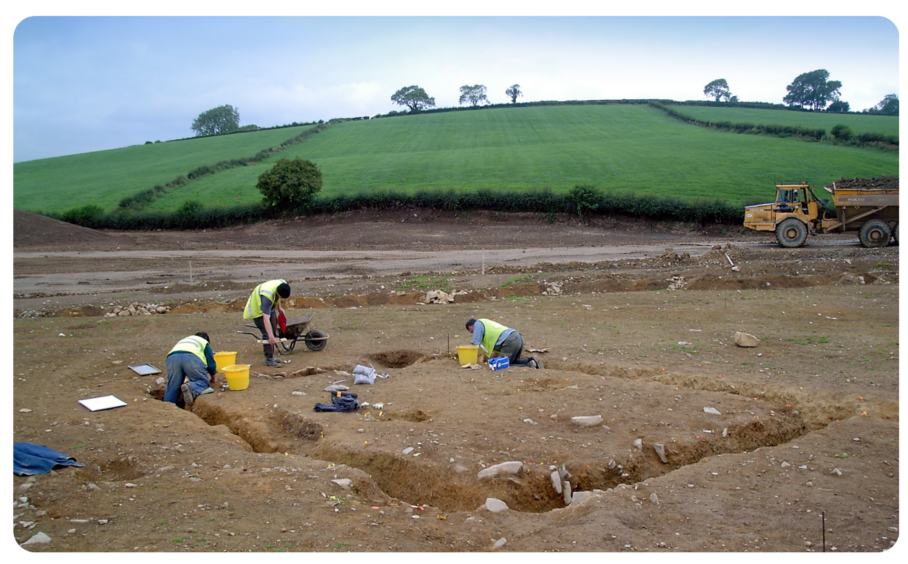
Excavation of a rectangular Neolithic House at Ballintaggart, Co. Down

Where the archaeological works on site are required by planning conditions and the initial site investigations uncover archaeology, the HED Planning Team and HED Excavation Licensing Team must both be contacted to arrange a site visit to agree the way forward. This is likely to involve moving to the resolution of archaeology stage (see Section 7 below).