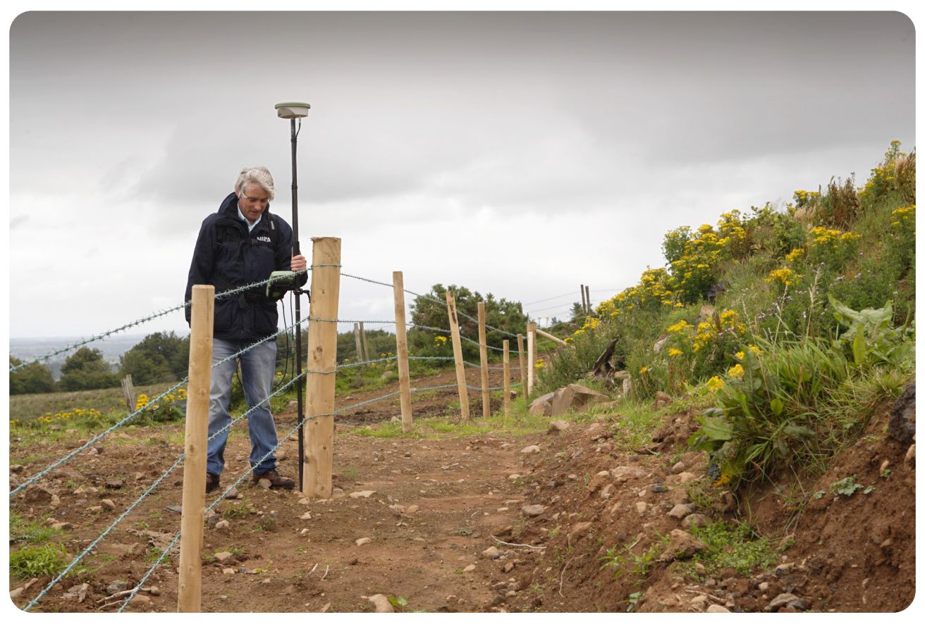
Surveying an early medieval rath at Magheramore, Co. Londonderry

The limit of investigation, ie the extent of opened areas and location of the archaeological trenches, must be accurately surveyed using equipment such as a survey grade GPS or a total station.