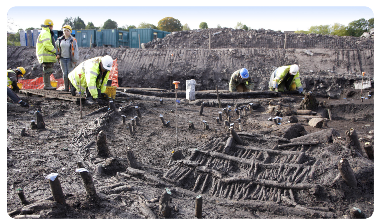
Excavation of preserved timbers at Drumclay Crannog, Co. Fermanagh, occupied during the early medieval and Medieval periods