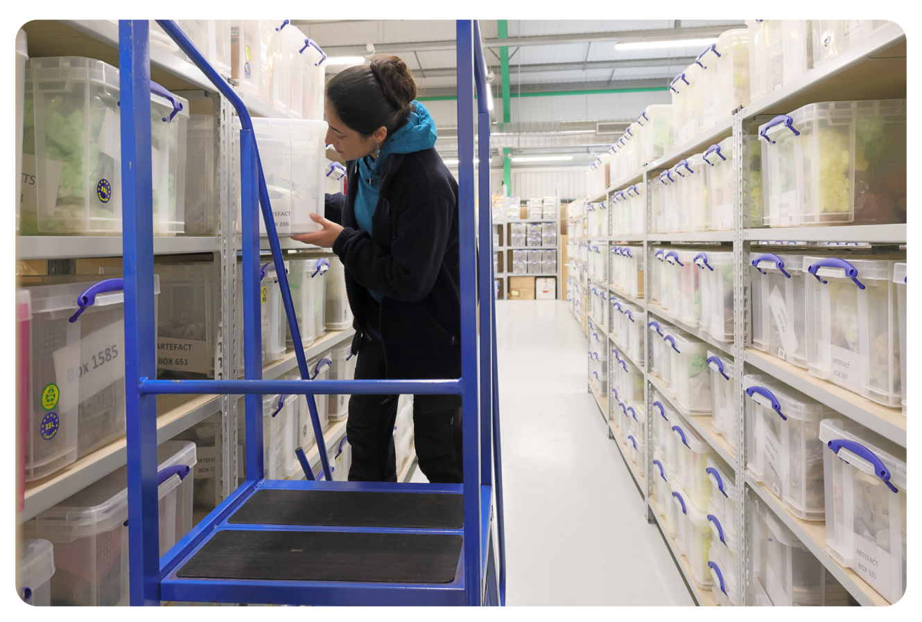
An archaeologist storing artefacts from an excavation in an archival store

Archives deriving from licensed excavations must be prepared to recognised professional standards (in line with the excavation licence guidelines and standard archaeological planning conditions (where relevant) in place since 2019).