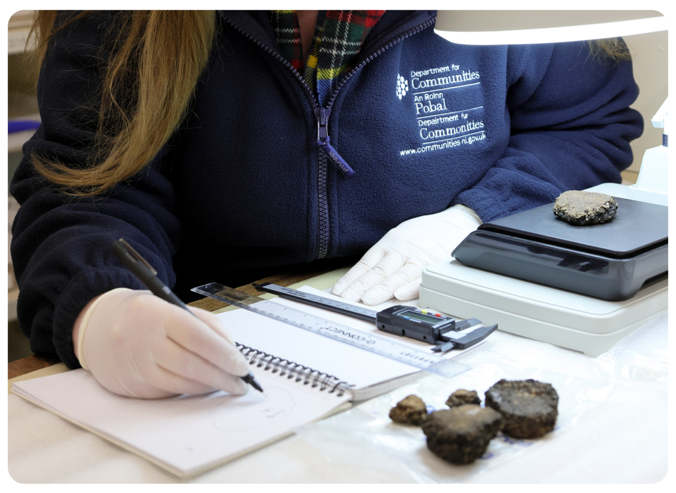
Examination of Late Bronze Age pottery from Killymoon, Co. Tyrone

Prior to commencing the comprehensive report, any uncertainty about the need for a post-excavation assessment report must be clarified with HED.