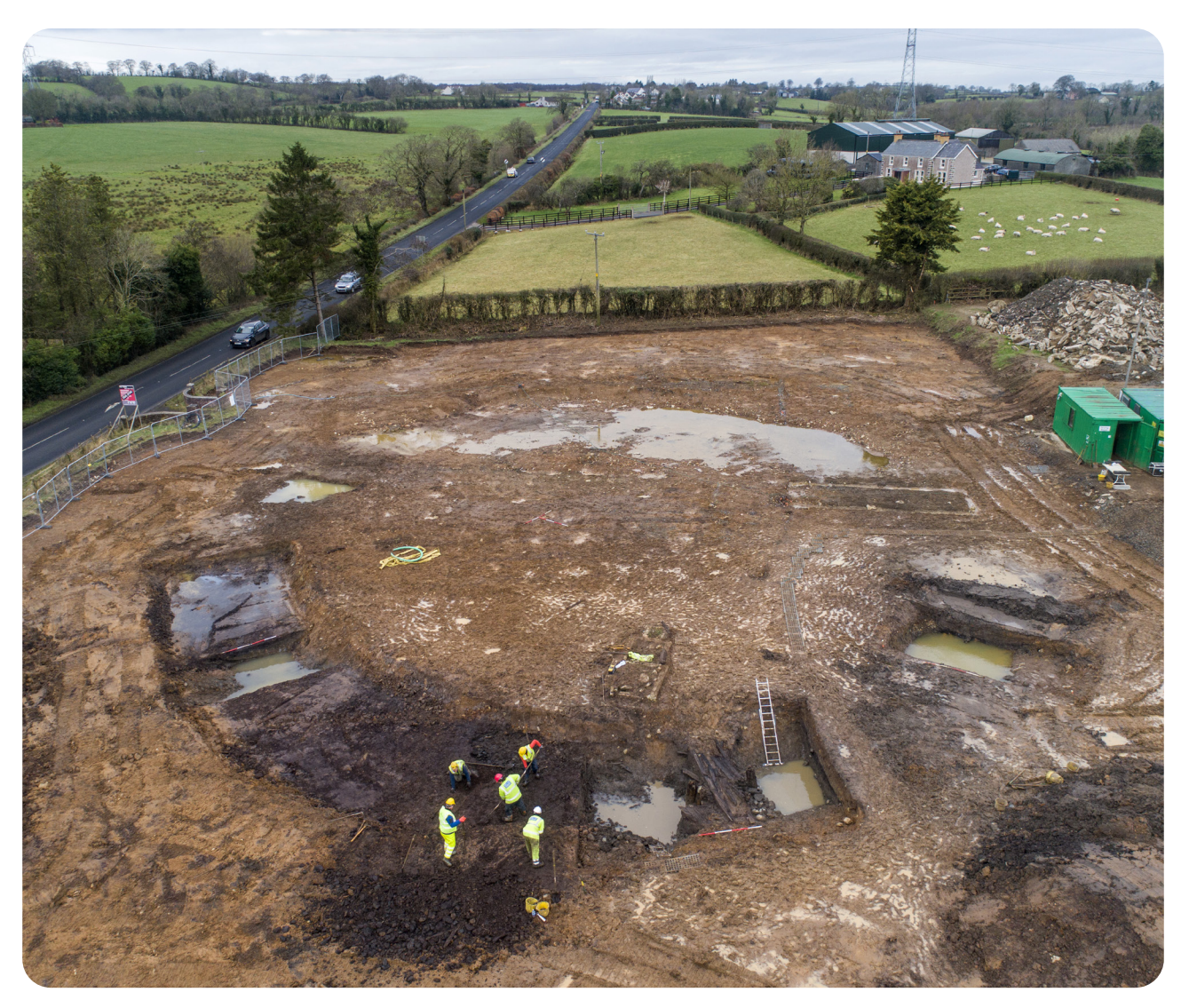
Excavation of an early medieval rath at Groggan, Co. Antrim

Projects outside the planning process are subject to a similar approach and applicants will have to demonstrate a positive impact on the public good by establishing that the benefits of the excavation would outweigh those of preservation in situ. Applications which do not adequately demonstrate this will be refused or returned for amendment.