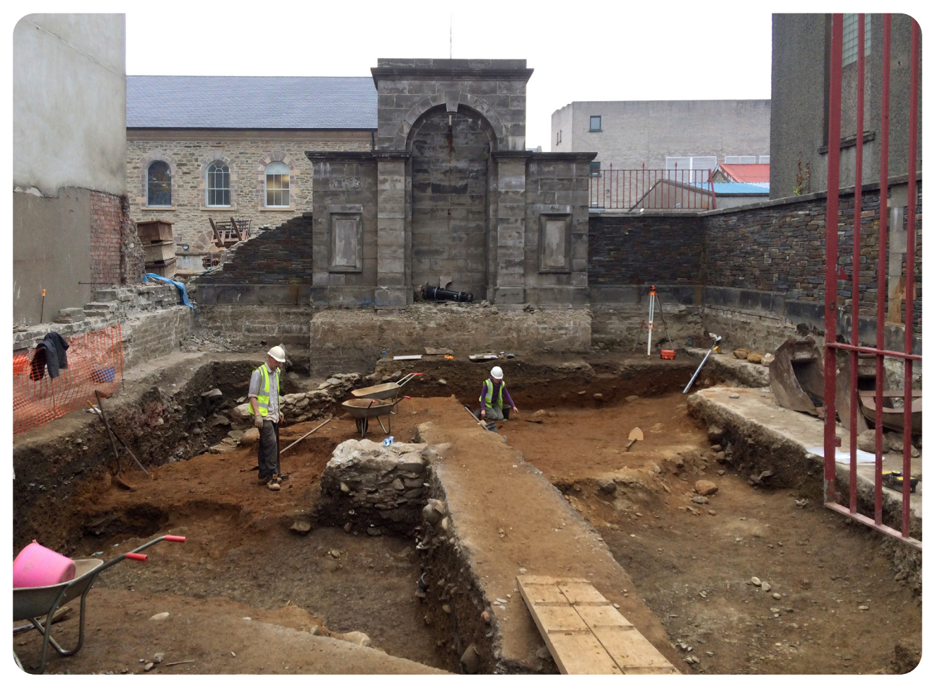
Excavations of medieval and post-medieval structures at Society Street, Derry/Londonderry