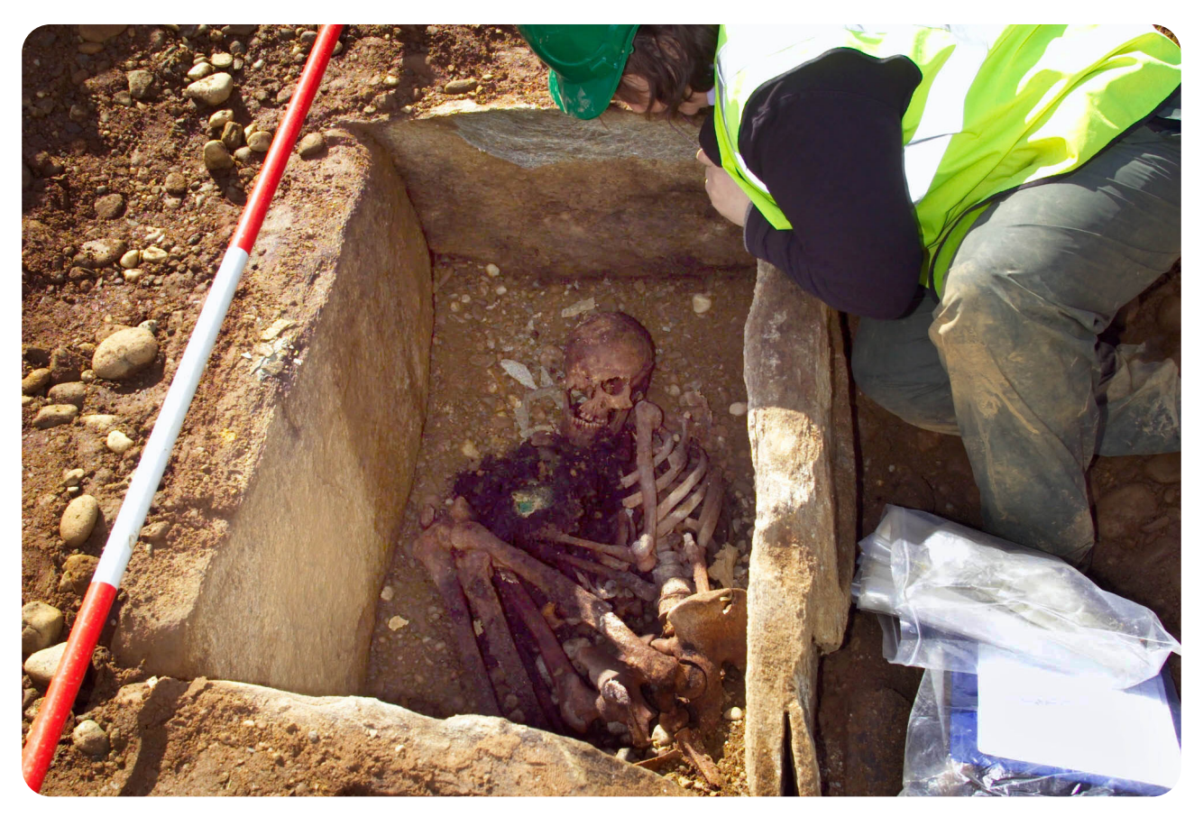
Early Bronze Age cist burial at Ballyoan, Co. Londonderry

Any human remains uncovered during fieldwork should initially be left in situ, covered and protected, and reported immediately to the Police Service of Northern Ireland (PSNI) and HED.