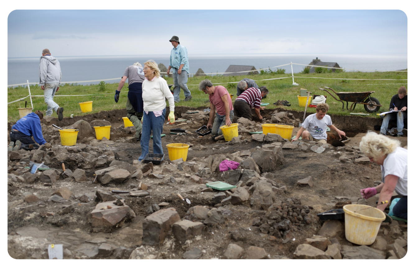
A community excavation at Dunluce 17th-century village, Co. Antrim

HED welcomes and supports community archaeology in Northern Ireland. Such archaeological investigations can be the entire focus of a heritage project or can occur as one part of a wider community project. HED wishes to see communities lead the proposals, but projects should be co-created with professional archaeological support to ensure that they will meet the requirements for the necessary archaeological excavation licence.