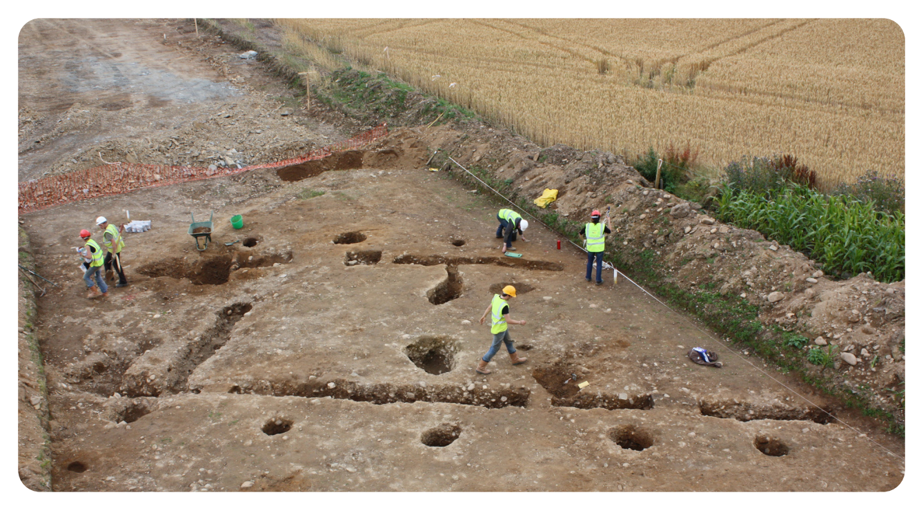
The excavation of a Neolithic house at Cloghole, Co. Londonderry