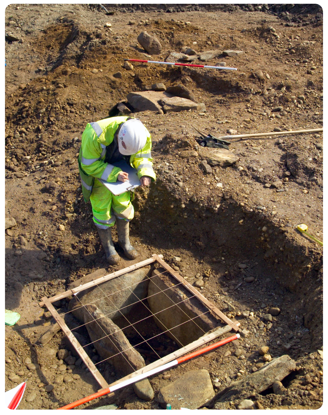
An archaeologist recording an Early Bronze Age cist burial at Ballyoan, Co. Londonderry