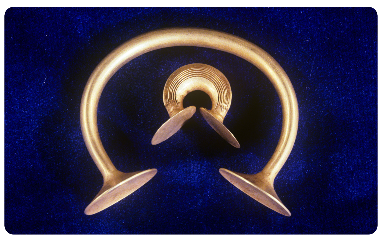
Late Bronze Age gold dress fastener and sleeve fastener from Killymoon, Co. Tyrone

Certain archaeological objects are classified as Treasure under the Treasure Act 1996, the Treasure (Designation) Order 2002 and the Treasure (Designation) (Amendment) Order 2023. These include