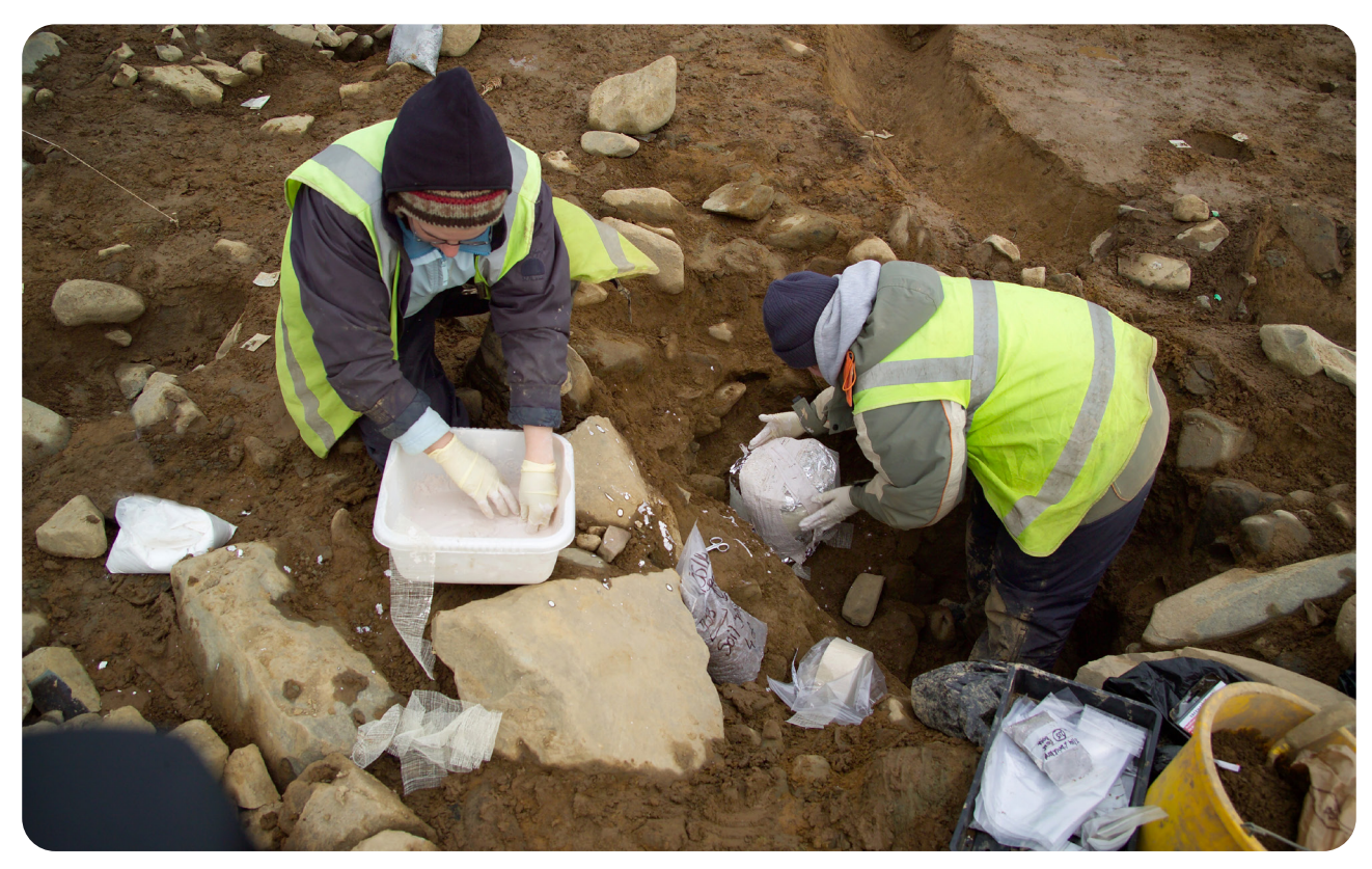
Archaeologists taking environmental samples from around a Bronze Age urn burial at Derrycraw, Co. Down

The study of human remains and environmental archaeology have been subject to fastpaced change in recent years, with new developments and advances, such as multi-proxy techniques in environmental archaeology, aDNA, and isotopic analysis. In this context, the environmental guidance within this document should be seen as an interim summary while DFC are working towards providing further guidelines for the application and practice of environmental archaeology techniques in Northern Ireland.