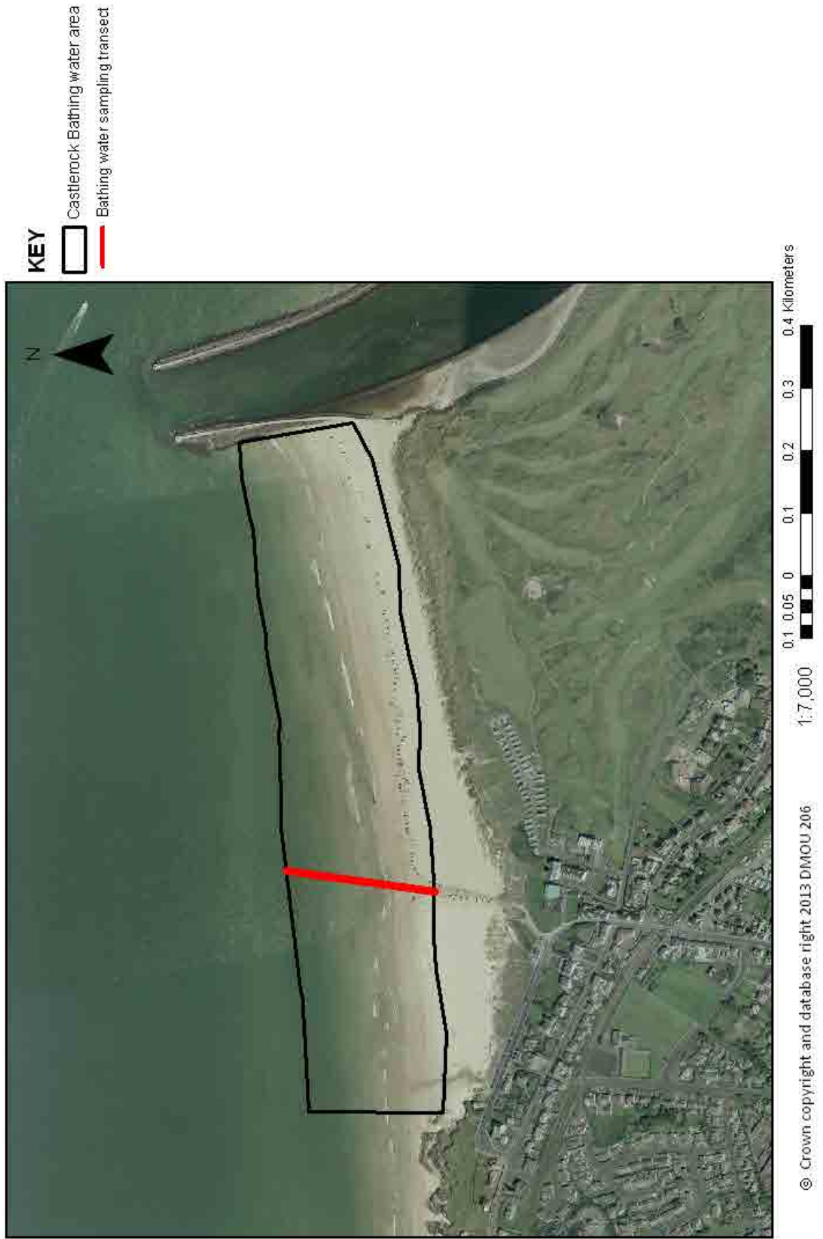
Map 2 Castlerock Bathing Water - EC Bathing Water Sample Location