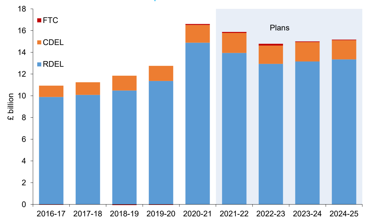
Chart 1 – Executive DEL outturns and plans

for 2021-22 was still being inflated by the Barnett consequentials of temporary spending in response to Covid-19. There is no definitive way to judge the generosity of the Block Grant settlement but putting it into slightly longer historical perspective rather than focusing too much on comparisons with 2021-22 (still a relatively unusual year) can be informative. Chart 1 shows the composition of the TDEL plans / Block Grants set at the Spending Review along with outturn figures back to 2016-17.