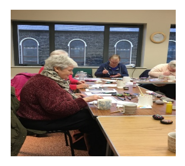
Grange Women's Group

Grange Women's Group availed of a full programme of activities, throughout the year which are organised with the help of the Neighbourhood Renewal Officer. The 2019/2020 year has seen the group participate in arts and crafts themed classes within the Community Access to Lifelong learning (CALL project) through the Northern Regional College, two mornings per week. The group also participated in physical activity course with Community Sports Network. All projects were stopped with COVID- 19 as the country was shutdown. 6 women participated.