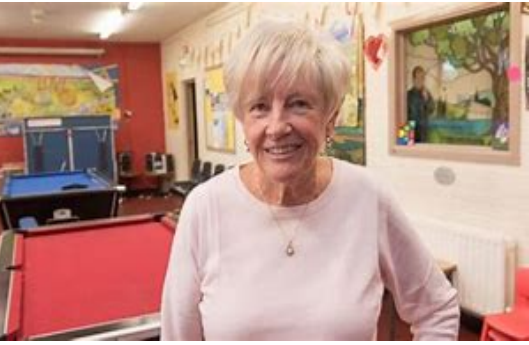
Young People at MUGA in Fountain