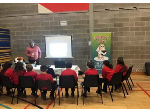
YES Project at Long Tower