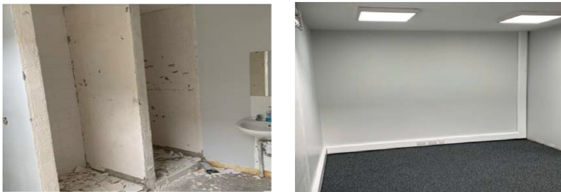
Before construction at OLT