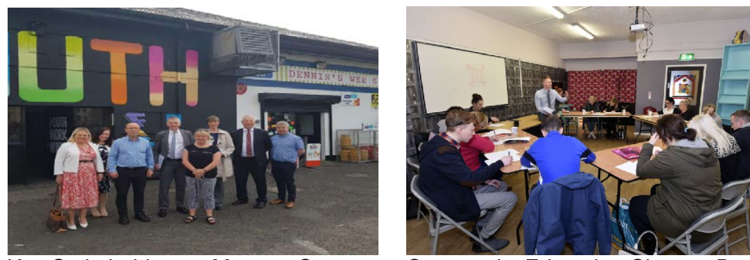
Key Stakeholders at Meenan Square