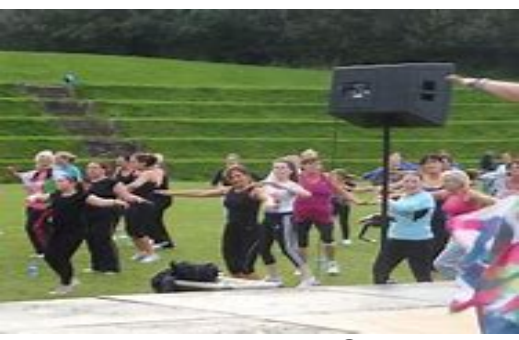
Zumba at Gasyard