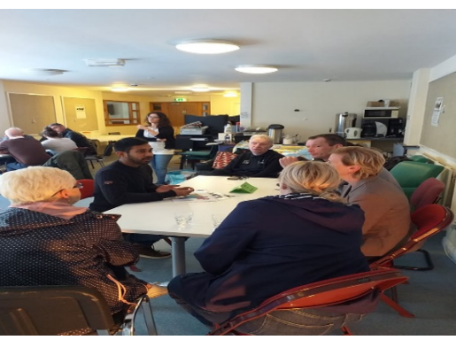
Workshop at CPTT