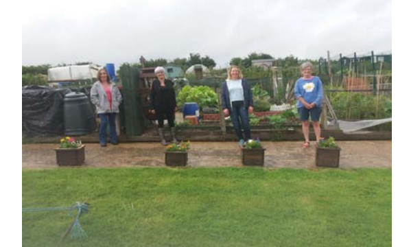
Residents get their Flower Boxes