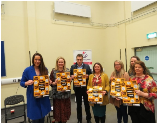
Local Councillors at Advocacy Campaign Launch