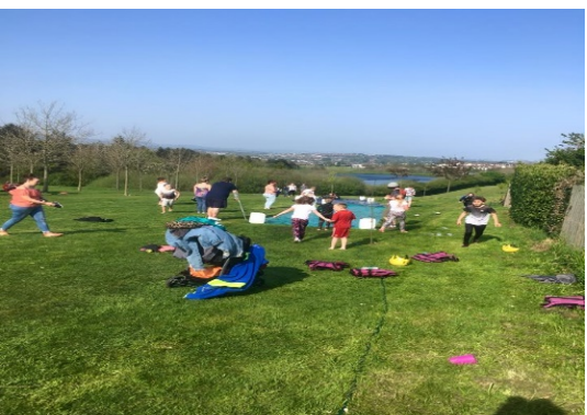
Family fun day at Creggan Country Park