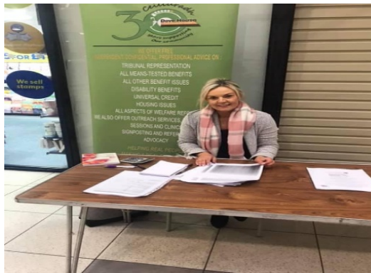
Staff at Advice Information Session