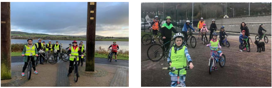
Youth Cycle out the line