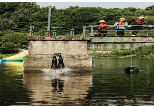
Young people getting ready for Pier Jump