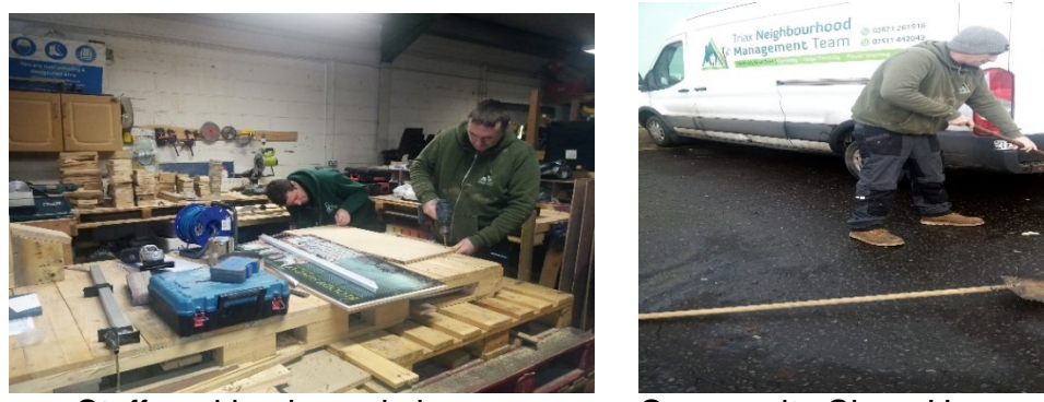
Staff working in workshop