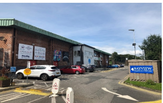
Completion of Medical Centre at Rath Mor