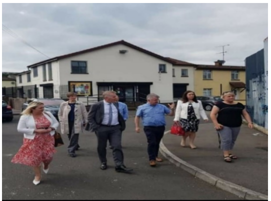
Head of Civil Service meets Creggan Community Forum