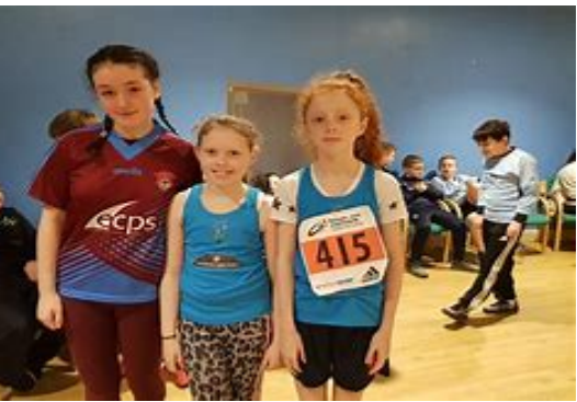
G.P. Exercise Referral Programme