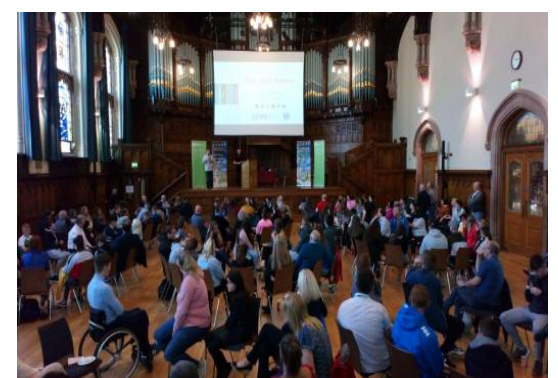
Conference facilitated by Youth Engagement Project