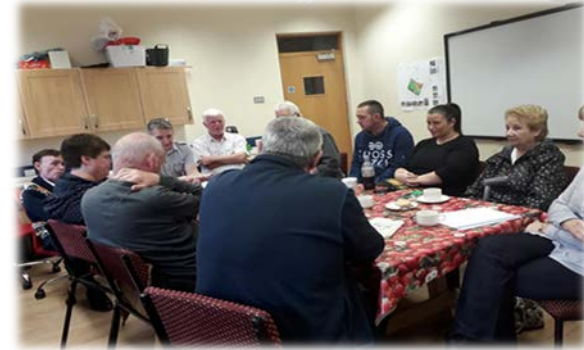
Peace Building Workshops