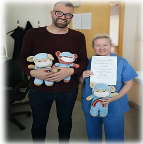
Providing Trauma Bears to PSNI to support children in trauma