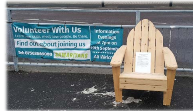
Suicide Awareness Day