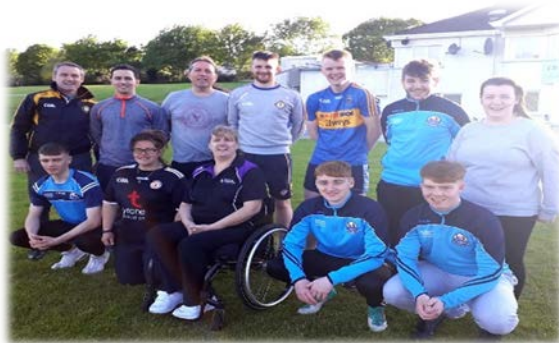
Foundation Coaching Course