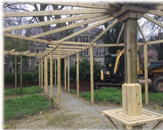
The Walled Garden and Allotments