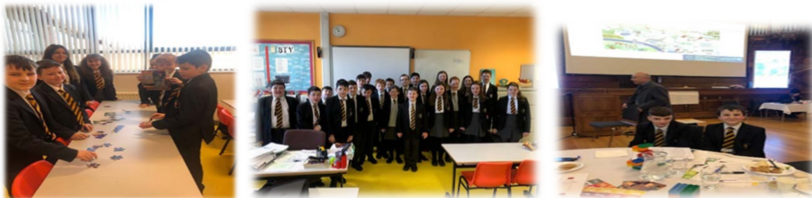
Friendship group meet weekly to develop team building, communication, friendship making and social skills

The project also delivered an 'Intergenerational Programme' where 15 year 9 students worked alongside 6 skilled mature ladies from Strabane District Caring Services to learn the skill of knitting to make hand muffs to be donated to The Alzheimer's Society.