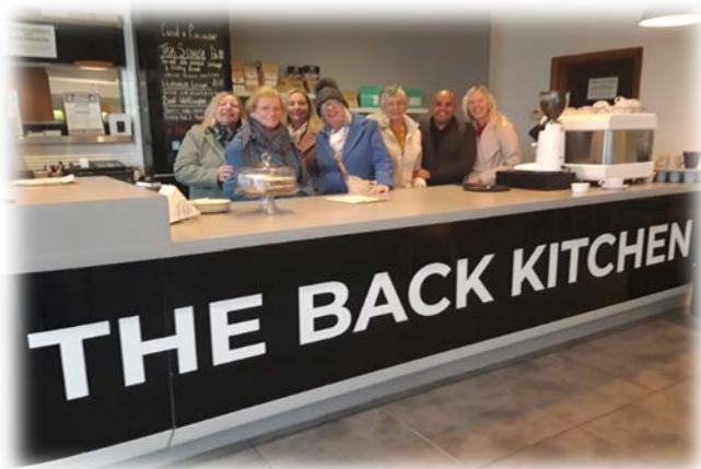
Education Trip to Liverpool