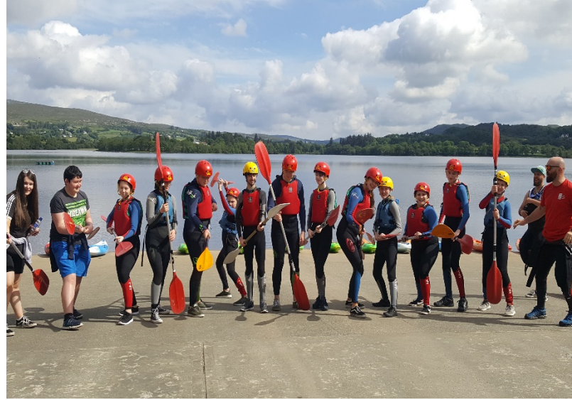
Team building exercise in Gartan