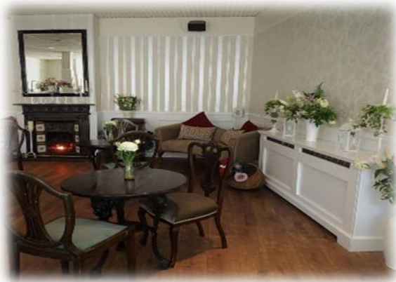
The Parlour vintage tea rooms