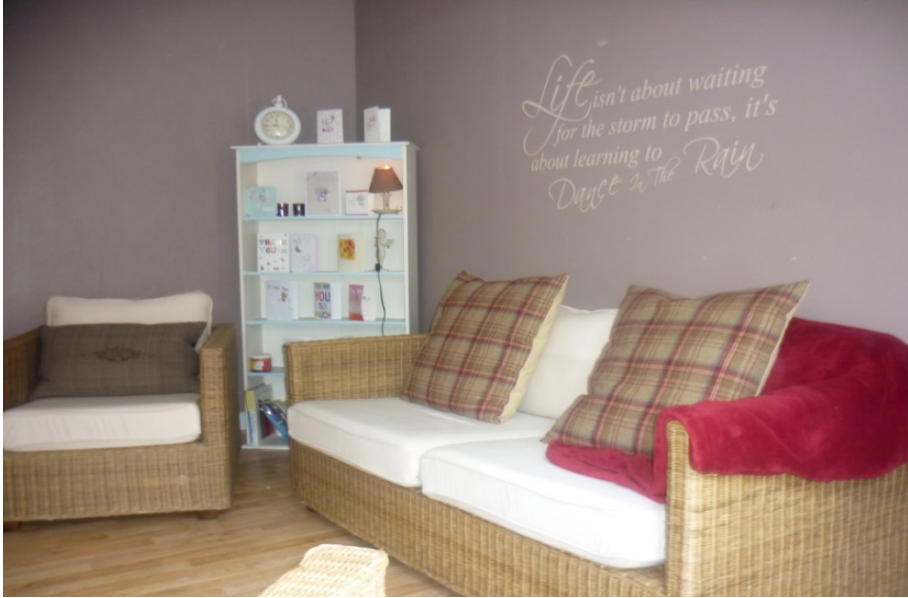
Counselling room at The Koram Centre