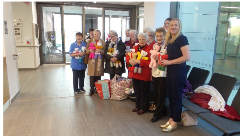
Stay Young Group that was funded through the NHIP programme