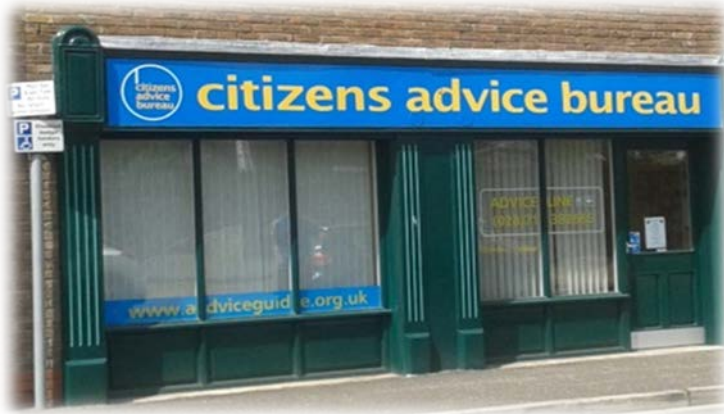
CAB Office, Strabane