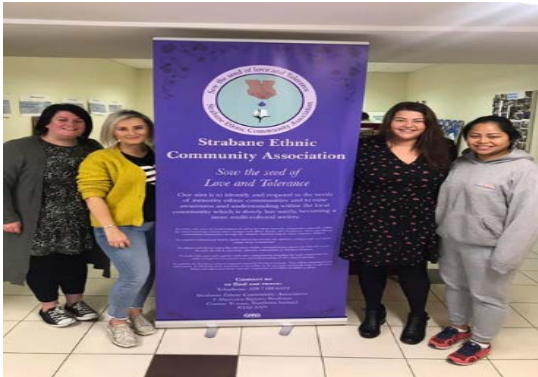
English Language Programme