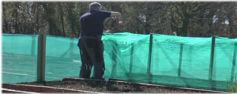
The Koram Centre's allotment site at Tulacorr