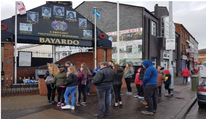
Visit to Shankill Road