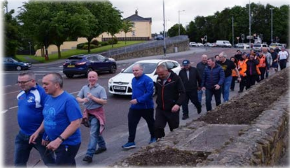
Banter around the Bridges