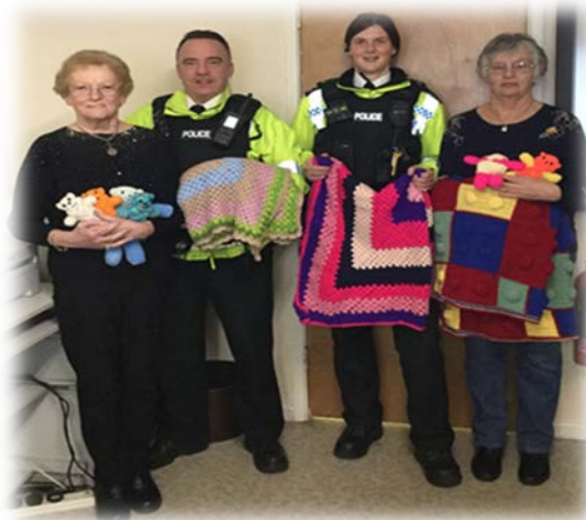
Presentation of blankets for rental unit at Altnagelvin Hospital