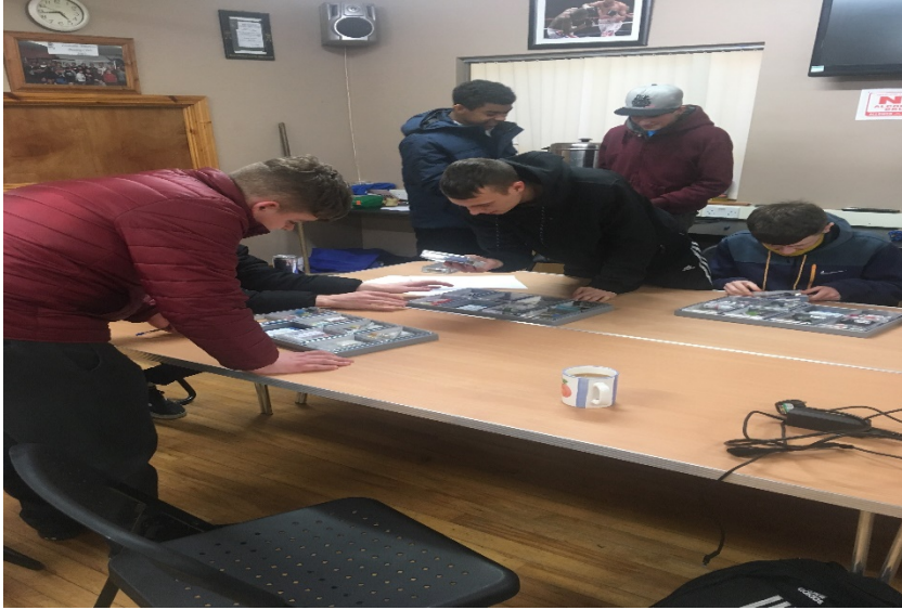
Participants attending drug & alcohol information event