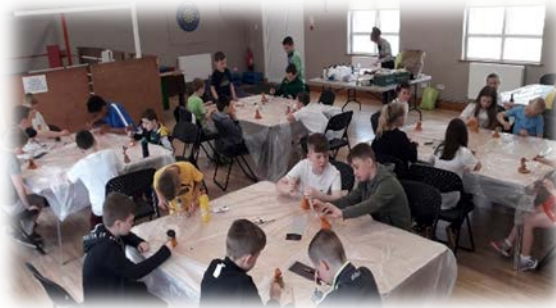
Arts and Crafts Classes