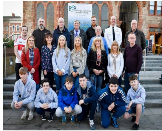
CRJ educational activities in the Outer West Neighbourhood Renewal area