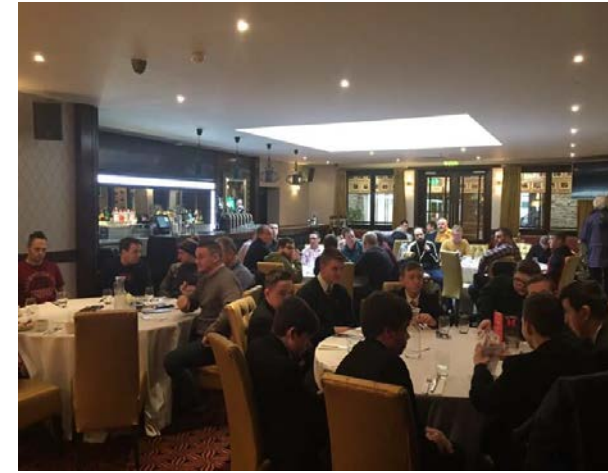
Glen Development Initiative Community Centre Activities