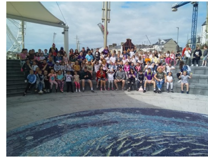
Youth activities operational in the Outer West Neighbourhood Renewal area.