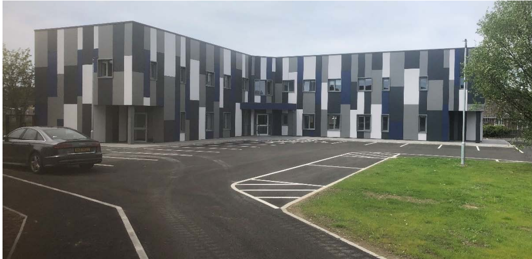
Complete Community Centre build