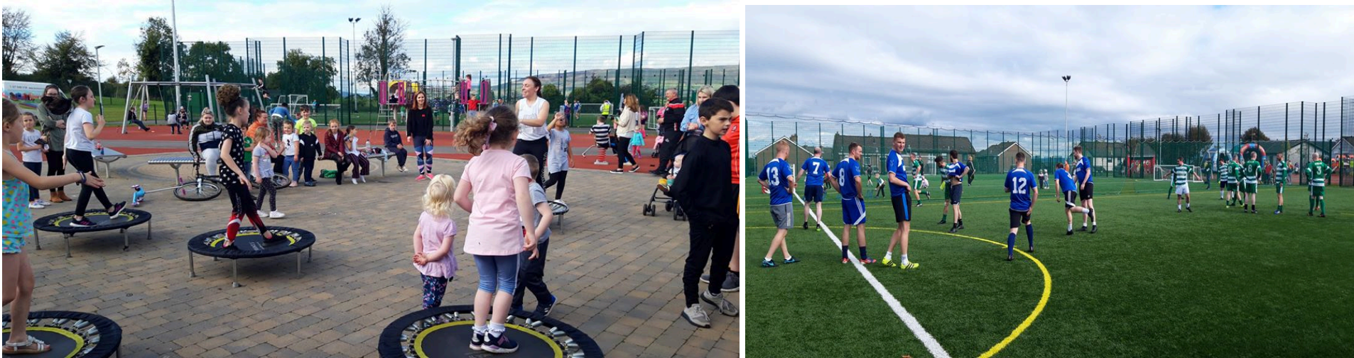
The NHIP Manage Programmes in the Outer West Neighbourhood Renewal area.

service provision and tailor service delivery to meet need. The project has assisted in addressing actions within the Neighbourhood Action Plan under Community Renewal, Social Renewal and Physical Renewal.