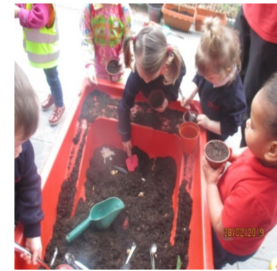
Dunluce Family Centre child centred activities at The Outer West Family Hub