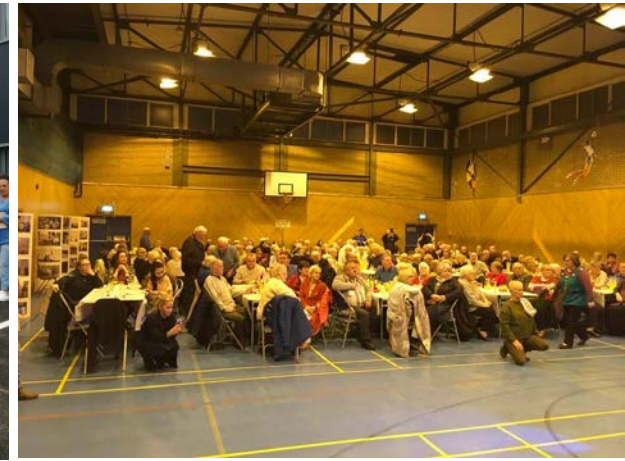
Rosemount Resource Centre Activities