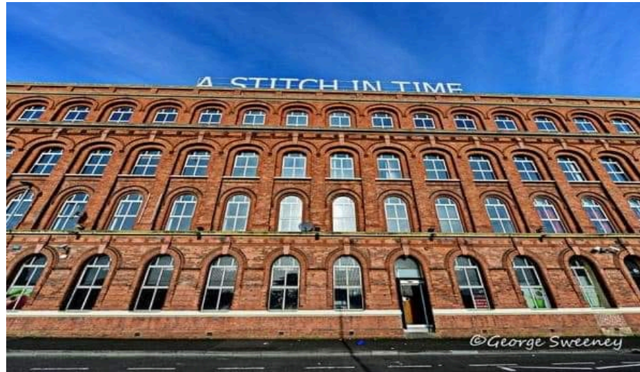
Outer West Neighbourhood Renewal Partnership Office, Rosemount Factory