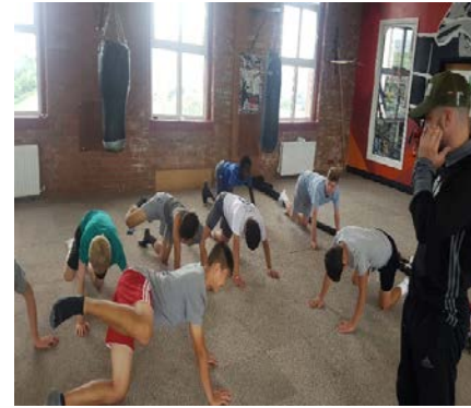
The Fitness Factory celebrity and corporate health and exercise activities at the community gym