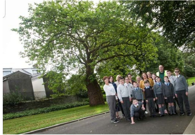
The Derry City and Strabane District Council community wardens' schools programme in the Outer West Neighbourhood Renewal area.