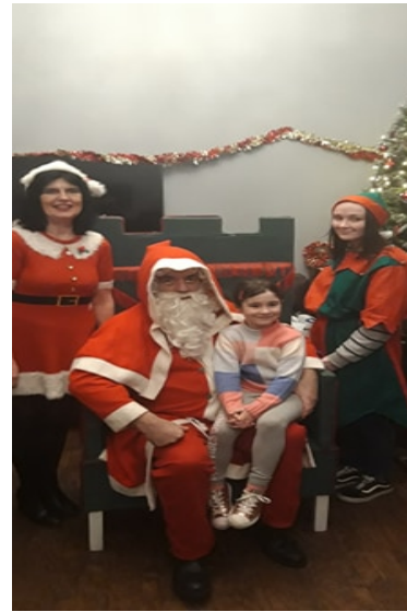
Community Library Activities at Little Hands SureStart in Outer West