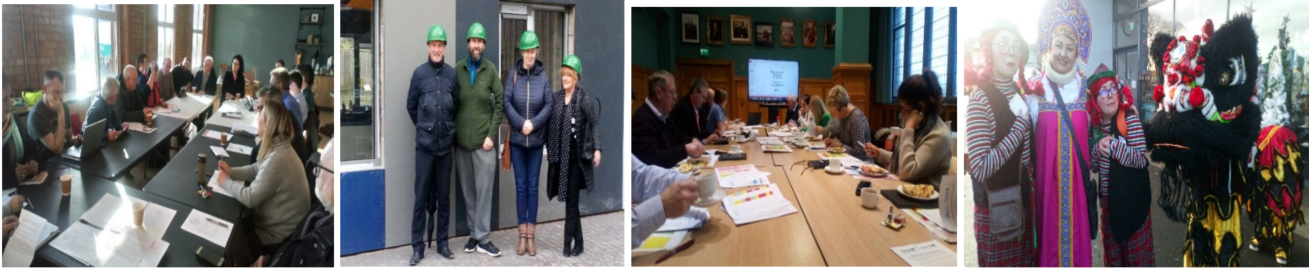
Outer West Neighbourhood Renewal Partnership Technical Assistance activities in the area