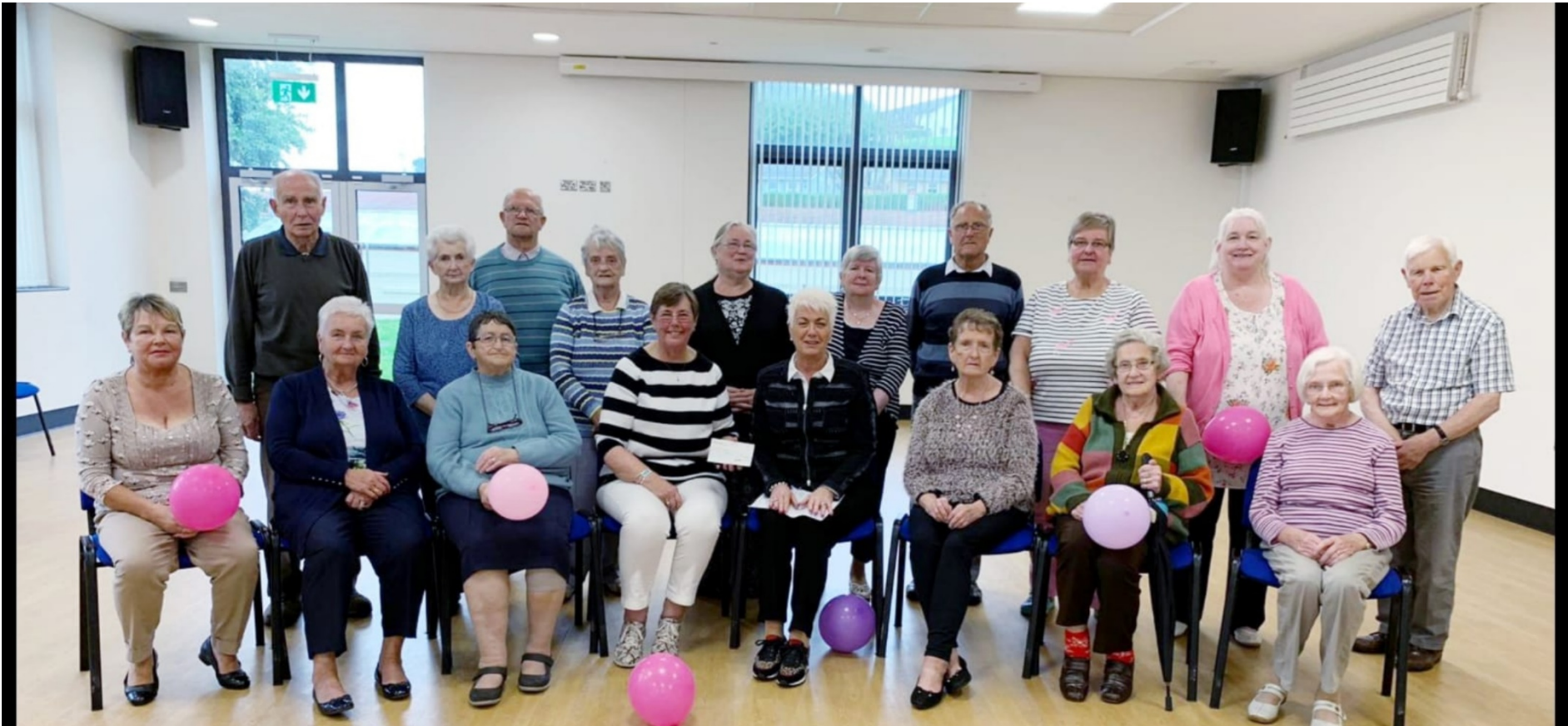
Members of the West End Community Centre Teapots