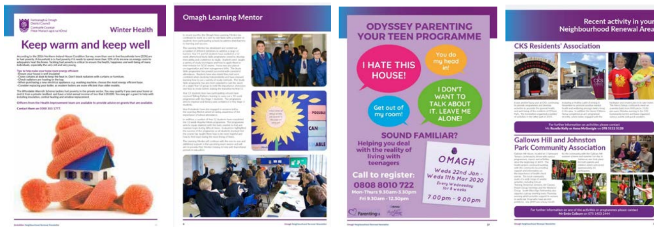
Some excerpts from the Enniskillen and Omagh Neighbourhood Renewal Winter newsletter 2020