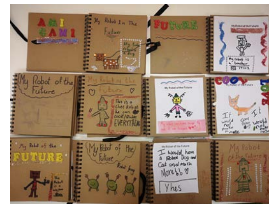
I'M HAPPY working with the community