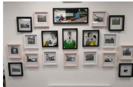
Memory Wall created by the Millburn Community in Calf Lane Cafe