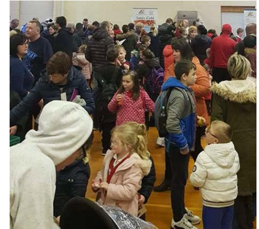
Sally's Cafe - Community event