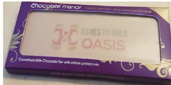
Ashes to Gold - Craft day