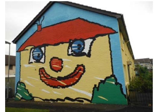
Focus on Family