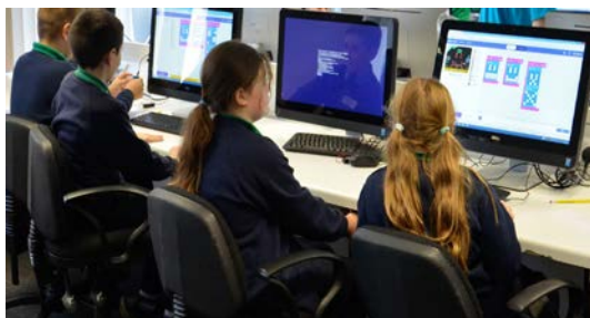
I'M HAPPY - Working with schools

This project aims to raise the aspirations of residents in the NRAs through computer-based activities such as app development and website development. The Ulster University works in partnership with Ballysally Youth and Community Centre, West Bann Development, Millburn Community Association, North Coast Integrated College, St Joseph's College, St John's and Killowen in the West of Coleraine and Millburn and Ballysally in East Coleraine. The achievements of participants are formally recognised through University module accreditation and there is further training available for people who wish to be COACHES.