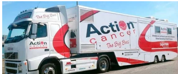
Sally's Cafe - Health Fair