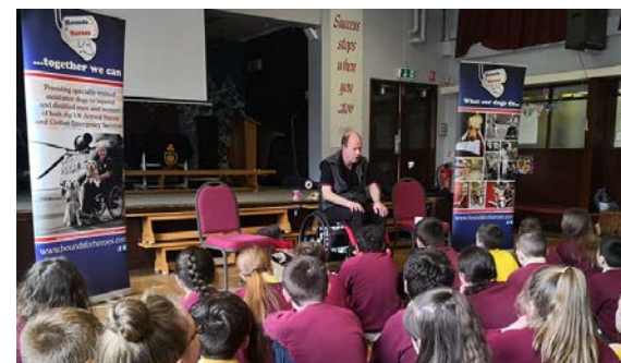
Millburn Community Association - with Millburn P.S. P7's