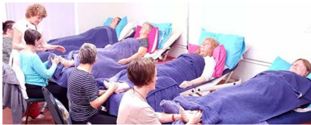
Focus on Family - Holistic Therapy