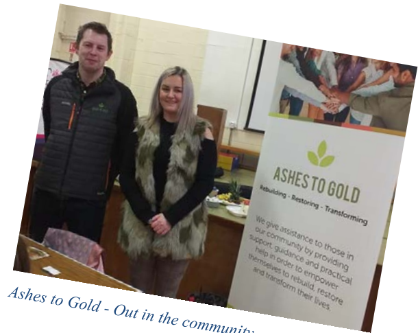
Ashes to Gold - Out in the community