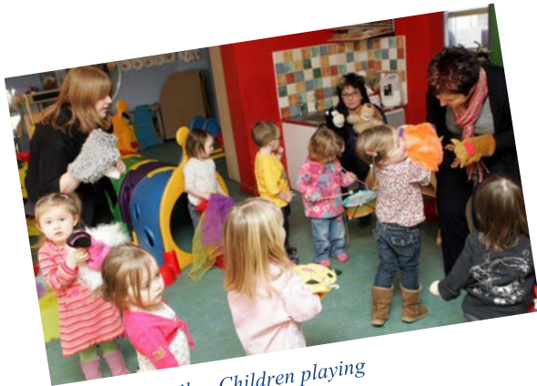
Focus on Family - Children playing

This project aims to deliver a wide range of skills-based and accredited training, careers, development, health and wellbeing programmes and collaborative events for the Ballysally and Millburn areas.