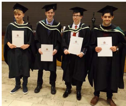
Graduating with I'M HAPPY