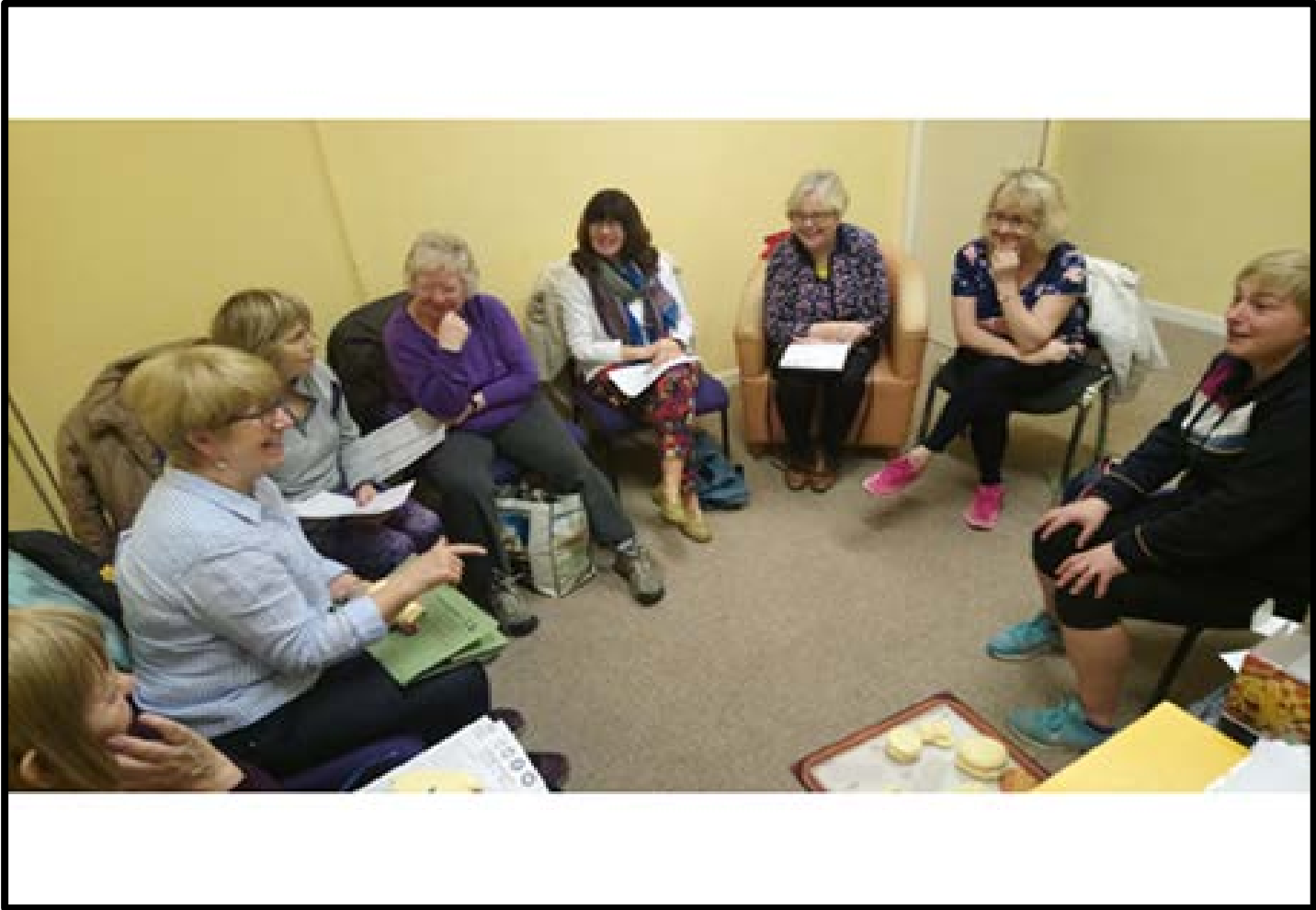
Photo of the New Pain Support Groups which launched in Oct 2018. Working in partnership with Verve Network Members and the Healthy Living Strategic Alliance two new groups were set up in NR areas in Portadown (ABC Community Network) and (The Fitzzone Foundation) Craigavon