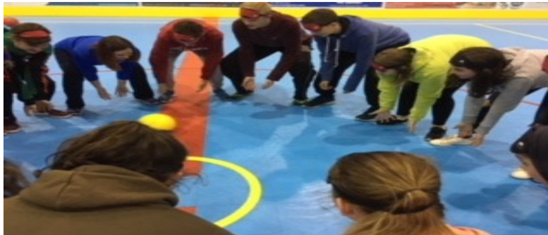
Participants at the DV8 Disability Qualification Event