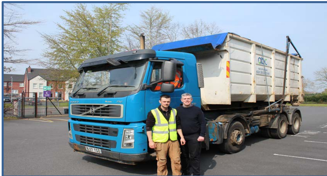
CAT C student after securing a job