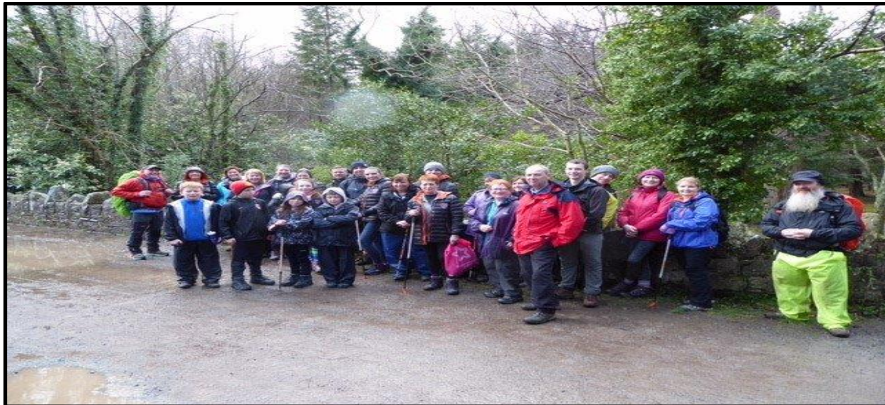
Craigavon Building Sustainable Communities: Craigavon Walking Group

2. Craigavon Building Sustainable Communities 18/19 - is divided into separate programmes - the Bushcraft Participation Programme provides residents with an opportunity to take part in a unique outdoor residential experience. Each course consists of a team building session, a 2 day residential camp and a follow up development session. The second element, the Marine Ranger Training Programme, targets residents aged 18 years and above who are currently long term unemployed. The programme combines periods of training and assessment with valuable work based placement within ACB&CBC. The aim is to encourage the trainees to respect their local environment, highlight the opportunities on their door step and to create a positive outlook on local life styles.