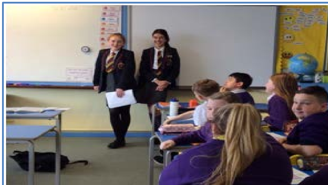
Two Brownlow College students with primary 7 pupils participating in some practical activities during their Transitions - Moving Forward programme.