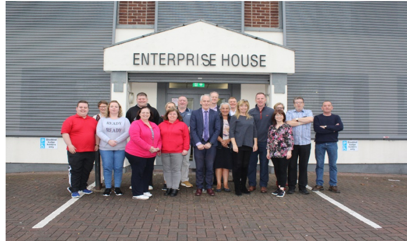
Members of Newry Neighbourhood Partnership Board

The Newry Neighbourhood Partnership was established in 2003 to take forward the Neighbourhood Renewal Programme. It comprises 18 members from the community/voluntary, private and statutory sectors. It is defined as a non-constituted entity acting in an advisory role to the Department for Neighbourhood Renewal issues in the designated Neighbourhood Renewal area. It currently meets on a bi-monthly basis with sub groups meeting monthly (and its administration services are provided through a Co-ordinator with Newry, Mourne & Down District Council).