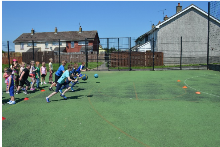
Basketball at Carnagat

In total 1,685 children, young people, adults and community leaders have participated in the programme to date. These programmes include – 8 residential, 3 intercommunity events, 2 basic level training programmes, and a range of outdoor and leisure activities. To support these activities 154 volunteers are required of which 69 are Community Association volunteers, 27 from User groups, and 58 parents. Over the entire programme this has generated approximately 1200 hours of voluntary work.