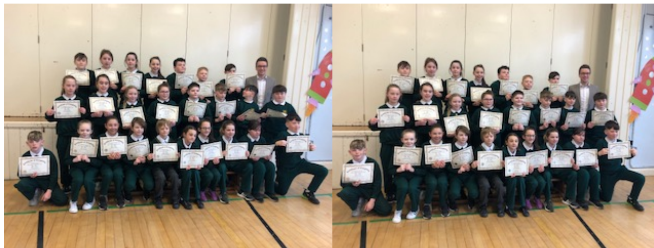
Primary 7 pupils in St Patrick's Primary with their Fixing Things Certificates.