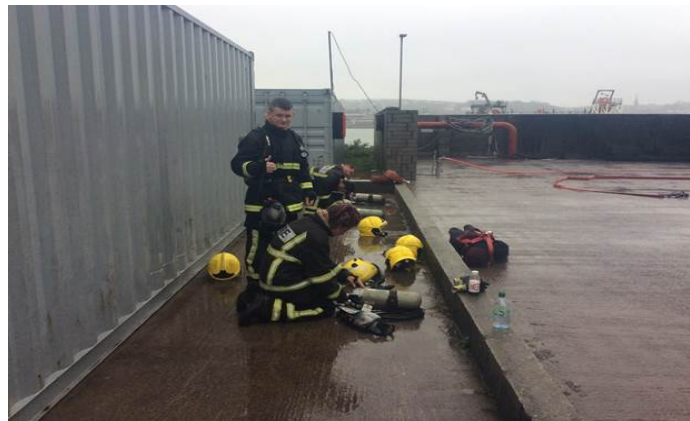
Residents participating in OCEANS Training

The Oceans Offshore (BOSIET) Training programme which commenced in 2013 and launched in May 2014 in Newry West campus has proved to be a success. The levels of investment in offshore oil and gas industry remains high with over £14.4 billion invested last year. In addition, Northern Ireland will see significant investments in its offshore wind farms in the coming years. The Oceans BOSIET programme, which has been funded by DfC NR funding, is designed to provide specialist skills to those residents living within the Neighbourhood Renewal Areas in the Southern Region to better equip them to seek and secure employment in offshore environments. Residents will be trained in the requisite safety and emergency response procedures such as firefighting, first aid, helicopter safety and escape, safety induction and sea survival with the added dimension of MIST (Minimum Industry Safety training) training available, training at heights (safety when working on high platforms) and on completion of the programme residents will be fully ready for employment in the offshore industry.