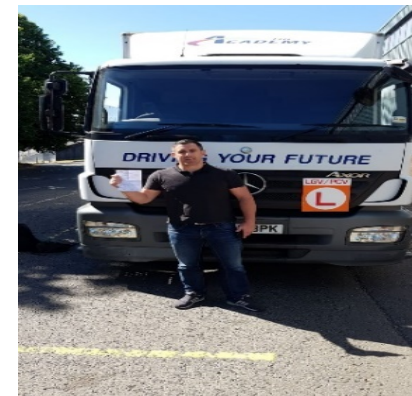
On the right a Newry NRA resident who successfully passed their HGV lorry Licence