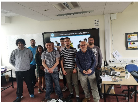
On the left a number of Newry NRA residents who successfully achieved their SIA Door Security Licences