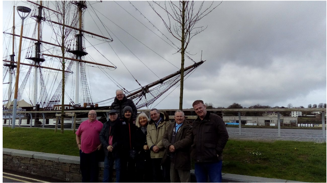
Men's History Group in Wexford