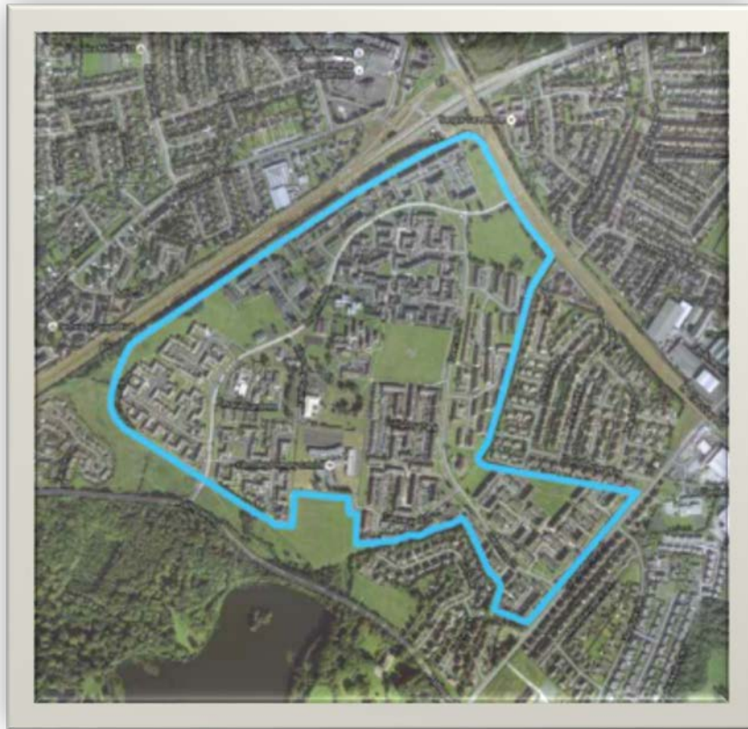
Figure 1: Kilcooley and Fern Grove Estate

Bangor Neighbourhood Renewal Area (NRA) covers the whole of the Kilcooley and Fern Grove estate (shown in Figure 1). Kilcooley estate is the third largest estate in Northern Ireland with a population of 2,767 based on NISRA figures (2017). 79% of residents identified themselves as having a Protestant or Christian faith background and approximately 4% of respondents identified themselves as having Catholic faith background.