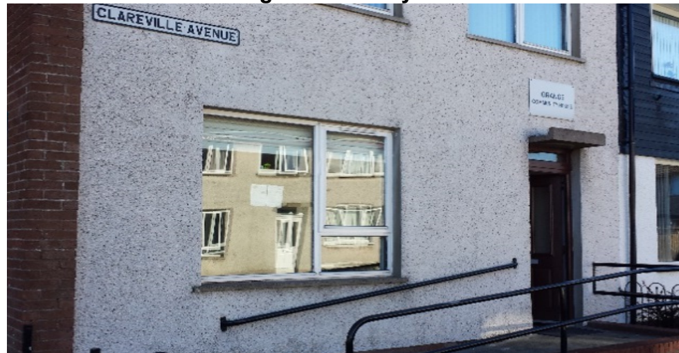
Grange Community House

The Grange Community House continues to be widely used for a variety of activities for all ages.