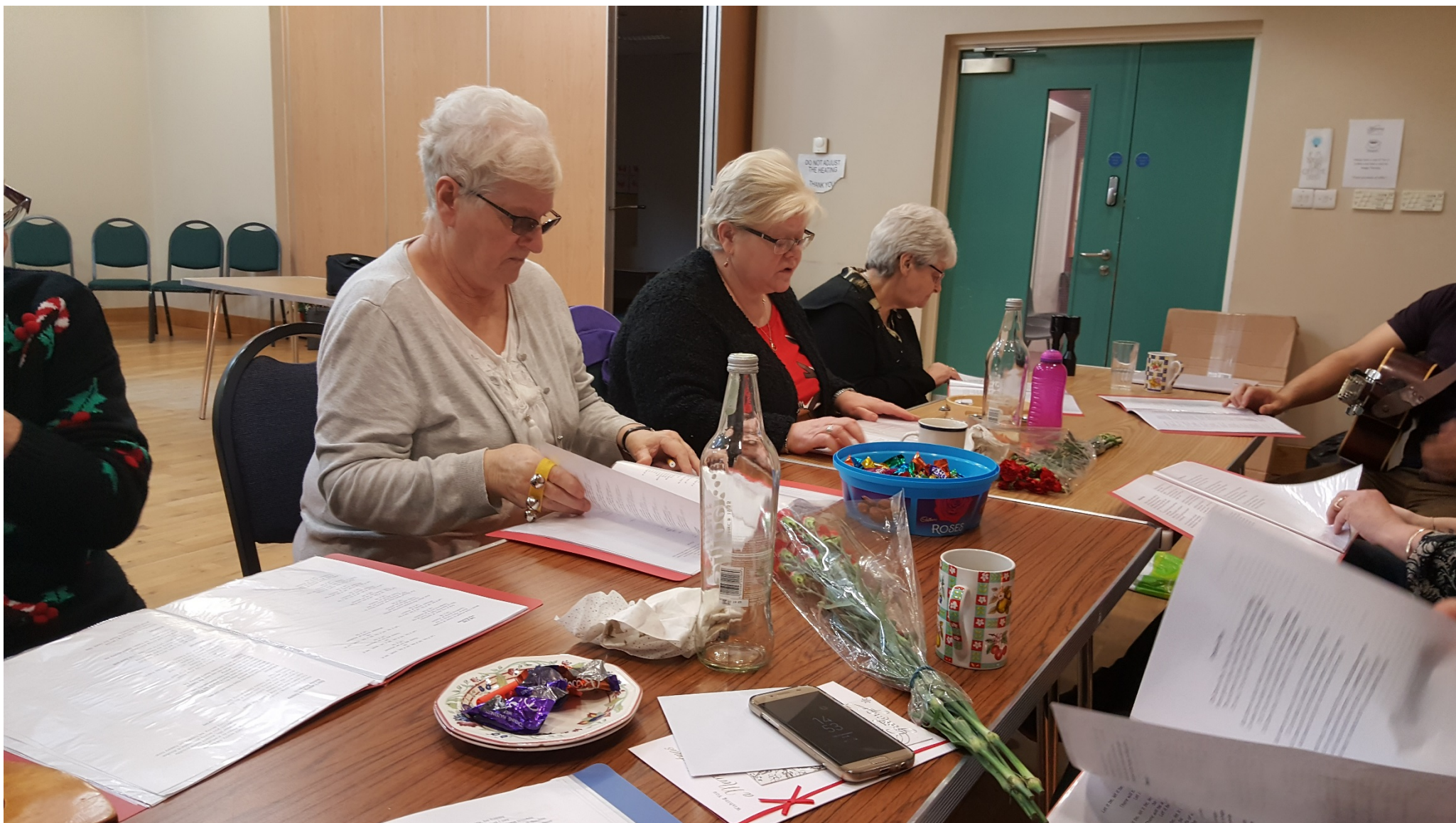
Grange Women's Group in action

Community Network's Public Health Authority funded Mental & Emotional Well-Being & Suicide Prevention grants which covered the areas of relaxation, creativity, stress reduction, gratitude and even some laughter yoga sessions.