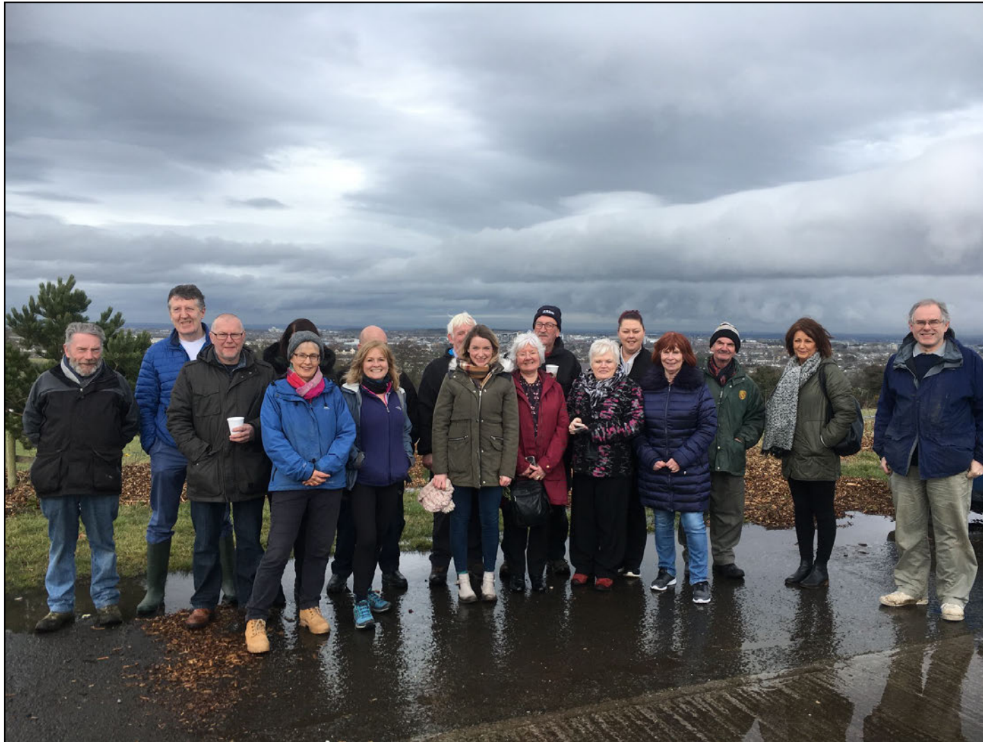
Members of the GROW project visiting community allotment projects in Friarstown, South Dublin