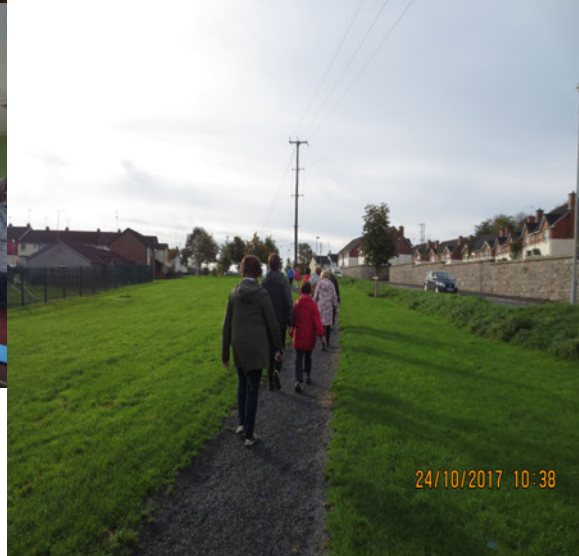
Residents from the Armagh NRA participating in a range of activities as part of the Growing Communities programme, including jiving classes, history talks, family fun-days and the Seven Hills walking challenge