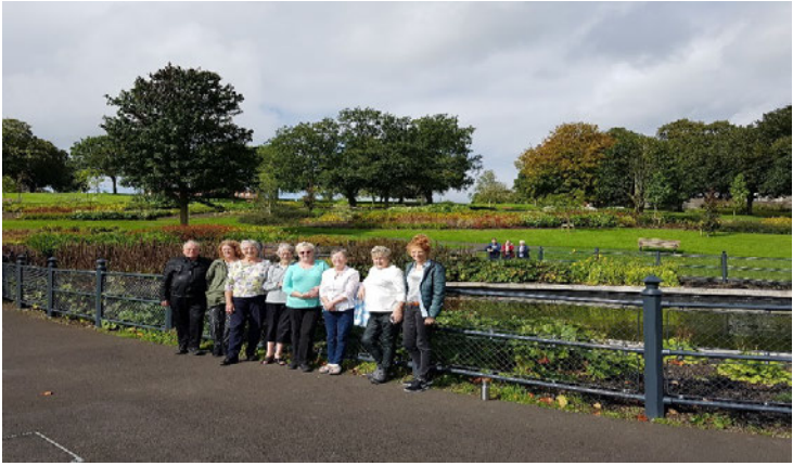
Older People's Walking Group