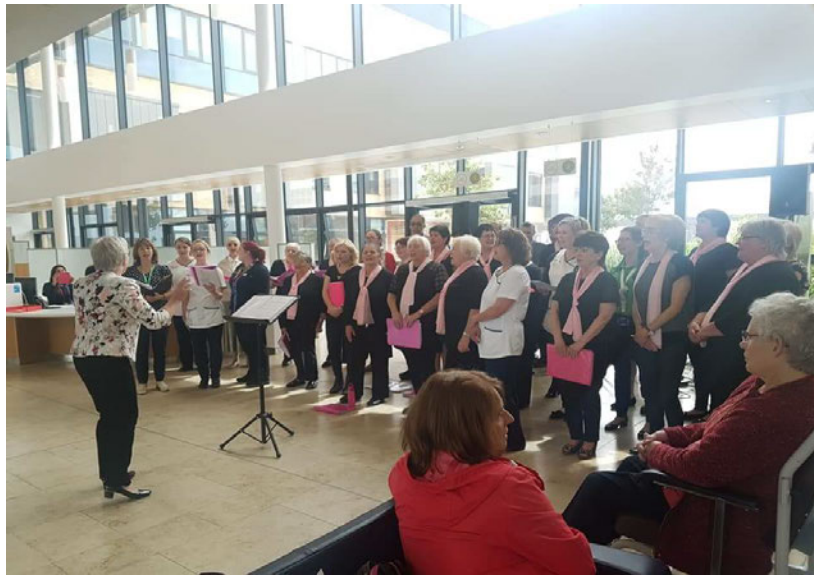
Pink Ladies & North West Centre Choir (Celebrating Life)

This project focused on delivering counselling, complimentary therapies, listening ear services, individual and group support, preventative workshops with Reduce your Risk, health promotion and education stalls and cancer awareness talks. Our services were delivered in a number of Community settings in the Waterside including Irish Street Community Centre, Clooney Community Centre, North West Cancer Centre, Waterside Neighbourhood Partnership and at Caw Nelson Drive Community Group.