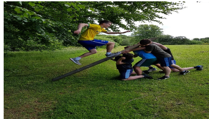
Men's Mud Challenge