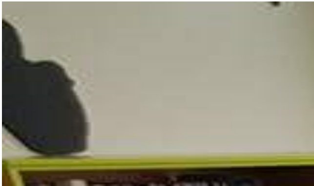
Clooney P7 Transition Programme

This City-Wide project targets areas with no statutory youth provision. In the Waterside the project tackled issues of youth need through an area based youth intervention programme in Irish Street, Clooney, Top of the Hill and outreach from Top of the Hill.