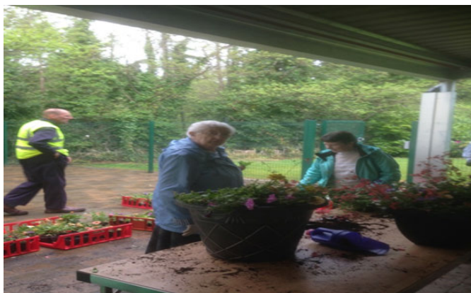
Window Boxes Project

This project is the result of collaborative working between The Department for Communities, Londonderry Inner City Trust, Waterside Neighbourhood Partnership, Derry City & Strabane District Council and through the facilitation of the Centre Management Steering Group which is also made up of community representation.