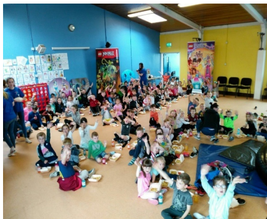
Younger Children Activity Day

During 2017-18 Hillcrest Trust has continued to expand the portfolio of services on offer to the residents of the Top of the Hill/Greater Waterside area. This involved delivery of a wide variety of programmes and events catering for all age-groups and ranged from Parenting Programmes and Children's events to Older People's groups as well as a wide variety of adult education programmes.