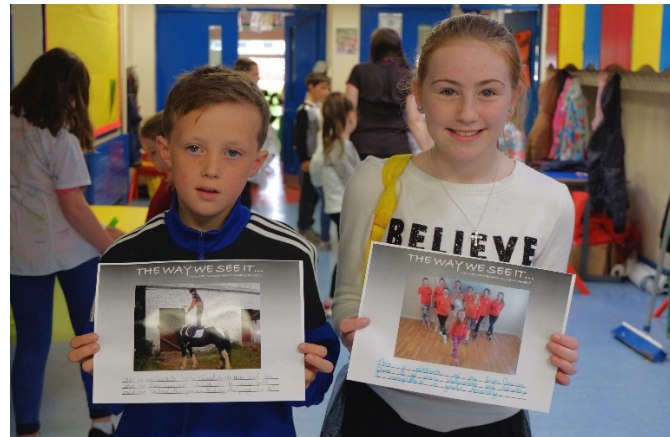
Sacred Heart PS and Ebrington PS Junior Warden Prize Winners