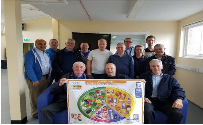
Men's Healthy Breakfast