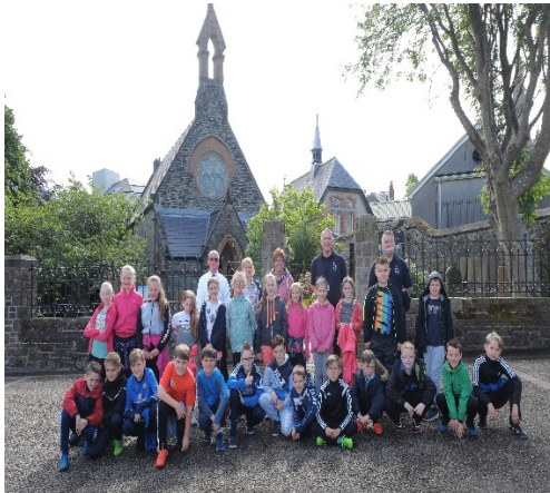
Ebrington PS Junior Wardens Tour

This project provided constructive activities for local young people that benefit the community, whilst encouraging a sense of civic responsibility and pride, building community capacity, promoting partnership/collaborative working and good community relations, developing leadership's skills and providing opportunities for intergeneration interaction whilst at the same time it encourages the young people to avoid Anti-Social Behaviour. Pupils from Sacred Heart & Ebrington Primary Schools took part in the NIHE Junior Wardens Scheme, with 120 pupils participating in Neighbourhood Clean Up, ASB Talks & Poster Competitions, The Way We See It Photography Project and Shared History City Tours.