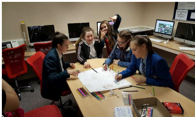
Working together at Top of the Hill