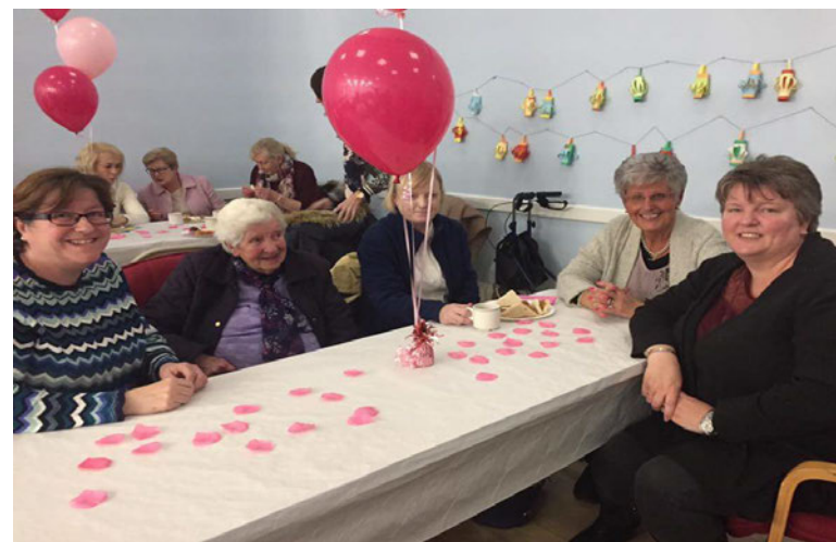
Cancer Awareness Information Session