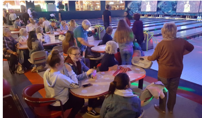
Playing together at Top of the Hill's bowls trip