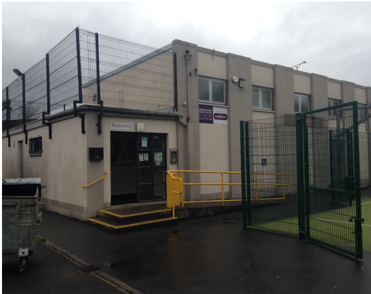
(Current facility at Lincoln Courts)