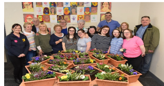
Gardening project with Foyle Down Syndrome Trust

The highlights over the past year were the intergenerational horticultural workshops between Caw, Foyle Downs Syndrome Trust, Ebrington Primary School and Oakgrove Integrated Primary School. Our amazing Santa's Grotto which almost 100 children visited and the Dementia Virtual Tour Bus which was funded by the Big Lottery Fund and seen over 60 local people avail of the training over the two days.