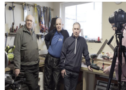
A range of Excite Programmes and Workshop