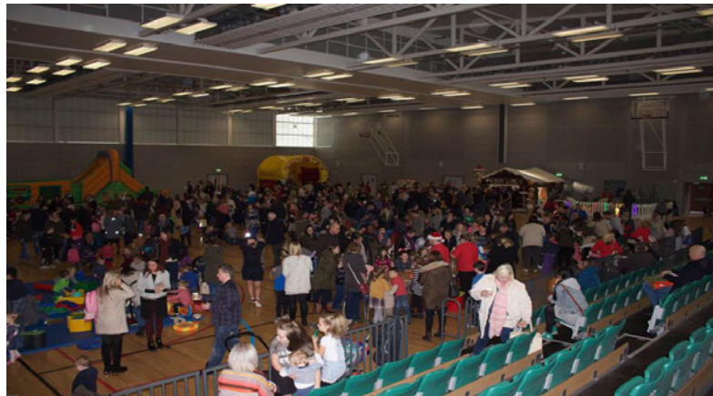
Christmas Cracker Event

This project played a key role and took the lead in managing the NR process and in implementing the Waterside Action Plan while also promoting the social, economic and physical renewal of the Partnership area through reducing inequalities in health, poverty in families, promoting mental health and emotional well-being. WNP manages the Excite, Talking To Our Babies, Skills 2020 and Neighbourhood Health Improvement Programme in the Waterside and facilitated the delivery of a number of Waterside wide activities including the Waterside Spring Festival. This year we were able to secure substantial funding from Peace IV of £500,000 to deliver a cross-community project on the Top of the Hill/Irish Street interface.