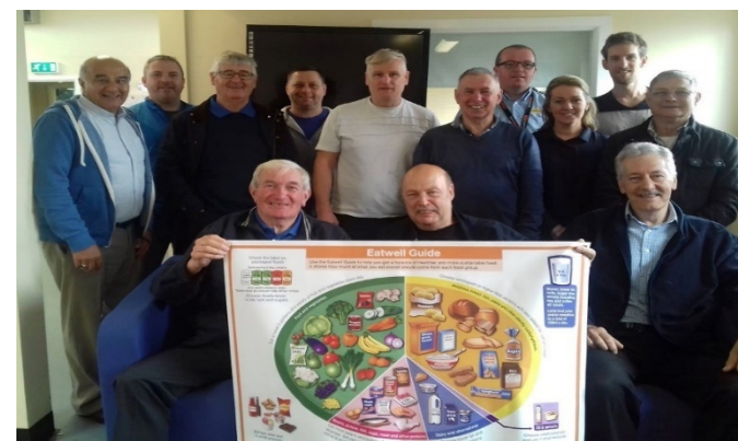
Mens Health Event

The Top of the Hill area is going through a time of transition with a number of exciting developments underway which will enhance the local area however our key priorities remain the delivery of the new multi-purpose Community Centre on the former Immaculate Conception College grounds and Waterside Shared Village which will further support the social and physical development of the Greater Top of the Hill area.