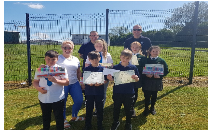
Wardens out and about in the Waterside