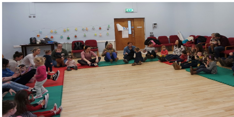
Toddler Dance Class

250 calendars with information on communication development and top tips for talking were created and distributed to 11 different early years' settings. TTOB Facebook page has over 1400 followers and is updated regularly.