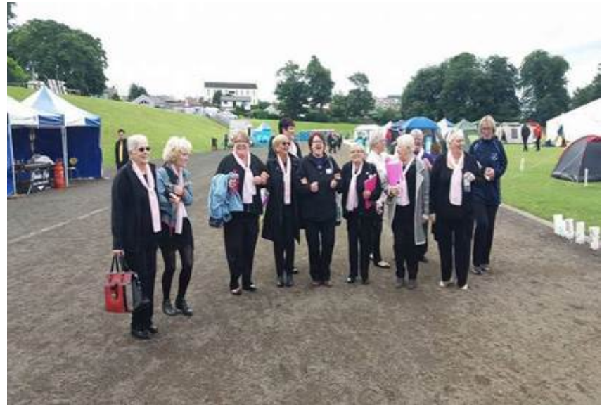
Laughter in the Park