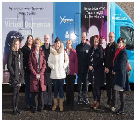
Visit from Virtual Dementia Tour Bus

Over the past year Caw/Nelson Drive Action Group has continued to provide programmes, activities and services to meet the needs of local residents of all age groups living in the Caw/Nelson Drive area. The project provides a range of programmes including parenting courses, womens group, senior citizens luncheon club, a variety of recreational and educational courses as well as health & wellbeing initiatives, increased opportunities to make people more employable, community safety and crime prevention initiatives, projects to address environmental issues and a range of outreach services including Citizen's Advice Bureau, Job Assist, British Lung Foundation's Breathe Easy Support Group, Pink Ladies and Action Cancer.