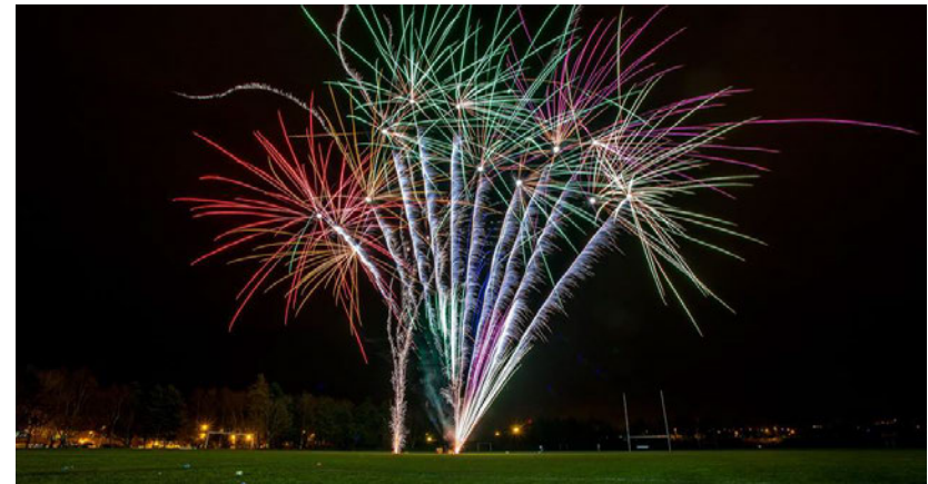
Fire Works at Launch of Waterside Shared Village Project