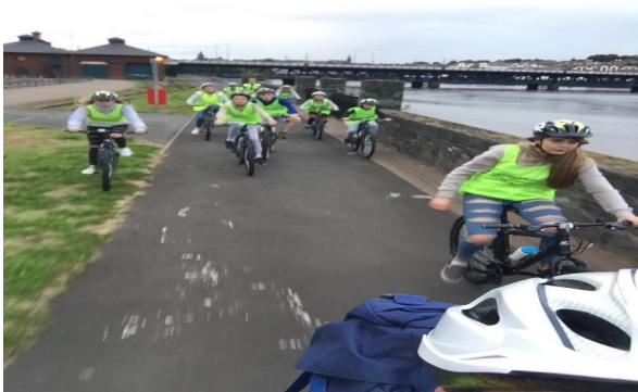
Youth Cycle Ride

Creggan Neighbourhood Partnership, Dove House Community Trust and Cathedral Youth Club are the three youth organisations in this area that deliver Youth Engagement Plus in partnership with the Education Authority. These organisations are central to the work of the Triax Youth Sub-group. The partnership work of these organisations alongside other youth and community providers is vital for the delivery of diversionary programmes over the summer at times of high tension.