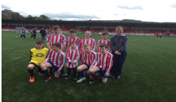
Cathedral Youth Club at the Brandywell

Over the past year many activities have been successfully carried out in Cathedral Youth Club owing to the support of Neighbourhood Renewal Funding. One initiative in particular is The Ryan McBride Memorial Football Tournament which took place in The Brandywell Football Stadium. Young people from all over the City took part which in itself brought young people together to play in a friendly competition, building confidence and developing friendships. The young people from the Fountain Estate now look forward to attending future football matches in The Brandywell Stadium seeing it as a shared space for everyone.