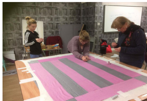
Women’s Support Programme