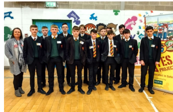
St Joseph's Boys Guides and Mentors