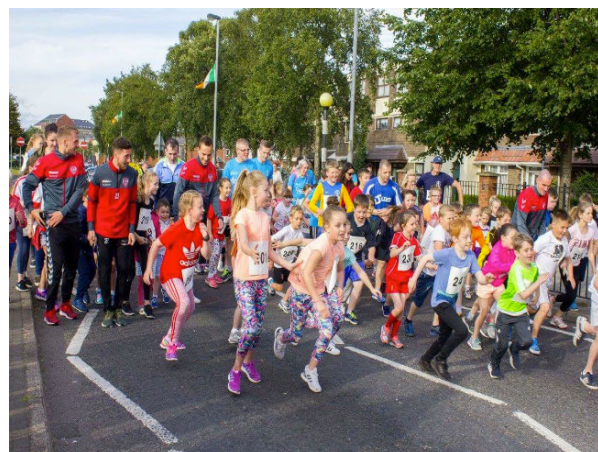
Jog in the Bog Childrens' Race