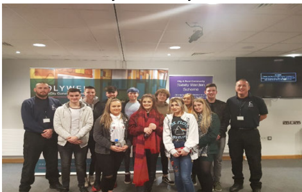
Community Safety Wardens Engaging with Young People

In the Triax area between April 2017 and March 2018 the wardens dealt with 204 address referrals, carried out almost 1,592 patrols in hotspot areas, attended 22 fortnightly Triax Community Safety Forum meetings and assessed homes for additional home security equipment. The Community Safety Wardens are on duty from 12noon to 5pm Monday to Wednesday and from 5.30pm to 3.00am Thursday to Sunday.