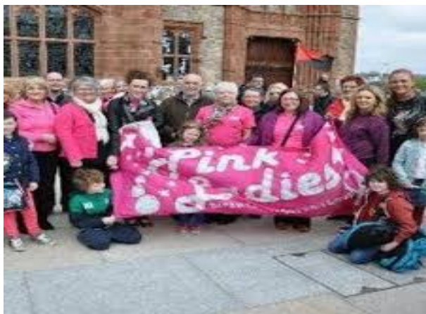
Pink Ladies at the Guildhall

The Pink Ladies Cancer Support Group have had a very successful year in 2017/18 alongside many campaigns, awareness raising events and individual work with those impacted by cancer. The Pink Ladies received a massive boost when they were funded by the Big Lottery Fund to expand their services and programmes across Derry and Limavady. Support includes weekend advice services for people who are undergoing treatment Monday to Friday, counselling, carers support activities, education programmes for schools, communities and workplaces and health & well-being activities.