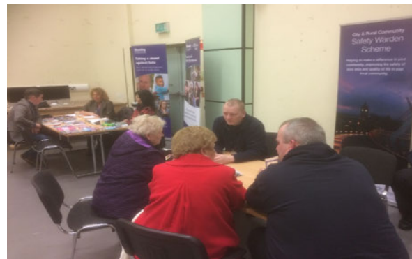
Listening to Residents' Concerns