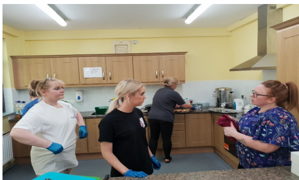
Volunteers at Work

During 2017/18 the Volunteer Investment Project provided volunteering opportunities to 110 volunteers with 7 securing full time employment and 40 volunteers received seasonal work as a direct result of receiving personal training and skills development. 48 Volunteers received non job specific training and 33 volunteers received job specific training - this enabled them to work within their community in roles involving Childcare, Administration, Stewarding, Youth Work, etc. VIP supplied trained volunteers for a number of civic events in the city including the Walled City Marathon, Halloween Haunted House, Spring Festival Carnival, Christmas Market and Feile.