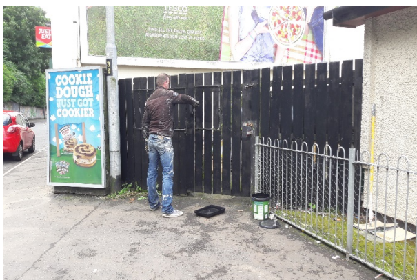
Community Clean Up

Operation Fresh Start/Tús Maith continues to provide support and assistance to residents across the area. Home assistance, painting, grass cutting and power-washing has again been complemented by the communal works, graffiti removal and educational campaigns that have characterised their work over the last 5 years. Operation Fresh Start/Tús Maith has worked in every part of this community and has engaged with thousands of residents and young people.