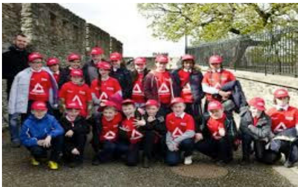
Junior Wardens on the Derry Walls

The NIHE Social Education Project has consistently worked across every primary school in the TRIAX area in partnership with the Triax Neighbourhood Management Team and have successfully delivered the Tús Maith Schools Project. The project involved over 1,600 pupils in a range of discussions on topics such as Turning Triax Green, How Do I Like Where I Live-this programme culminated in an area wide poster competition. The Project also ran a Junior Warden environmental programme which included litter picks and community clean ups.