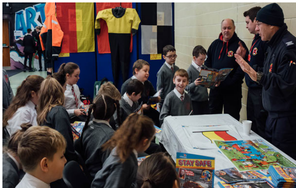
Young People taking part in YES Workshop

The Triax element of the programme was delivered in the Longtower Youth Club over two days. Year 6 pupils from the ten primary schools within or adjacent to the Triax NRA participated in the programme. A total of 335 primary schools pupils thoroughly enjoyed and learned a lot from the programme. A further 18 Year 11 and Year 13 students from St Joseph's Boys took part in the programme as mentors and guides for the younger pupils.