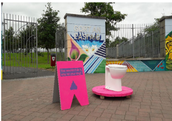
Dog Fouling Awareness Campaign

TNMT continues to lead the way in developing community and social economy initiatives in the area. Operation Fresh Start/Tús Maith, the Ballymagowan Allotments, Turning Triax Green, the Bogside Residents Parking Scheme and various interface projects have and will continue to make a difference to the lives of local people. TNMT are central to ensuring that residents are engaged and informed of local developments and initiatives. TNMT have also been raising awareness of many community issues such as dog fouling, fireworks and littering.