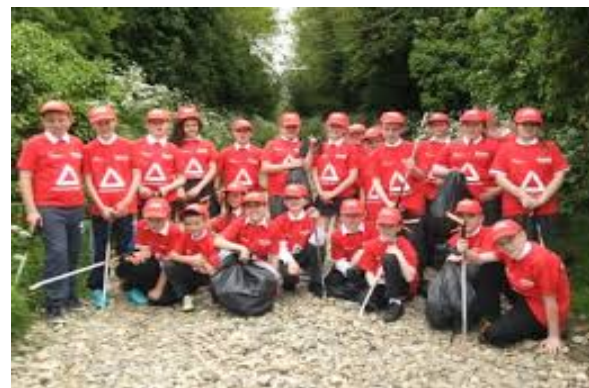
Junior Wardens at a Litter Pick