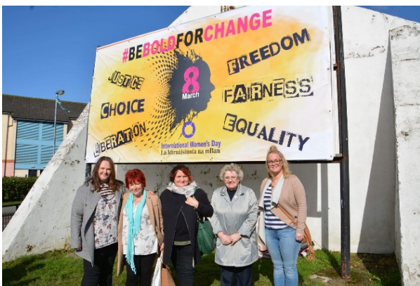
International Women's Day at Free Derry Corner

During 2017/18 the Women's Advocacy Project provided meaningful interventions to 140+ new local women as well as returning service users from previous years. Interventions have included creative support groups, various one to one sessions and signposting on to specialist services. The project has also carried out successful Domestic Abuse awareness campaigns over the Summer, Autumn and Christmas periods. Through continued attendance at community fairs, local shopping centers and summer events the Women's Advocacy continues to be well rooted throughout the community and is a first point of contact for many victims of Domestic Abuse.