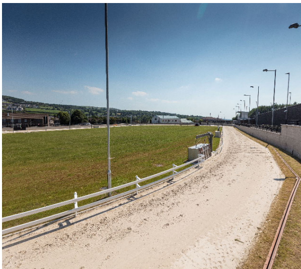
Brandywell Greyhound Track

The Lone Moor Road upgrade of the footway and carriageway between Letterkenny Road and Brandywell Road was widely welcomed by the local community as this stretch of road had been in a bad state of disrepair due to the laying of various pipes and cables in recent years. This project has also enhanced the wider £9m redevelopment at the Brandywell Stadium, Greyhound Track and Play Park. The Neighbourhood Renewal funding for this project was £198,000.00.