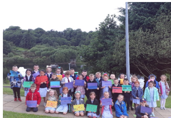
Presentation of Certificates at Creggan Country Park