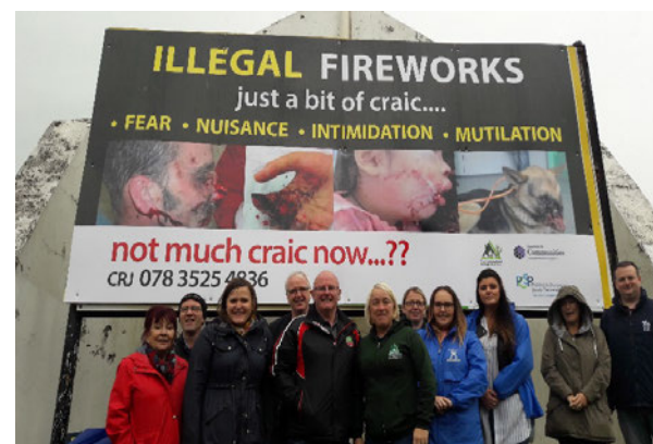
Illegal Fireworks Campaign at Free Derry Corner