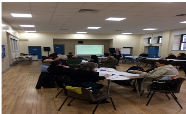
Welfare Information Session

Dove House has a number of projects located at three sites across the Triax area. Dove House projects contribute to the well-being of local residents, including women, older people, people on low incomes or benefits or currently unemployed. These projects promote self-sufficiency, resident engagement and community participation. 2017/18 was a very successful year with over 6,000 resident engagements across all projects with many residents coming through the door to access advice on a range of welfare, housing and employment issues.