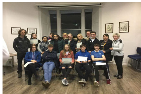
Young People Receiving P&SD Certificates