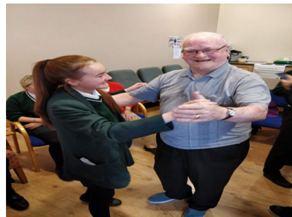
Young and Old Enjoy The Craic