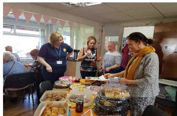
Charity Coffee Morning at CPTT