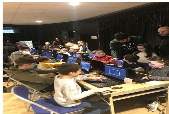
Young People at Digital Coding Session