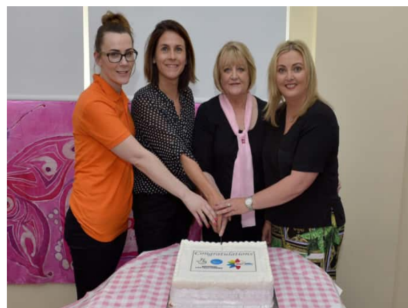
Pink Ladies Celebrate Big Lottery Funding