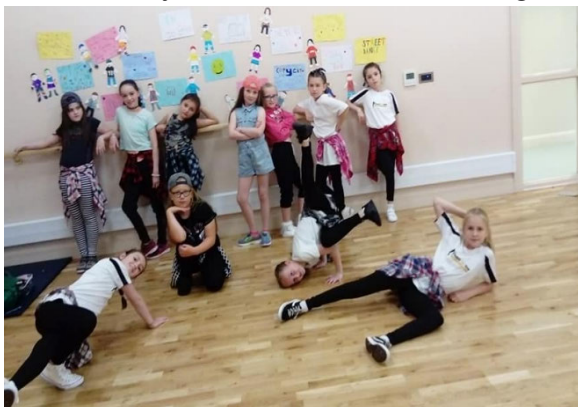
Dance Class at the Gasyard

GDT provided a wide range of services and activities with 110k people in attendance throughout 2017/18. With over 70 weekly programmes there is something for everyone to enjoy in arts, wellbeing, community safety, volunteering, training and social gatherings among others. Highlights this year included the development of a dance programme that works with 100+ children each week, teaching them various forms of dance including accredited Street Dance and Hip Hop Classes. This year they focused on accessibility with the centre receiving recognition as an Autism Friendly and Dementia Awareness Environment.