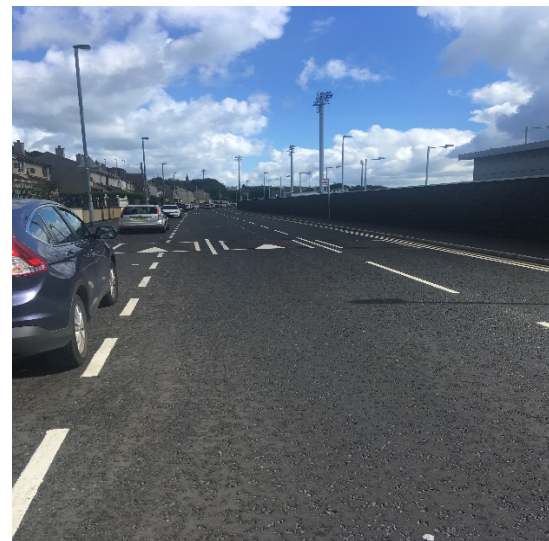
Lone Moor Road