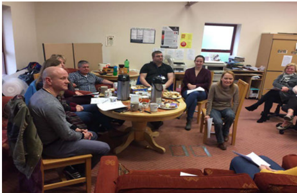
Welfare Information Session

Due to the implementation of the Welfare Reform Dove House has been engaged in an intensive information programme informing residents of the impacts on their daily lives and benefits. Staff at Dove House deal with a wide range of issues on a daily basis including benefit advice, Appeals, Housing, Employment and completed DLA/PIP/Attendance Allowance Forms. Dove House Advice Services received a Gold Recognition from Derry City and Strabane District Council for the standard of their work in 2017/18.