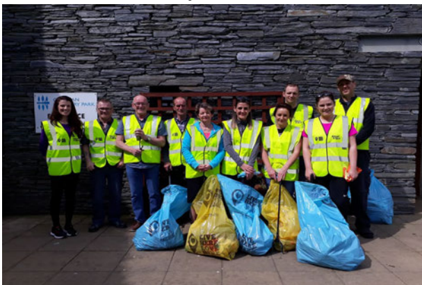
Volunteering at Creggan Country Park

During 2017/18 Creggan Country Park increased its footfall and engaged with numerous groups, school and residents from across the Triax area and further afield. Much of the work is through environmental education, volunteering and public events. CCP is able to engage residents and schools from across the area in various activities including planting, clean ups, Halloween, Christmas and St Patrick's Day themed events whilst using the environment and recreation as the main tool.