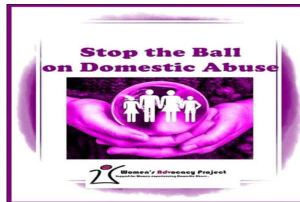
Domestic Violence Campaign