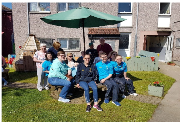
Volunteers at CPTT

CPTT has worked in partnership with a number of organisations including The Old Library Trust, Surestart, Family First Hub and North West Regional College to deliver a wide range of health, training and education projects to parents, carers and families across the Triax area. These courses include accredited and non-accredited courses, e.g. essential skills, IT & return to learn programmes, GCSE Maths & English, ECDL, RSA Stages 1, 2 & 3, healthy lifestyle training/programmes and parenting programmes, etc.