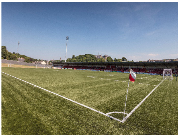
4G Pitch at Brandywell Stadium

Work on the £9m regeneration of the iconic Brandywell Football, Greyhound stadium and new Playpark was completed and officially reopened in this year. The regeneration project sees the completion of a new additional 955 seater stand that incorporates new changing rooms, media facilities, meeting spaces and safety control centre, along with standing accommodation for 270 spectators adjoining the new stand that will bring the existing capacity for the ground to approximately 3,700. In addition to the stand, the project includes a synthetic turf pitch, a standalone dog track and state of the art children's play park. Triax has worked tirelessly with numerous partners over the past eight to ten years to see this project developed and completed.