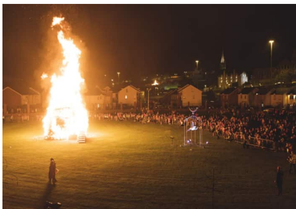
Fire Festival At The Gasyard

Over the past year CRJ (Triax) has provided mediation services, support to victims of crime, support to people with addictions, delivered OCN Child Protection and Restorative Justice Training, supported Community Relations' Projects, delivered community safety initiatives and crime prevention initiatives and signposted residents to the appropriate agencies. CRJ has played a key role in bonfire management and the development of the Fire Festival as part of the August Feile Celebrations. CRJ has been involved in many community safety campaigns including road safety, anti-sectarianism, hoax bombs, floods and home safety.