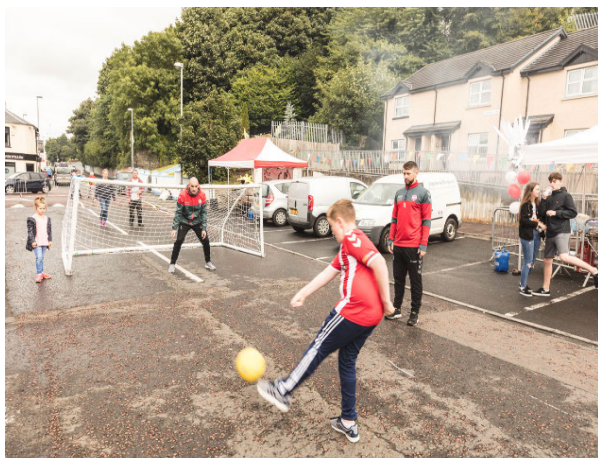
Football in the Streets

Derry City and Strabane District Council in partnership with the Bogside and Brandywell Health Forum, Old Library Trust, Long Tower Youth Club, St Mary's Youth Club and Cathedral Youth Club deliver this programme throughout the Triax Area. The key targets for this programme are Older People, Health Programmes and Summer Activity Programmes for Children and Young People. Over 1,000 people have taken part in these programmes during 2017/18.