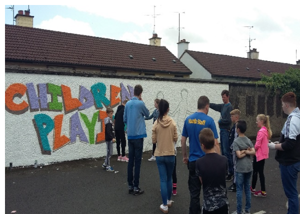
Drive Slowly Wall Mural