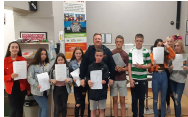
Presentation of Certificates