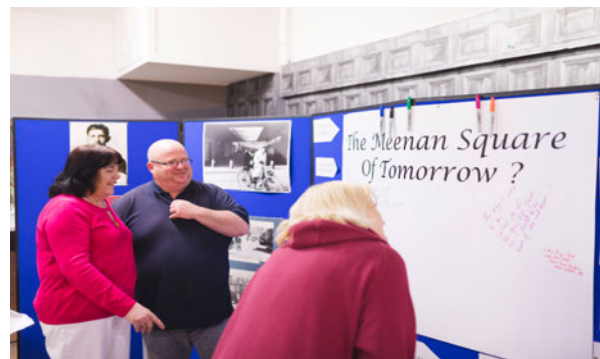
Resident Engagement in Dove House