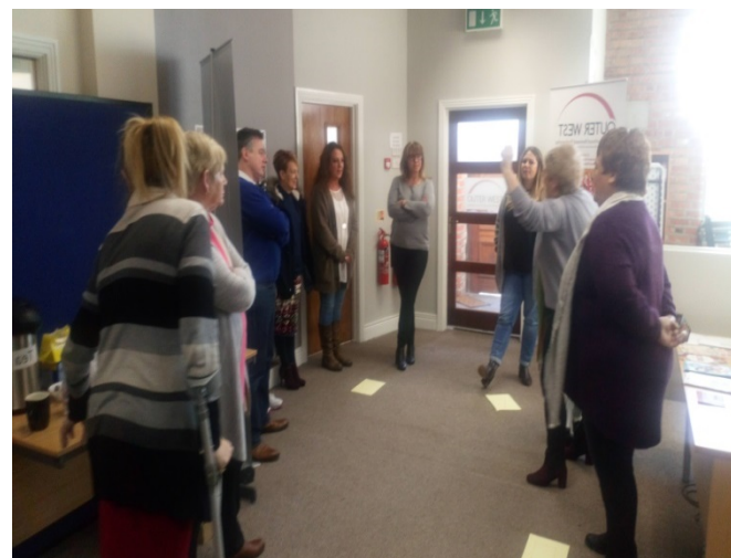
Mindfulness Monkeys Boot-camp & Reclaim, Recharge, Revive-Active Citizenship health & well-being programmes in Outer West.