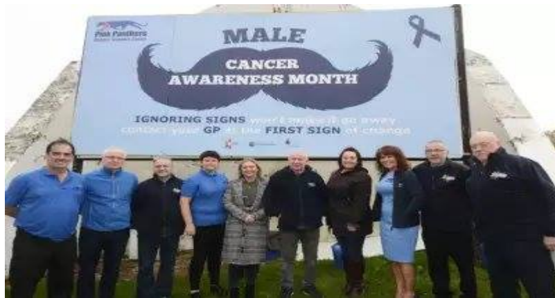
Pink Ladies and Pink Panthers launching Male Awareness Month

The Pink Ladies is a relatively new project that has already established itself within the NRA becoming the go-to service for cancer support and prevention services. The project is represented on the Health Working Group and has contributed to the action planning process.