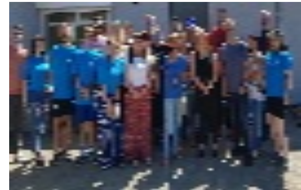
CRJ Outer West pictured with BHCP staff at the launch of the BHCP Summer Scheme