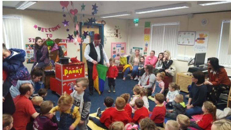
Community Library Activities at Little Hands SureStart in Outer West

The employment of a full-time Library Administrator will continue to allow the Community library to open during the day and at evenings as well as all day Friday and Saturday. This will allow residents of all ages from within the Outer West Area to avail of the educational services provided through this easily accessible and well-located building.