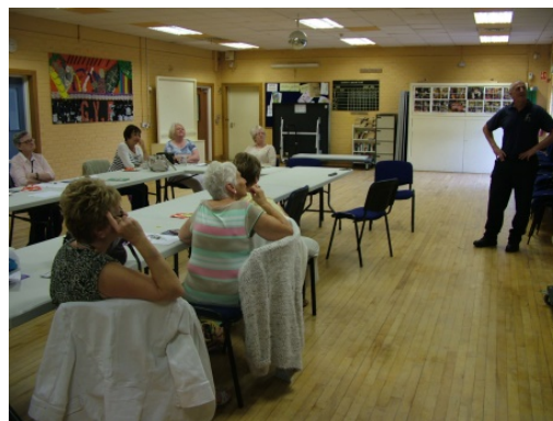
Over 50's Club Learning workshop