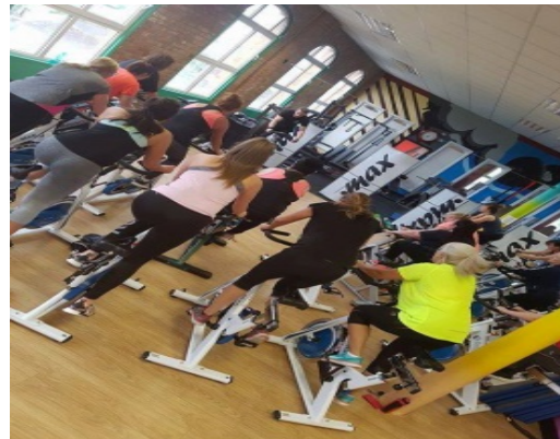
Activities at Fitness First Community Gym