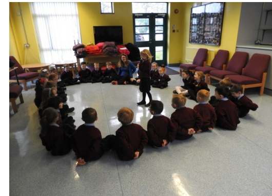
How Do You Feel Today Resilience Programme delivered at Outer West NRP Schools