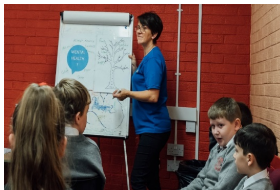
Yes Health & Safety seminar