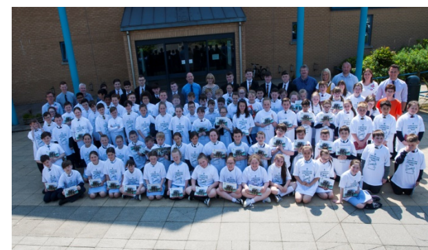
Minecraft Programme with St Joseph's Secondary School and city-wide Primary Schools.