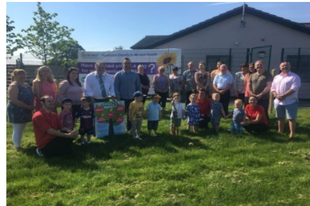
Dunluce Family Centre Annual graduations and Launch of the Take Five Mental Health Strategy at The Outer West Family Hub.