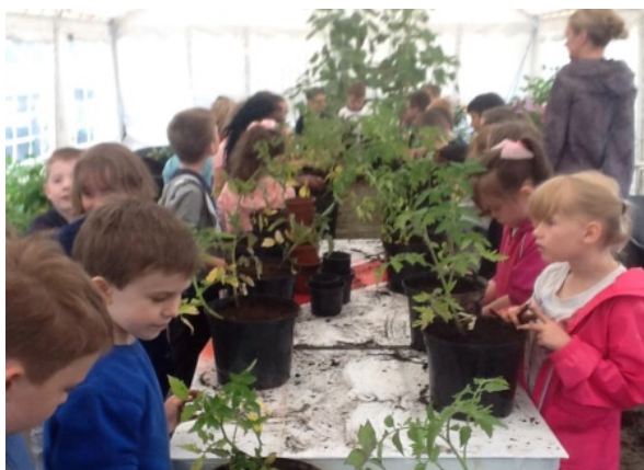
Growing Together Horticultural project

The Rosemount & District Welfare Rights Group (RDWRG) is commonly known as Rosemount Resource Centre (RRC). RRC as an organisation addresses the needs, provides services and caters for all ages of the Outer West NR Community. The services and activities offered by RRC includes Training Services (in GCSE Maths, ECDL and various IT courses), Welfare Rights Services, Youth Intervention Programmes with local Secondary Schools, Cnoc Na Ros (which provides a drop-in facility targeted at men over 40), Treehouse Playgroup (which provides a pre-school facility that incorporates parenting skills classes), Rosemount & District Women's Group (which promotes and encourages women to participate in community services), Largely Positive People (which promotes positive lifestyles), Bluegrass Playclub after schools club, NW Community Awareness, Drugs and Alcohol support group, work placement experience and volunteering opportunities. All of these services advocate community involvement and active citizenship in the Outer West area. DfC Neighbourhood Renewal Unit currently funds a Manager, Development Worker and part-time Administrator plus associated Running costs.