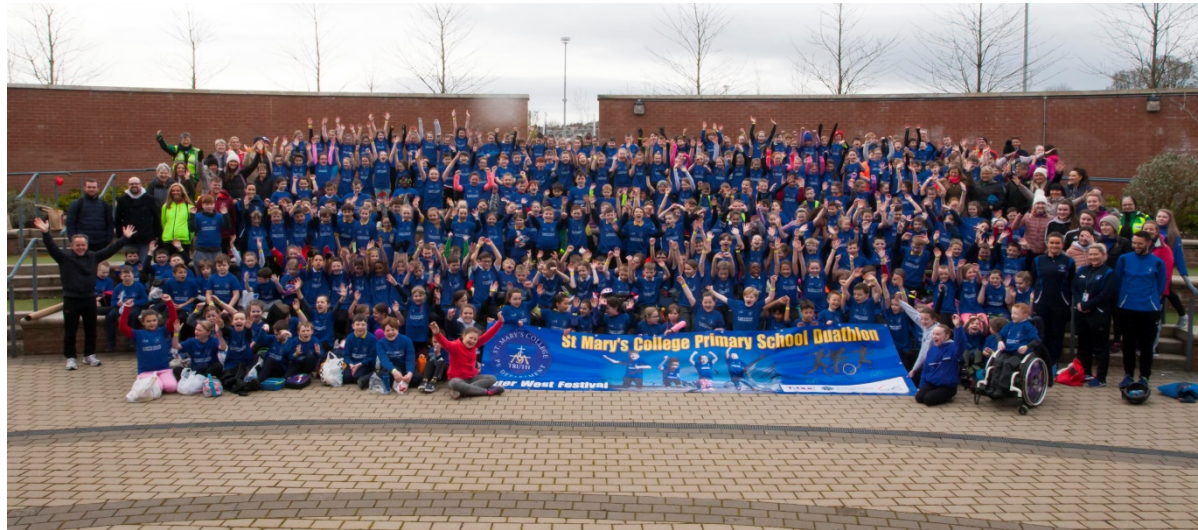
Outer West Neighbourhood Renewal Partnership “Just Du It” Festival funded by The Executive Office Central Good Relations.