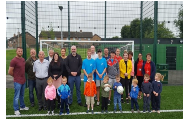
BHCP Pitch and Play Park