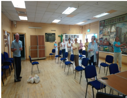
Glen Gets Active

The Neighbourhood Health Improvement Project has made a positive impact in the OWNRA supporting and developing existing work in the area. The development of a NHIP Health Action Plan in the area has allowed groups to identify local need and gaps in current service provision and tailor service delivery to meet need. The project has assisted in addressing actions within the Neighbourhood Action Plan under Community Renewal, Social Renewal and Physical Renewal.