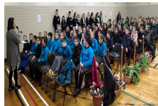
Yes Activity Programme 2017/18 including Outer West NR young people