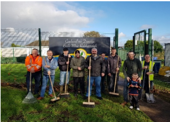
Teamworks and CRJ carry out clean-up at Gaiscoil na Daróige

The mediation service assists with crime prevention and via partnership working victims of crime have been supported and home security increased. CRJ also seeks resolutions to youth related issues by employing intervention, preventative and diversionary methods and by signposting some of the young people to outreach workers and other youth providers. CRJ supports victims of crime and helping them to make their homes more secure through the Lock Out Scheme. CRJ provides a service for people with drug addictions and signpost them to the relevant organisations.