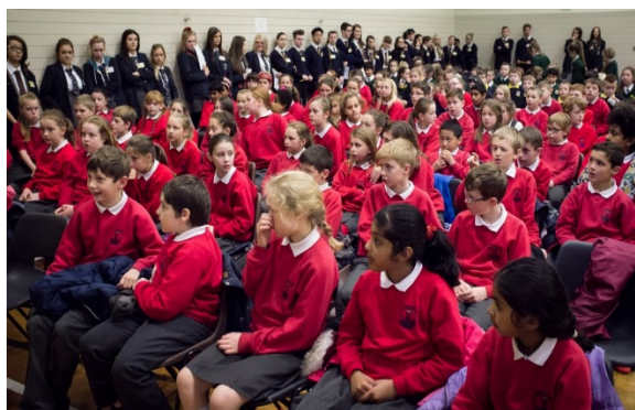
Yes Awareness Activities Project 17/18

This project provides young people with interactive workshops on health and safety issues and personal development programmes based on physical and mental health as well as personal safety and community safety issues. These workshops and programmes cover issues such as drug, alcohol and substance awareness, sexual awareness, anti-bullying, cultural and community relations, mediation and conflict resolution, building intergenerational relationships, hoax calls / attacks on emergency services, and includes activities including environmental improvements, alternatives to bonfires, community murals and health and fitness initiatives, such as, inclusive games, yoga, midnight street soccer etc. The project actively assists in educating young children from the 4 NRAs in health and safety issues affecting their communities and the initiatives and workshops assist in improving social conditions and impact on the delivery of Action Plans across all 4 NRAs in the Derry area.