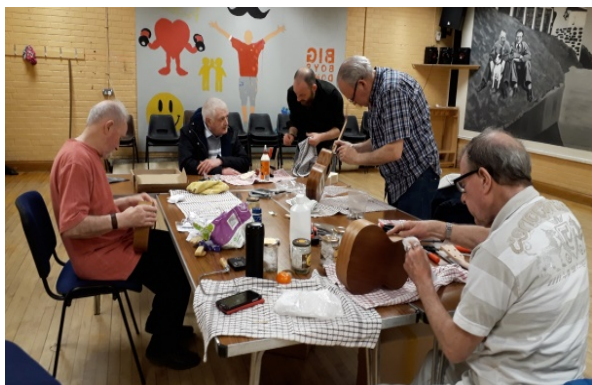
GDI Men's Shed Ukulele workshop

DfC Neighbourhood Renewal Unit currently fund a Manager and two Development Workers plus associated running costs.