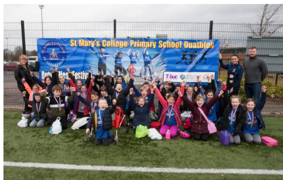
Outer West Neighbourhood Renewal Partnership “Just Du It” Festival funded by The Executive Office Central Good Relations involving city-wide schools.

The role of the Strategy Manager, funded by DfC through the NR Investment Fund, is to work closely with the OWNRP and DfC to strive to develop and achieve a confident community that is able and committed to improving the quality of life in the Outer West. The Strategy Manager assists in delivering new projects and increasing services and programmes which benefit all residents in this NR area therefore reducing the gap in deprivation measures between Outer West and non NR areas. The Strategy Manager engages with all relevant statutory bodies and non-Government funding bodies to lever in additional funding to deliver on priorities identified within the NR Action Plan.