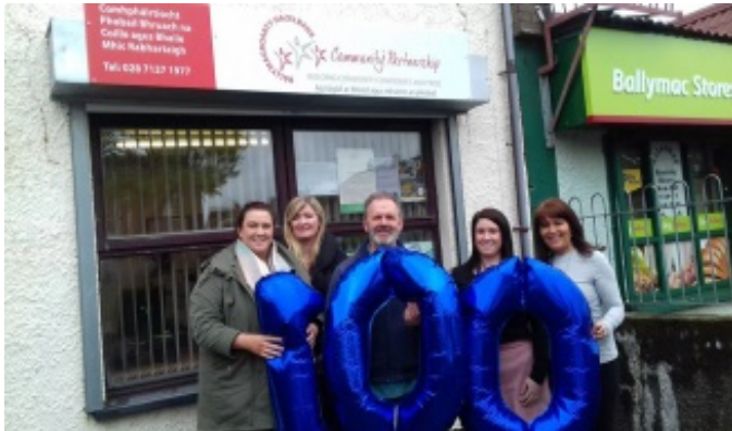
Compassionate Communities Programme delivered by BHCP

This project offers a wide range of programmes such as youth intervention, welfare rights, women and men's groups, work placement experience, health checks and volunteering opportunities for local residents. The project provides access to new cultural opportunities and promotes personal development as well as supporting and increasing community capacity. The BHCP project also works with relevant stakeholders to develop capital development projects. NR Funding is provided to employ a Manager, Administrator and two Regeneration Officers plus associated running costs.