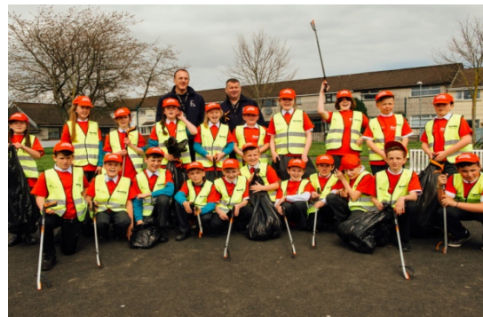
Community Clean-Up with the Junior Wardens