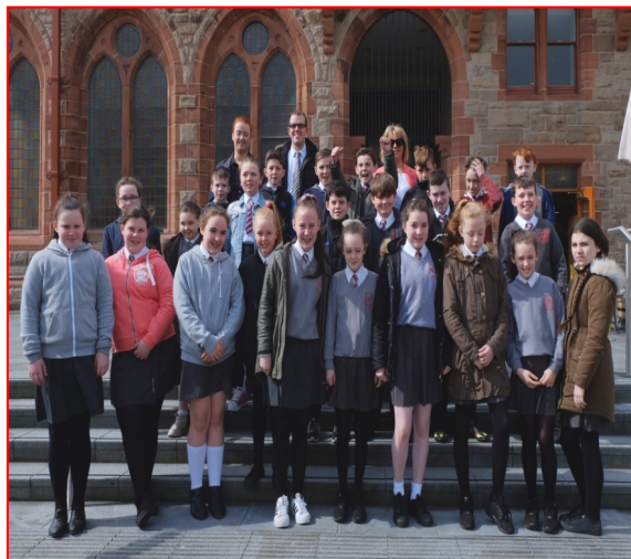
Holy Family Junior Wardens at Guildhall during Civic Pride Tour

As well as contributing to a safer, cleaner environment the project will enable the young people to meet new friends, develop new skills and ultimately to have fun.