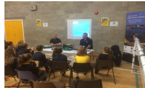
Community Safety Talk at YES Event