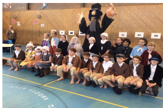
Outer West Neighbourhood Renewal Partnership Community Tourism Project “The Derry Giant” with The Model Primary School.