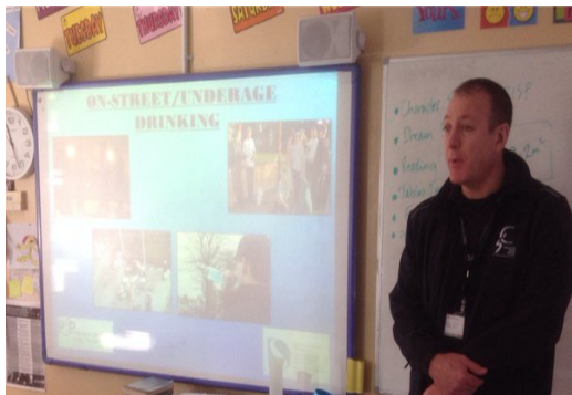
Youth Workshop – On Street /Underage Drinking

The project also focuses on reducing the fear of crime and will implement crime prevention initiatives in order to reduce incidents of anti-social behaviour within each of the four NRAs.