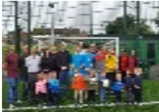
CRJ Outer West pictured with BHCP staff at the opening of the Ballymac 3g pitch