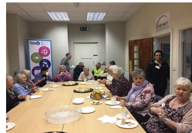
Express Yourself Seniors programme to combat loneliness and isolation