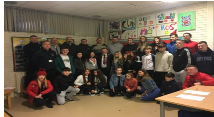
Youth On the Road and Game On Mayoral Initiative-Youth Engagement Plus activities in the Outer West NRA.