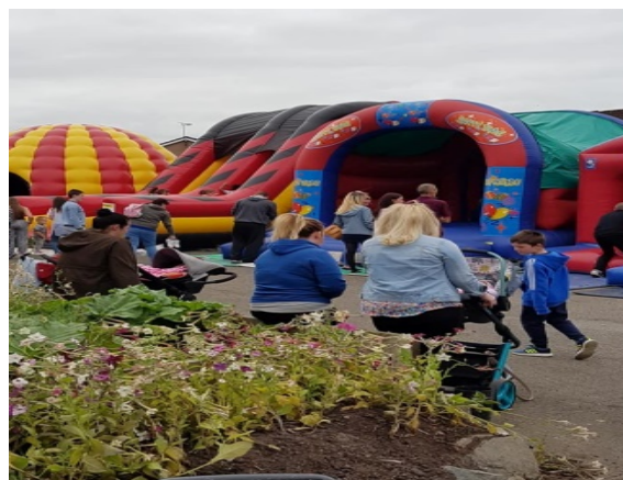
Rosemount Resource Centre Cultural Celebration Day