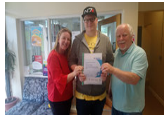
GDI Foyle Community Works Graduate