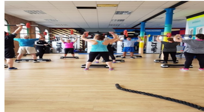
The Fitness Factory classes