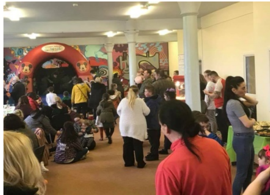
BHCP Family Fun and Cultural Day at the Outer West Cultural Hub