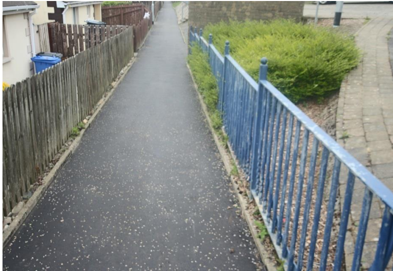
Walkways are safe for pedestrians