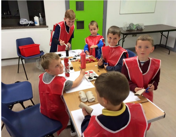
Children enjoying the Multi-functional space