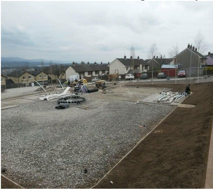
Site be cleared so work can get underway