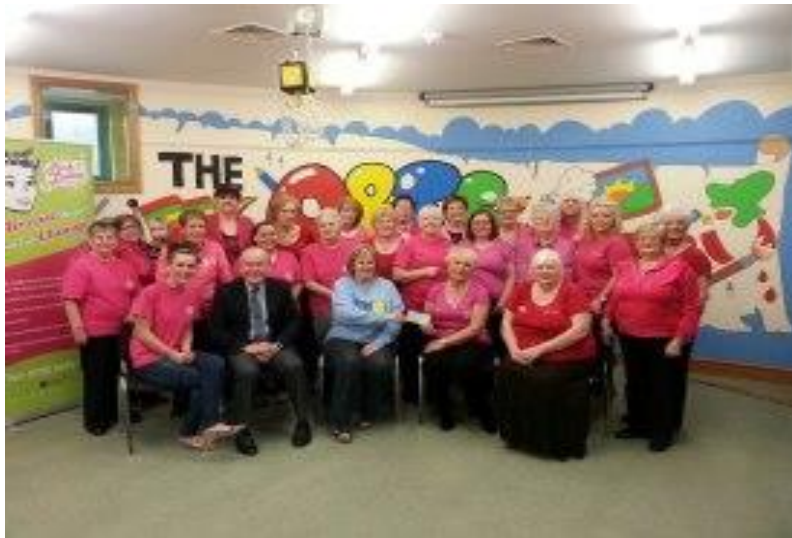
Pink Ladies Information Event