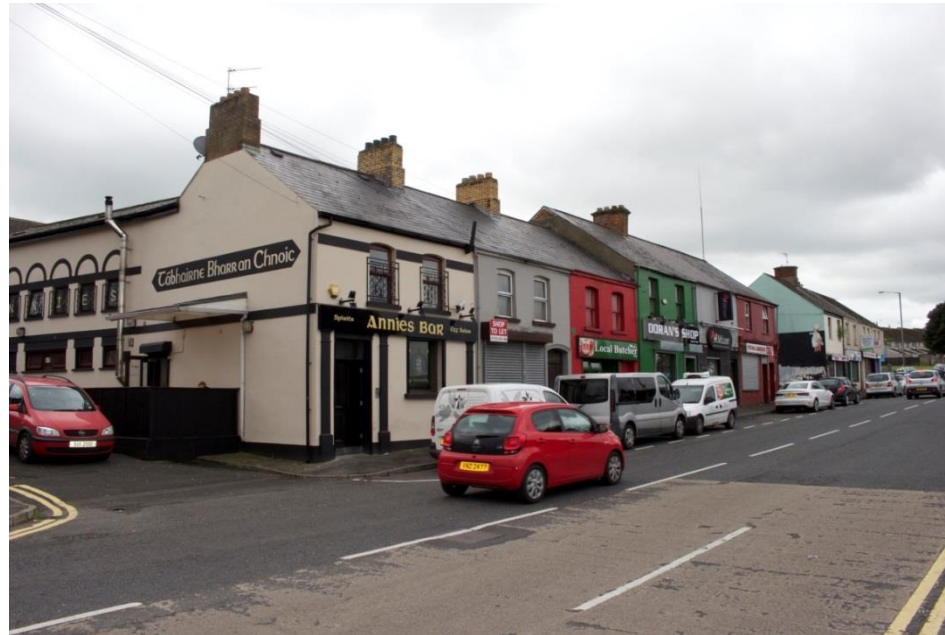
Shopping area along Strabane Old Road, Top of the Hill

The Department for Social Development, in partnership with Waterside Neighbourhood Partnership and Hillcrest Trust delivered a revitalisation /public realm improvement project to the commercial area of Top of the Hill along the Strabane Old Road. The overall aim was to promote the Top of the Hill area as economically strong and accessible neighbourhood which provides a high quality shopping experience contributing to a more vibrant community for those who live in, work in and visit the local area. This is a much utilised arterial route into the greater Waterside and as such the Restore Project in significantly improving the external facade of the commercial premises located along these key streetscapes is showing the Top of the Hill is open for business. As part of the scheme seven local businesses received funding to improve their properties appearance.