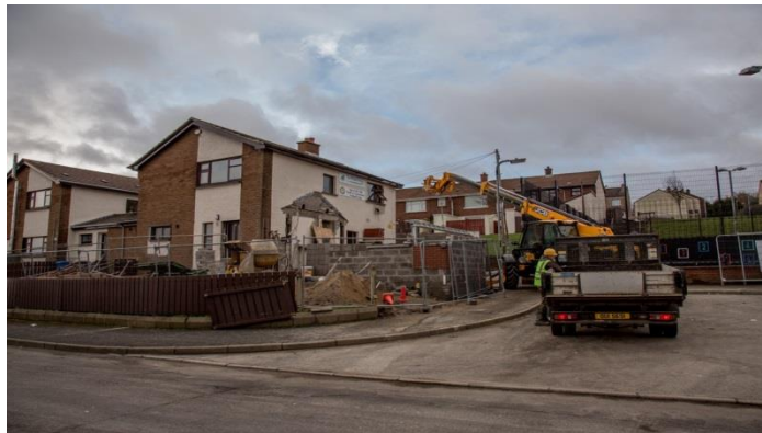
Renovation works commence