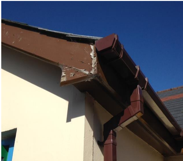
Fascia needed to be replaced