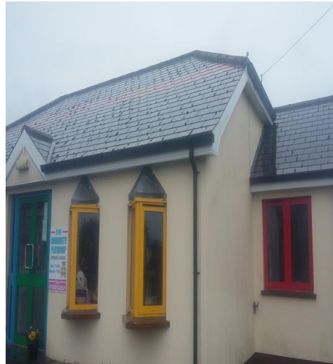
Fascia works completed