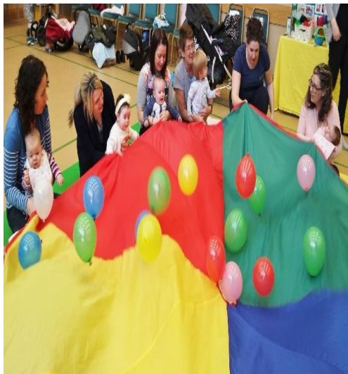
Baby Sensory Photographs

Talking To Our Babies is a community-led early intervention initiative. Aimed at parents, carers, childcare professionals and the wider community, the project aims to support and enable all in our community to have a deeper understanding of how preschool-aged children’s language develops, and the impact that language development has on educational attainment. In the Waterside, the Talking To Our Babies Co-ordinator has delivered a range of programmes and campaigns such as: Our ‘Musical Pathways to Learning’, Baby sensory classes, Giving up the dummy packs, language milestone campaigns including:- “Starting Nursery – Let’s Talk Together”, Mango the Monkey, ‘Share A Story, Share A Smile” campaign, “Talk Together” communication campaign, Little chatterboxes and Elklan speech and language training courses, Our Little Artists’ programme and Musical Pathways to Learning.