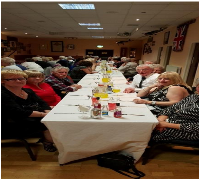
Older People's Christmas Dinner