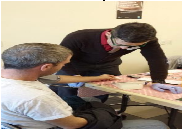
Men's Shed Project