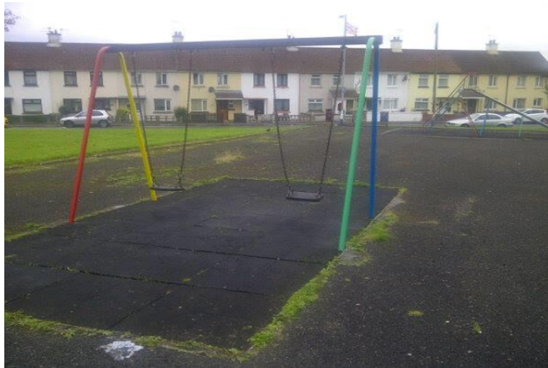
A tired looking play area before refurbishment works