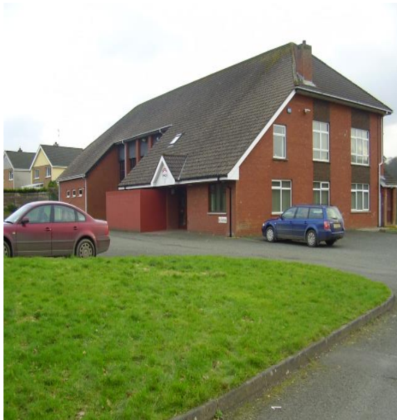
YMCA prior to renovation works