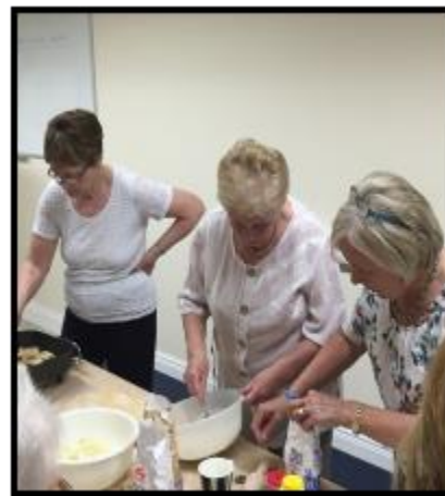
Baking Master Class