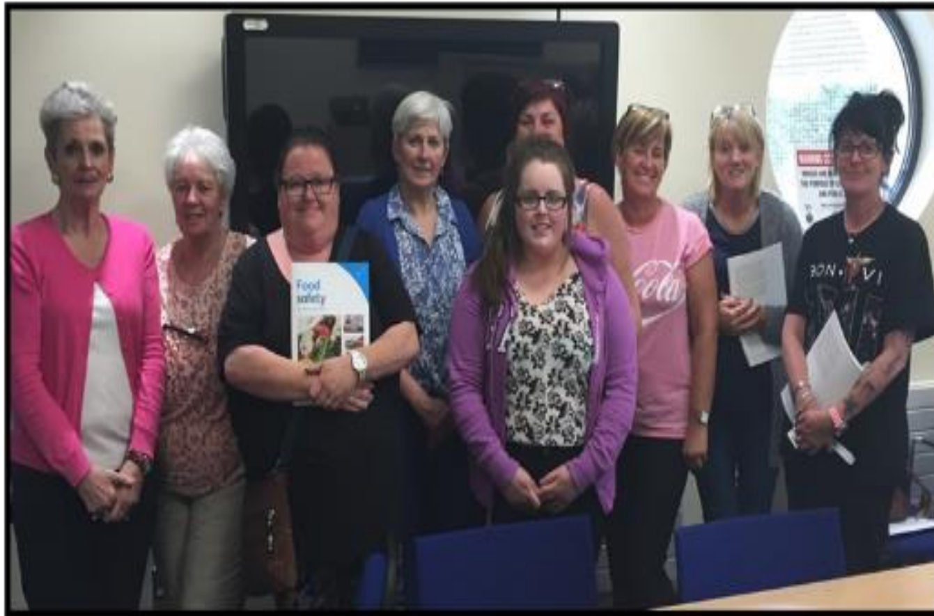
NR residents completed Level 1 Food Hygiene Training