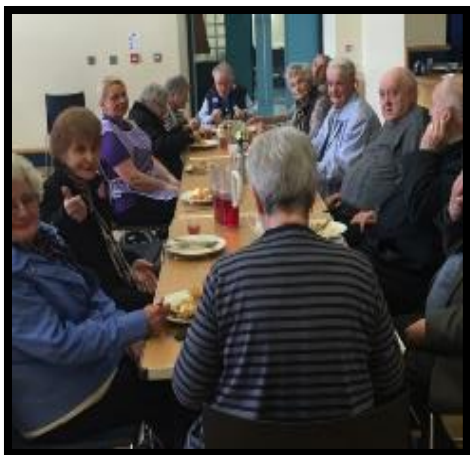
Senior Citizens Club

The Omagh Health Coordinator is employed by the Western Health and Social Care Trust, made possible through funding from NRIF, and managed by the Health Improvement Team. In this reporting period the Health Coordinator, in line with the Health Improvement Department promoted regional campaigns throughout the year within the Neighbourhood Renewal communities, such as World Mental Health Day, No Smoking Day and Men's Health Week. Neighbourhood Renewal area residents had opportunities throughout the year to attend a variety of training including Mental Health First Aid, SafeTalk, Walk Leader training, Cook It! training and much more. Neighbourhood Renewal residents attended Traveler Cultural Awareness training and resilience seminars – which were coordinated by the Health Improvement Department. In January, 11 people were trained as Community Health Champions – and gained a Level 1 OCN accreditation. Members from Omagh Men's Shed attended this training, and as a result have run a successful Open Day and Health Checks at the Omagh Men's Shed.