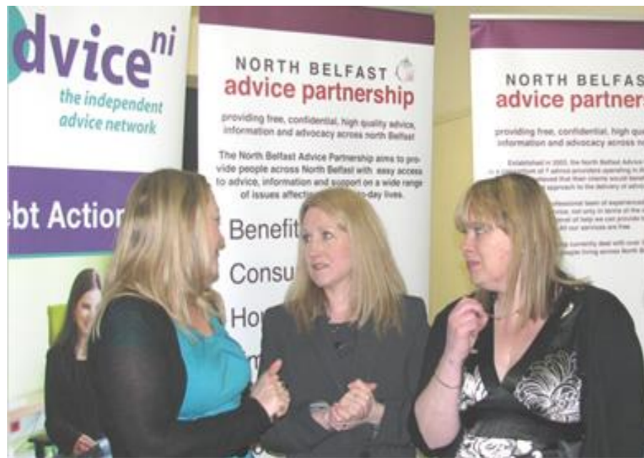
Money and Benefit Advice

16 people took part in SafetyNet training. Participants were taught about the dangers of drugs and alcohol abuse. The Asist training and SafetyNet training enabled participants to gain a formal, recognised qualification. The training of LIA staff resulted in the organisation being recognised as the first registered Safety Net centre in Belfast.