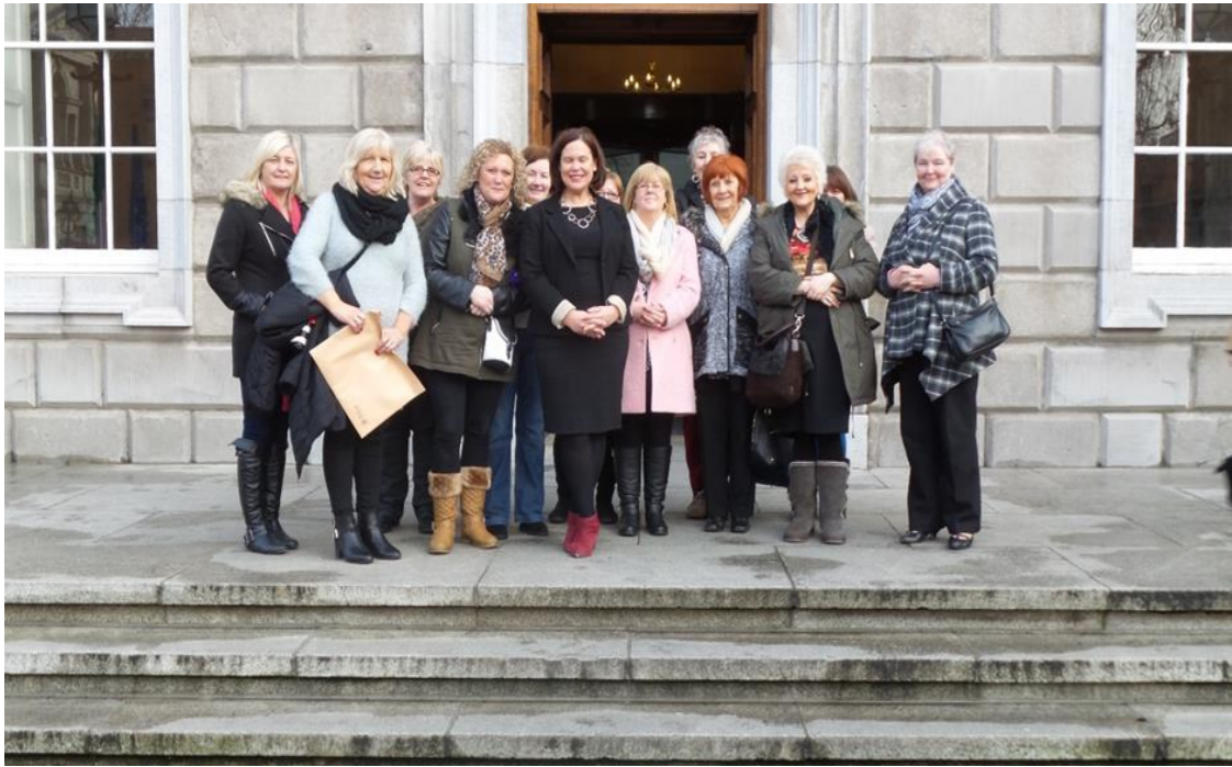
Women at the Dail

In the latter part of the year LIA staff and the group of women involved in the Women in Politics Programme visited the Dail, Stormont, Parliament, and the Scottish parliament, where they were given the opportunity to find out at first-hand how all four political systems operated and to discuss with political representatives what issues they are experiencing within their own areas and what they feel the politicians in Norther Ireland should be doing..