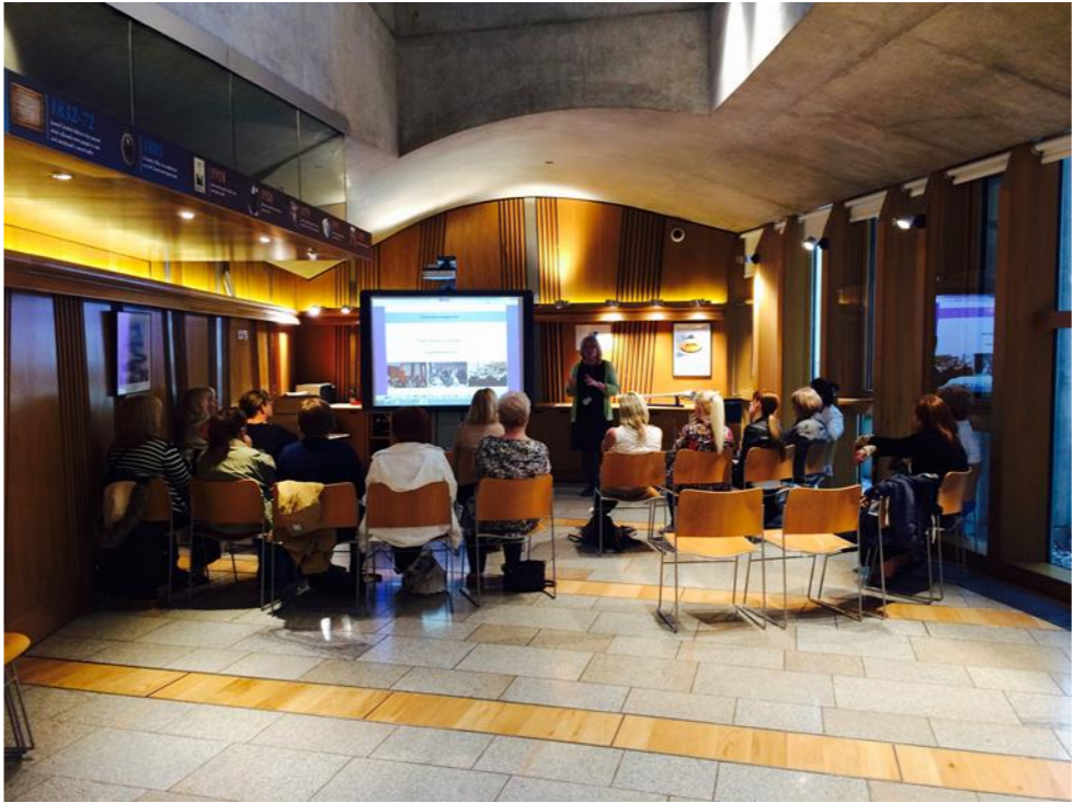
Finding out how the Scottish parliament works