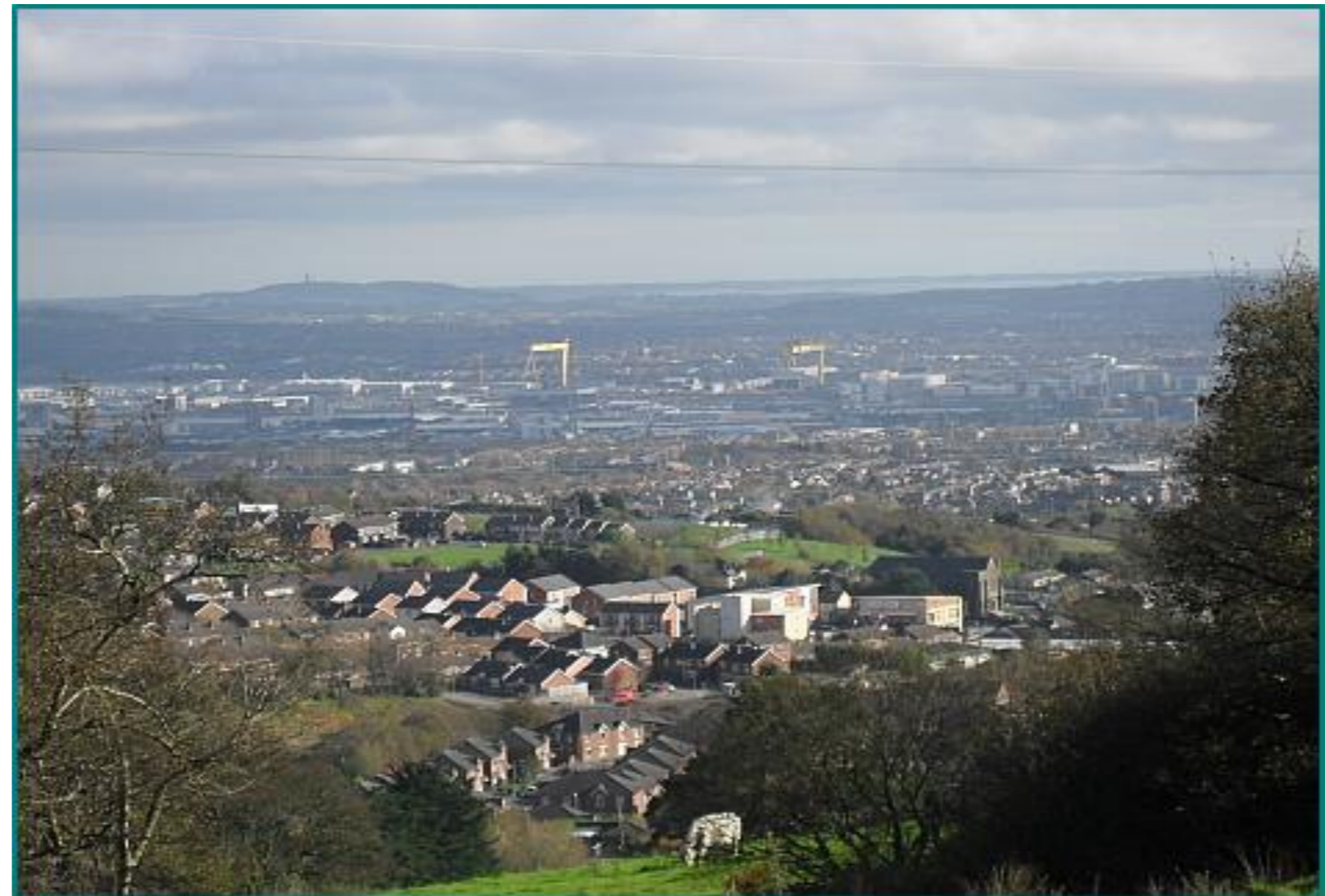
View looking over Ligoniel Village