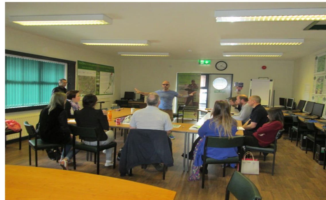
Safety Net training at the Wolfhill Centre

Last year as part of SSA Benefit uptake an advisor received referral for elderly couple wanting a full benefit check. The advisor identified that the gentleman was in receipt of high rate mobility and middle rate and both were receiving state pension. The advisor did a full benefit check and identified the lady should be receiving Attendance Allowance; they both should apply for Pension Credit, Carers Allowance and Rates Relief. Rates relief was paid in full and they received £22 per wee pension credit however the lady's Attendance Allowance was disallowed. The advisor appealed the decision as it was based on an examining medical practitioners report from Attendance Allowance and took the case to appeal, the lady was awarded high rate Attendance Allowance at £79.15 per week back dated for 62 weeks and both received a higher rate of pension credit including cares premiums backdated for 62 weeks, there new weekly total is £617.59 an increase of £287 per week and they received back dating money of £16,414.50. This made a great different to them as they were able to purchase a mobility scooter to get to local shops, doctors and chemist.