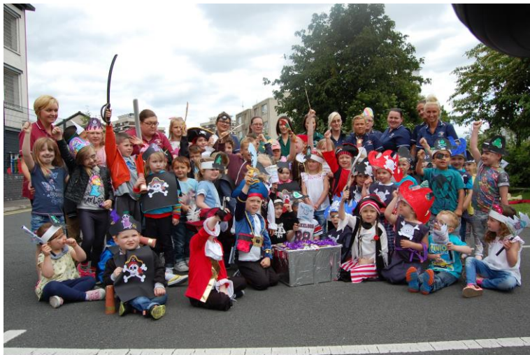
Children dressing up for Kinderkids