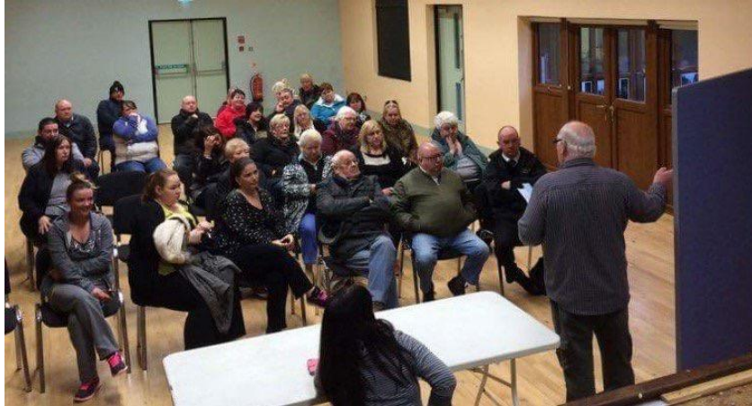
Community consultation about traffic calming in Carrick Hill