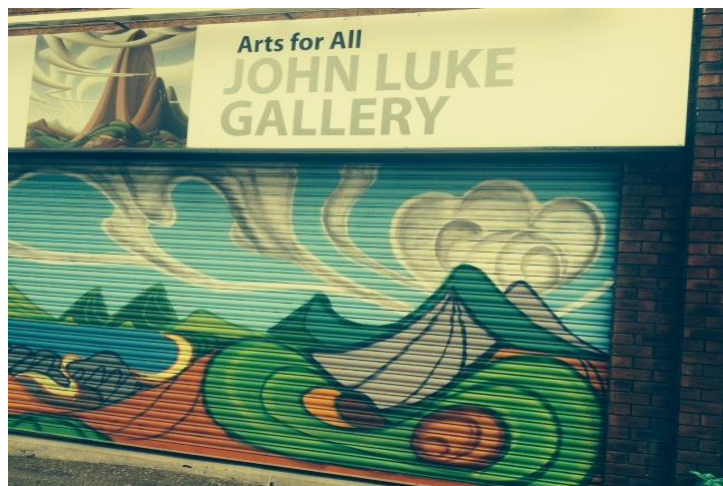
Mural at Arts for All John Luke Gallery