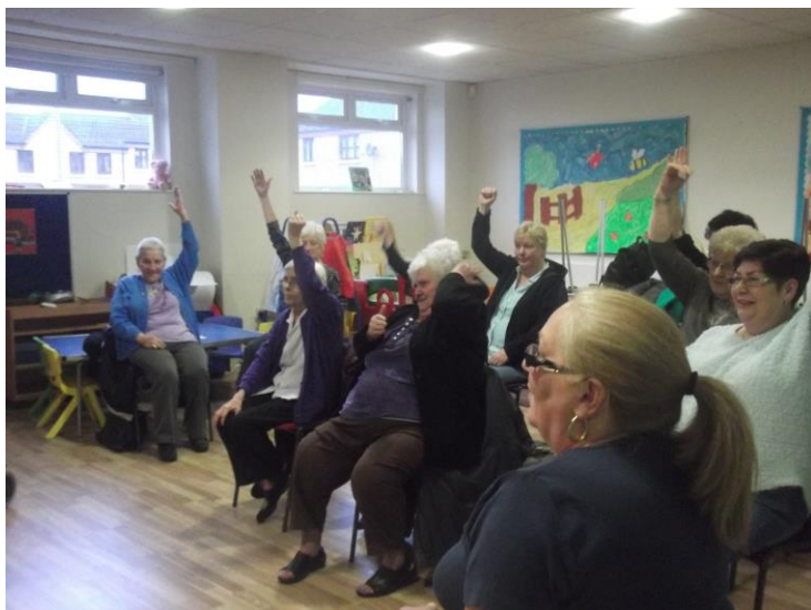
Older residents taking part in armchair exercise class at Star Neighbourhood Centre