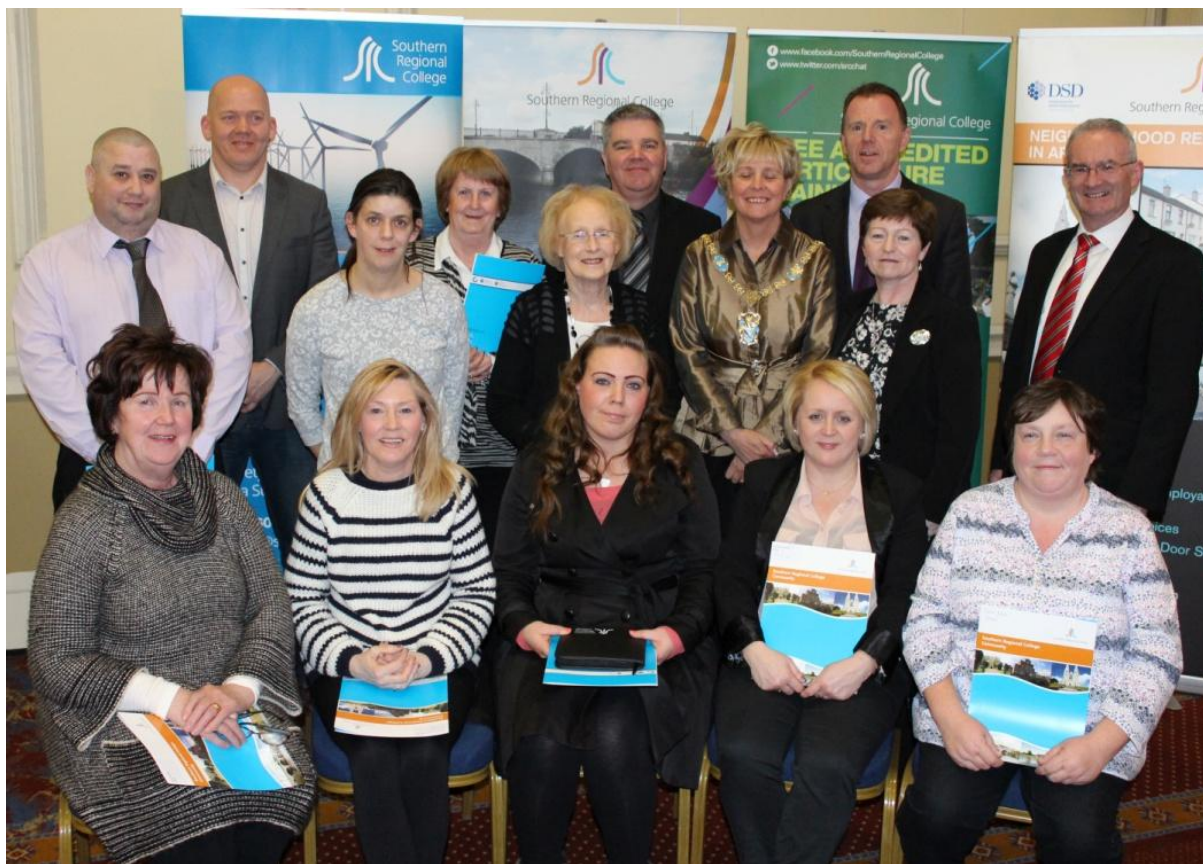
SRC Graduation event at City Hotel April 2015