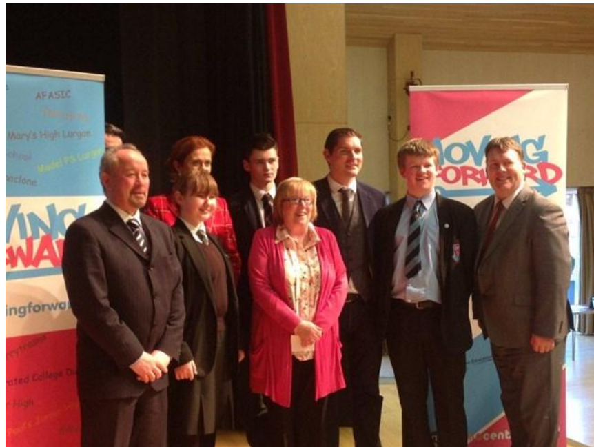
Craigavon – Transitions programme delivered by the Southern Education and Library Board Education Welfare Service. Picture includes participants from some of the schools involved in the creation of the Transitions App.

people make the transition, by attempting to allay any fears and concerns they have through the sharing of experiences and learning of others. It will also aim to assist in the improvement of attendance levels, levels of educational attainment and general engagement in school.