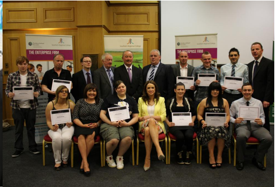
Residents achieving qualifications through The Enterprise Project