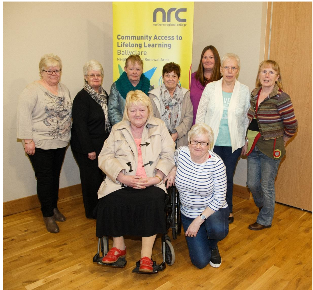
Pictured above are some of the participants on the courses offered as part of the CALL Project who attended the Celebration Event on Wednesday 25 March 2015.