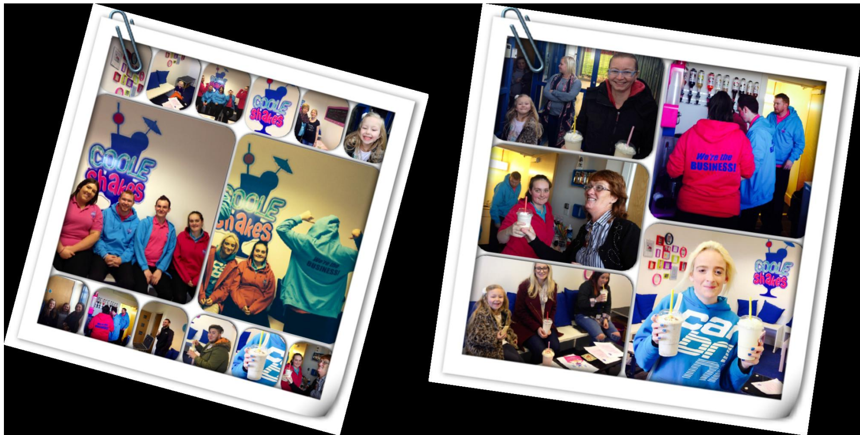
Above We're the Business participants with their branded products.