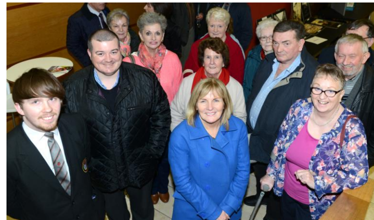
Showcase event at Strule Arts Centre on 26 February 2015