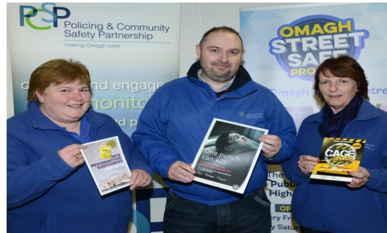
Launch of Street Safe Logo