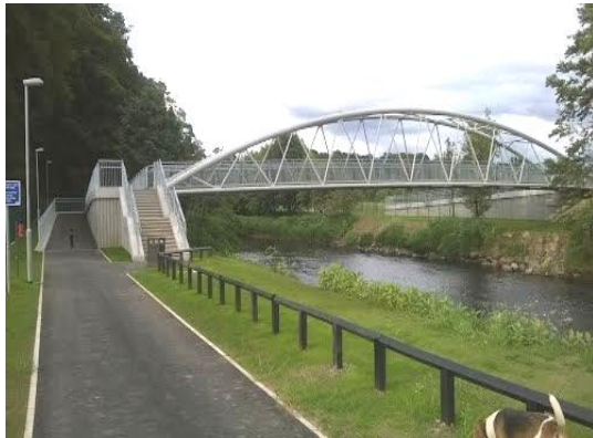
Phase 2 bridge completed in 14/15

Funding for the project was provided by the Department for Social Development through Omagh Neighbourhood Renewal and the Big Lottery Fund and was spearheaded by Omagh District Council. The 750 metre long pathway creates a connection for communities which previously required a journey around the town. The completion of this project enables a number of new initiatives to be rolled out to the residents in the Omagh area including social and physical activities such as walking clubs, opportunities for fishing and for young people to learn about nature and outdoor life.