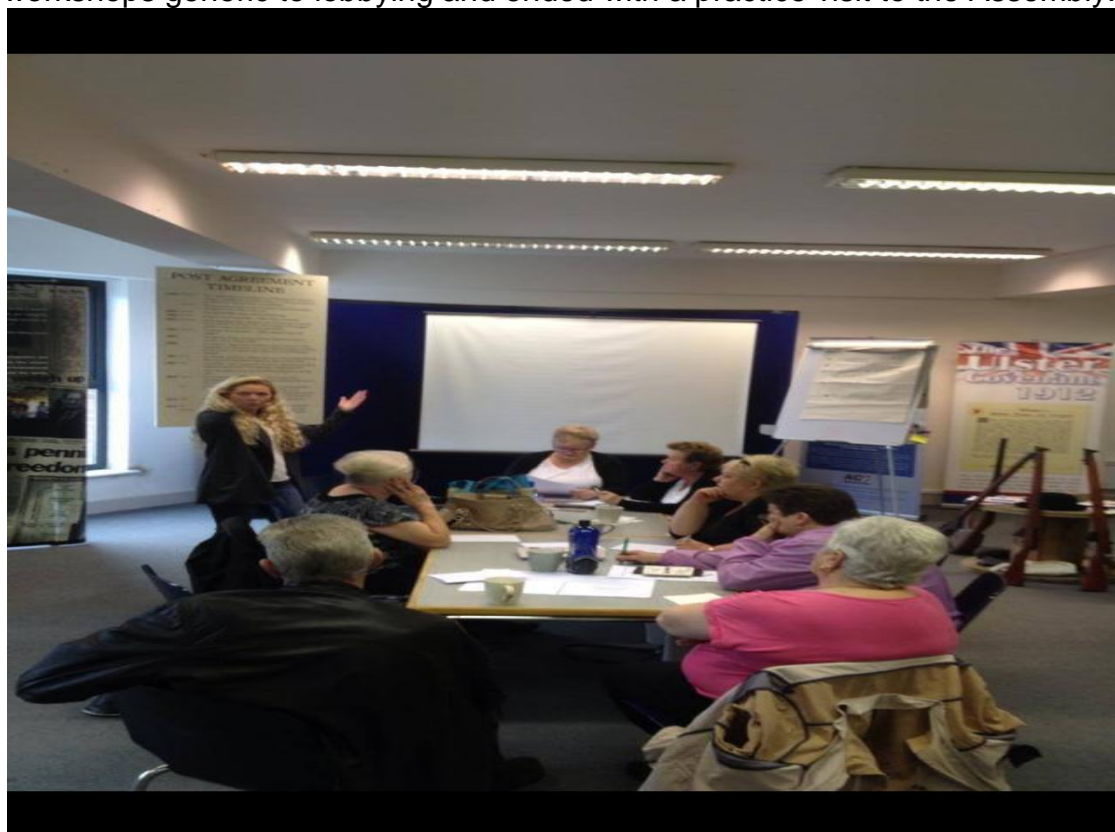
Picture of Loughview Community Action Partnership members participating in Lobbying workshop

An example of a programme that was facilitated by LCAP was a lobbying course for older people which consisted of a series of workshops generic to lobbying and ended with a practice visit to the Assembly.