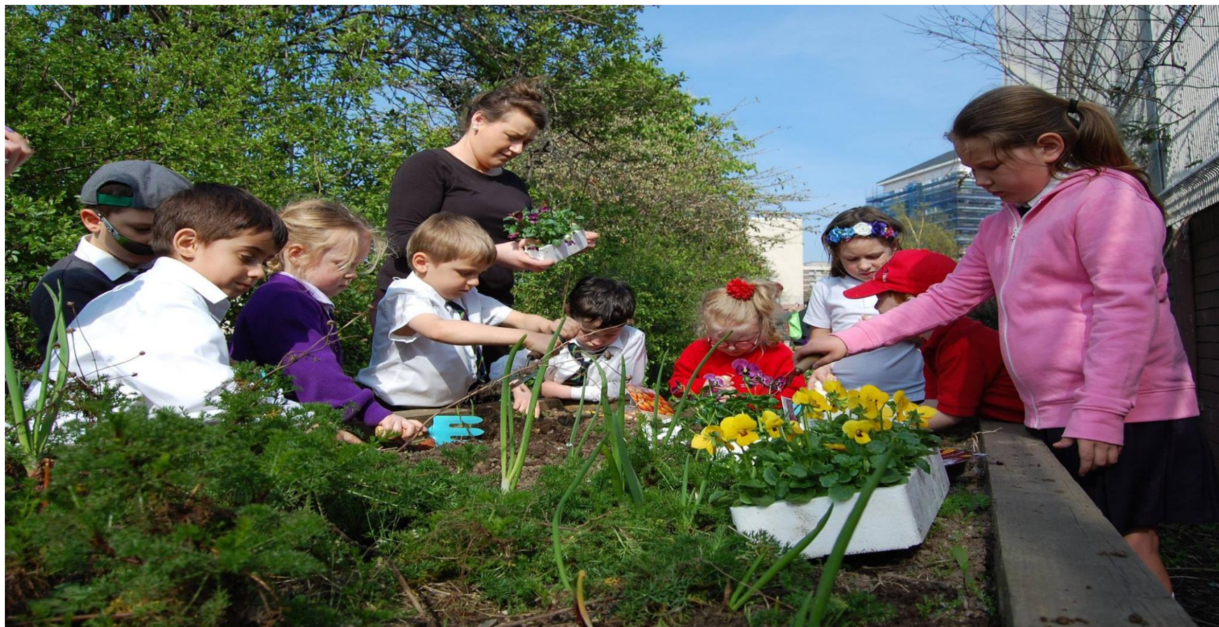
Children from Kinderkids Daycare participating in a Dig in Day at McSweeney Community Garden

Children from Kinderkids Daycare took part in a Dig in Day at the Community Garden at Mc Sweeney Centre (previously funded through BRO's Physical Development Unit). The children planted vegetables from runner beans to sweetcorn, cauliflowers to cabbages. The children tend to the garden over the summer months and this will promote an understanding of the lifecycle of vegetables and living things. The children have been encouraged to try the vegetables grown to encourage healthy eating – picture below.