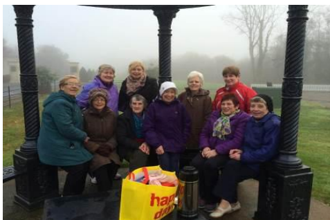
Devenish Health Project Walking Group