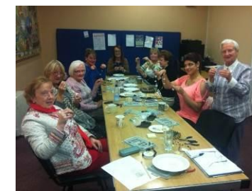
West End Communities Centre Arts & Crafts Classes