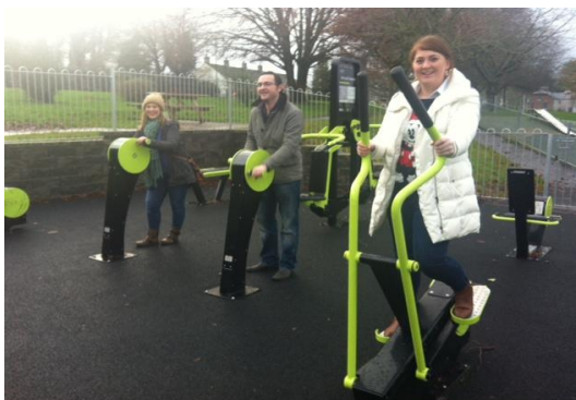
Gym Equipment at the 'Round O'