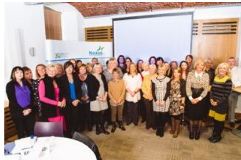
Nexus celebrates 30 years