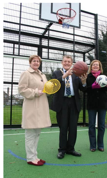
Windmill Drive's new MUGA