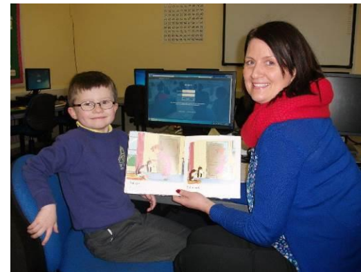
One to One reading/counselling at Holy Trinity School

This programme is based in Holy Trinity School delivers specialist services to pupils including counselling. There has been a significant increase in the reading age of its primary school participants by up to nine months in some instances.