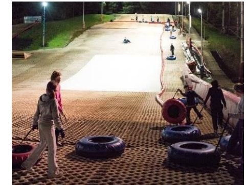
Team building opportunities