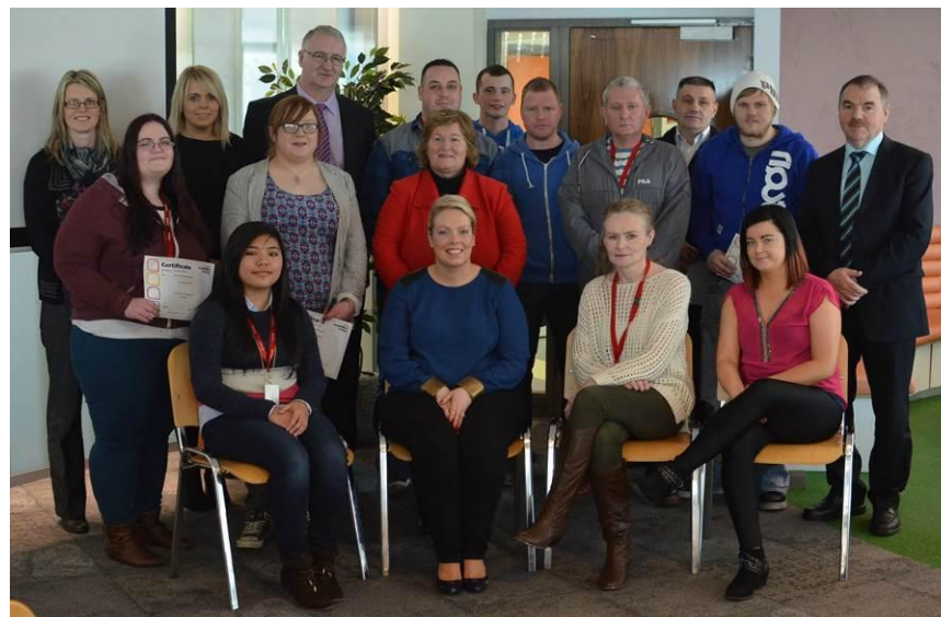
Enniskillen & Omagh Celebration of Success

The aim of the programme is to increase the confidence and motivation of residents which will encourage them to undertake additional training leading to improved levels of employment within their community. Another unique feature of this project is the fact that there is no age limit as a lot of the current opportunities available are targeted at the under 25 age bracket. DEL have confirmed that this programme complements existing college provision, by providing access to education and training as NRA residents are currently underrepresented in College enrolments in each of these NRAs.