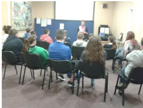
Youth Forum Meeting

The aim of the project is to develop a youth-led programme including leadership training and peer mentoring which includes pathways to qualifications/ accreditation that leaves a lasting legacy of new community leaders across the Neighbourhood Renewal Area. This will involve engaging young people living in areas of deprivation, ensuring access to a professional sustained youth service and opportunities which make for a better quality life. The programme includes creating a cohort of 16 trained peer educators; the development of drop-in facilities operating out of Kilmacormick Resource Centre and the West End Community Centre; health programmes for young people within the NRA to divert young people from risk taking behaviour; informal education programmes that are both accredited and non-accredited, contributing to personal and social development and educational attainment and schools programmes based in various schools and within community based learning projects to address educational underachievement within the NRA.