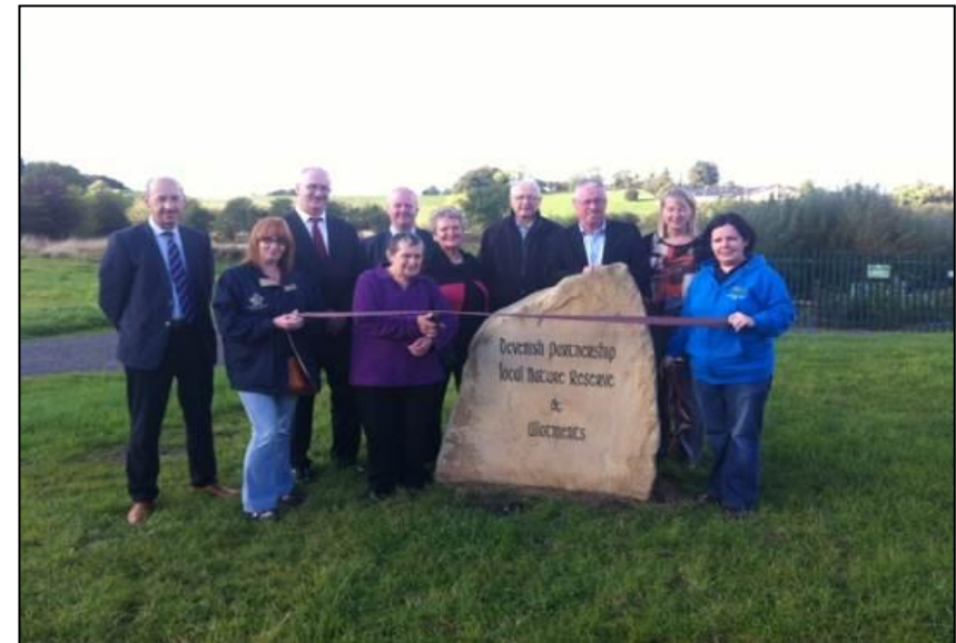
Official Opening of Devenish Nature Reserve on 10 October 2014