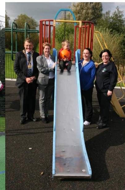
Play equipment at Derrin Road Play area