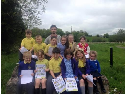
Outdoor activities with the Homework Club

This programme links four organisations: Devenish Partnership Forum, Westville Family Resource Centre, Kilmacormick Community Playgroup and Fermanagh Women's Aid to provide family support, promote and enhance educational attainment, creates and safeguards childcare places and offers one to one support to children who have experienced/witnessed domestic violence from NRA of Enniskillen. This is an early intervention programme and is an invaluable service to improve outcomes for children and their families. We are the only service providers in this area providing this programme to families in the NRA of Enniskillen.