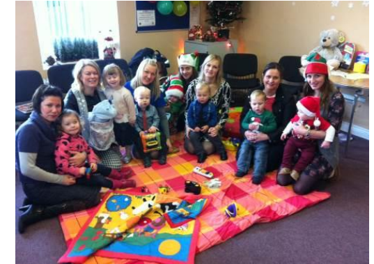
Parent and toddler group at the West End Communities Centre