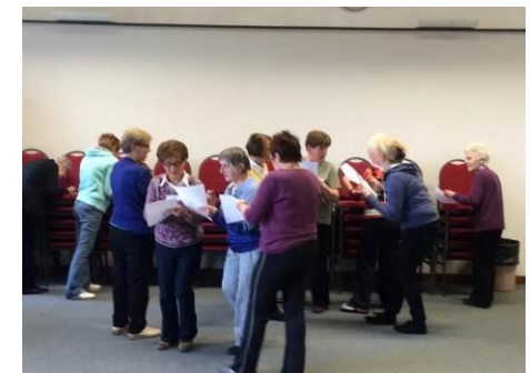
Devenish Health Project Pick 'n' Mix group