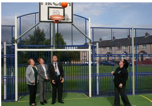
Loughview Drive's new MUGA

There has been a programme of improvement for playparks within the Enniskillen NRA. Two multi use games areas (MUGA's) have been constructed in the Kilmacormick 1 and West End areas of Enniskillen; Adult outside gym equipment installed at the 'Round O'; Playpark improvement and pitch reseeding in Cornagrade. The facilities that are now open to the public are very popular and well used resources.