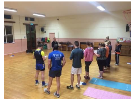
Devenish Health Project fitness class