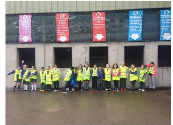
Enhancing the homework experience through opportunities including nature walks and a visit to the recycling depot.