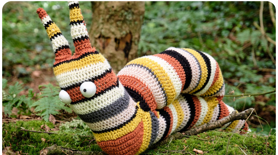
A knitted snail was just one of the crafted creatures taking over Pomeroy woods.

The clever crafters at Rural Action have also created knitting patterns for anyone to use – so fans can continue Wonderful Wildlife at home.