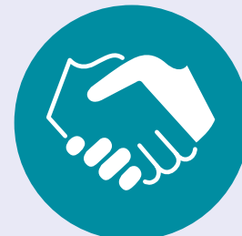
Building Positive Relations

A selection of PEACE IV-funded projects were included in the evaluations that have been carried out by RSM UK.