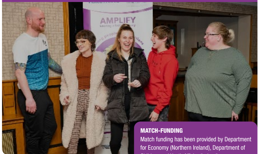
Amplify participants at the project celebration.

This storybook is a great example of how PEACE IV-funded projects such as AMPLIFY have inspired, supported and enabled young people to show courage and contribute to peacebuilding across Northern Ireland and the border counties of Ireland.