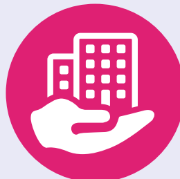
Shared Spaces and Services