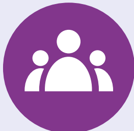
Children and Young People