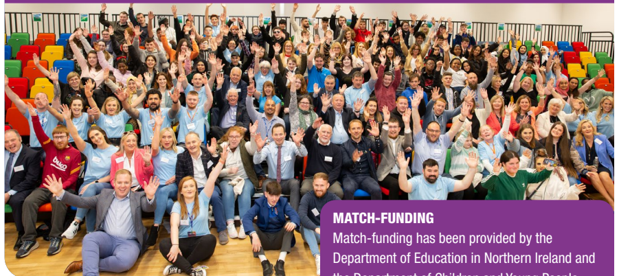
Youthscape participants celebrating at South Western College in Enniskillen.