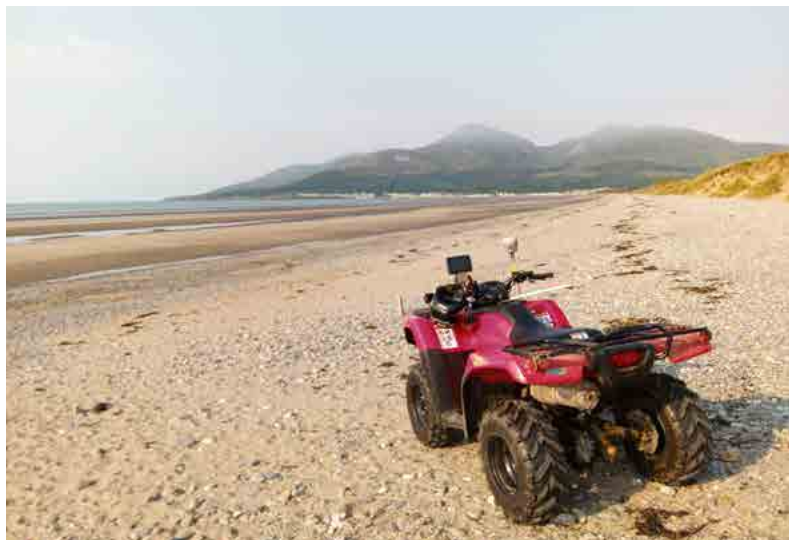
Regular surveys are being carried out on the stretch of shore between Newcastle and Dundrum to find out how, and why, our coastline is changing.

Match-funding for the MarPAMM project has been provided by the Department of Agriculture, Environment and Rural Affairs, Northern Ireland and the Department of Housing, Local Government and Heritage, Ireland.