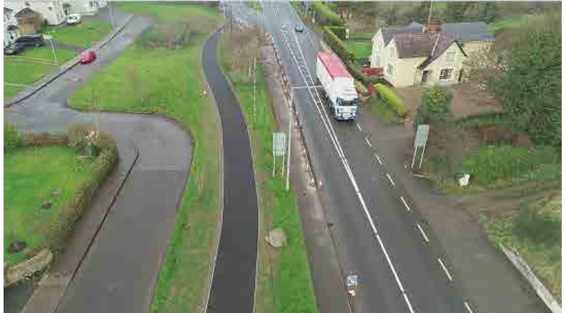
An aerial shot of a section in Lifford linking Murlog primary school to Strabane town centre.

This development falls under route three (Lifford – Strabane) of the €14.9m North West Greenway Network project.