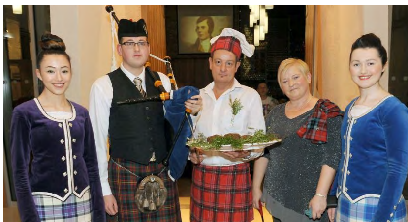
Community Burns Night at Hosford House Oiche Burns i measc an phobail ag Hosford House

The Agency has supported local initiative Bryson Future Skills by taking a work placement for 2 days per week, in which we hope to support and develop young people from our local community, helping them to acquire business skills which will be of use to them as they seek employment. The staff also held a St Andrew's Night and Burns Night celebrations at Hosford House (Homeless Centre) in East Belfast. In line with our aims and ethos of developing Ulster-Scots as a living language, we provided funding toward these events where residents took an active part in using the Ulster-Scots language and tradition through music, poetry and song. We would like to thank EBM and Tesco for their contribution to these very enjoyable nights. Residents and the local community were very appreciative of these events.