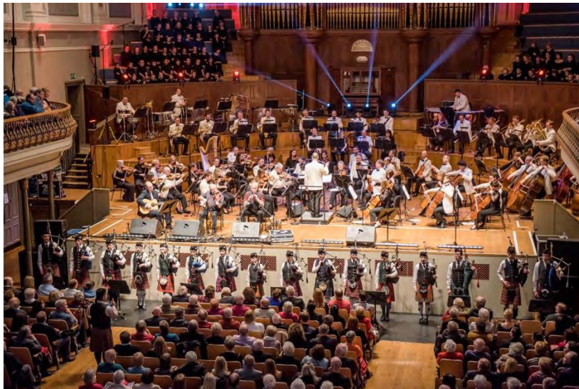
The Ulster-Scots Agency Juvenile Pipe Band perform with the Ulster Orchestra at the 2016 Burns Concert at the Ulster Hall, Belfast