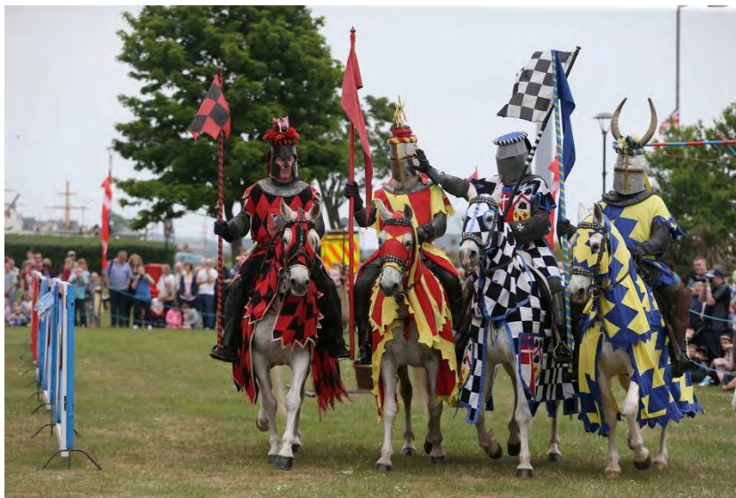
The Knights of Royal England jousting at the Bruce Festival, Carrickfergus The Knights of Royal England ag giústáil ag Féile na mBrúsach, an Charraig Fhearghais

Both Game Fair & Fine Food Festivals were attended by around 20,000 people in both June and September.