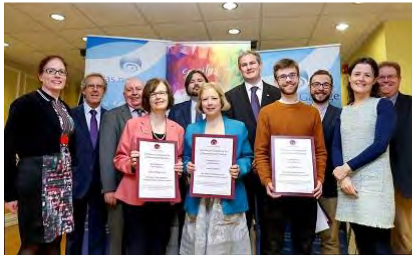
Minister of State Seán Kyne TD at the Translation Accreditation event . An tAire Stáit Sean Kyne TD ag bronnadh an tSéala Aistriúcháin.