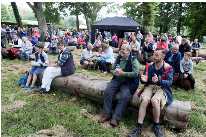
Lucht féachana ag amharc ar an stáitse ceoil ag Féile Dháil Riada Audience watching the music stage at Dalriada Festival

Bhí timpeall 20,000 duine i láthair ag an Aonach Géime agus ag Féilte Scothbhia i Meitheamh agus i Meán Fómhair.