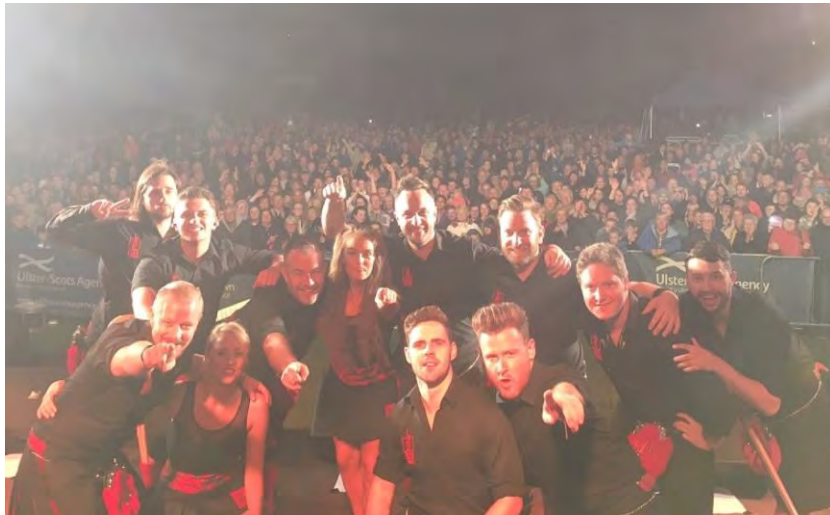
Red Hot Chilli Pipers, Domhnach Daoi Red Hot Chilli Pipers, Donaghadee

Bhí Gníomhaireacht na hUltaise i gcomhpháirt chomh maith le Comhairle Buirge na hArdá agus an Dúin Thuaidh le lá Ultaise a thabhairt i nDomhnach Daoi. Ar an Choimín i nDomhnach Daoi chuir raon bialann agus soláthraithe oidis agus taispeántais Ultach-Albanacha ar fáil le linn an lae, agus ina dhiaidh sin bhí seó tráthnóna ag na ceoltóirí a bhfuil cáil dhomhanda orthu na Red Hot Chilli Pipers. Bhí timpeall 8,000 duine i láthair ag an cheolchoirm.