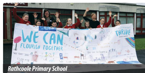
Rathcoole Primary School

THRiVE is based in Rathcoole and Monkstown, and is a network of parents, controlled schools, and statutory, voluntary and community organisations, who are all working together to enable local children and young people to do well at home and at school. CSSC is proud to be part of the THRiVE project board.