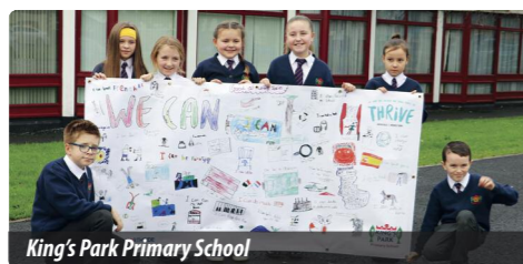
King's Park Primary School