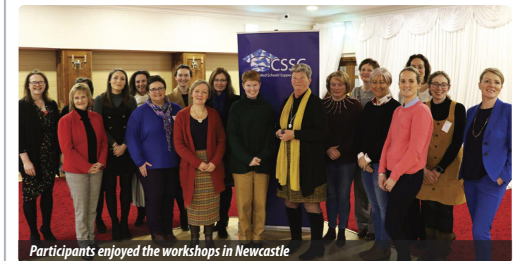
Participants enjoyed the workshops in Newcastle

Session one focused on relationship building and personal branding. Session two explored leadership and making choices, and participants were presented with a gratitude journal from the Itty Bitty Book Company.