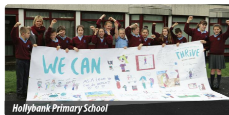
Hollybank Primary School